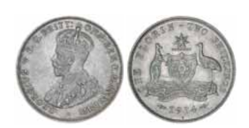
451* George V, 1914H. Very fine, eight pearls.