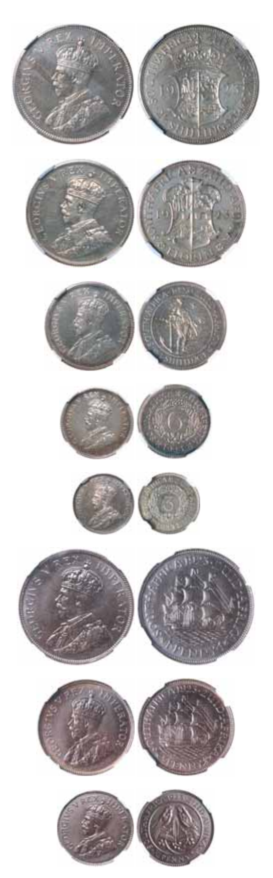
4489* South Africa, George V, proof set, halfcrown to farthing, 1923. With Pretoria Mint card case of issue, FDC. $1,400

Each coin in a slab by NGC as PF63 to PF67.