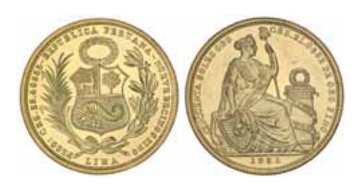
4231* Peru, forty soles, 1951 (KM.230). Surface marks on obverse, otherwise uncirculated and rare. $800