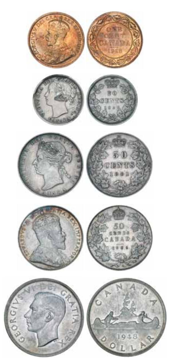
lot 4284 part