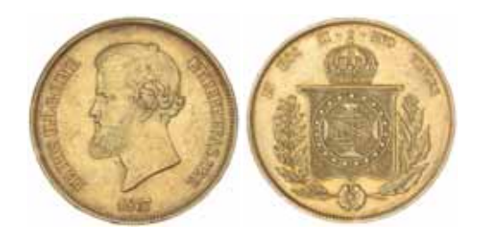
4186\,^* Brazil, Peter II, twenty thousand reis, 1867 (KM.468). Toned, extremely fine.