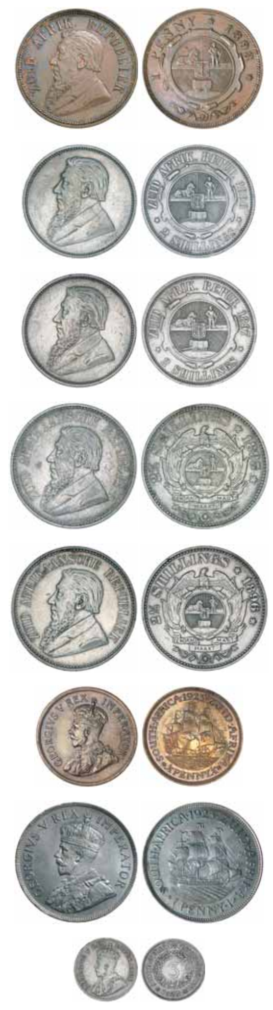
lot 4487 part