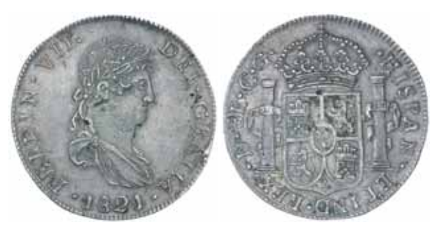
4432* Mexico , Ferdinand VII, silver eight reales, 1821CG, Durango Mint, another Zacatecas Mint (KM.111.2, 111.5). Toned, good very fine; polished very fine. (2)