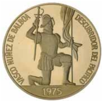
4230* Panama, proof five hundred balboas, 1975 (KM.42). Nearly FDC/FDC. $1,400