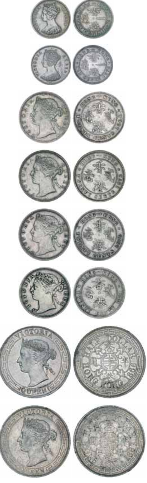
lot 4386 part (next page)