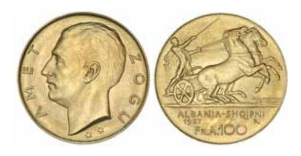
4184^{\ast} Albania, Zog I, one hundred franga ari, 1927R (KM.11a.3). Nearly uncirculated. $2,500