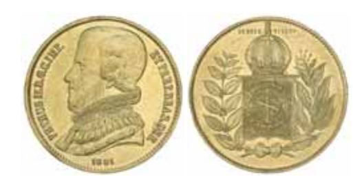
4185* Brazil, Peter II, twenty thousand reis, 1851 (KM.461). Cleaned, otherwise nearly extremely fine. $1,500