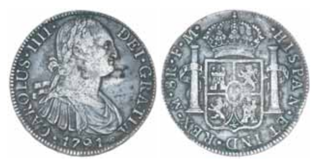
4431* Mexico , Charles IIII, silver eight reales, 1791 FM, Mexico City Mint, (KM.109). Fine, minor scratches and hoard patination .