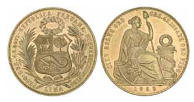
Peru, one hundred soles, 1959 (KM.231). Uncirculated. $2,250