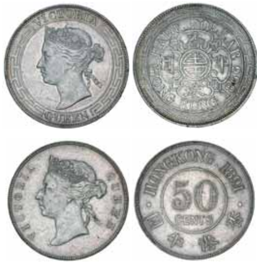
lot 4385 part