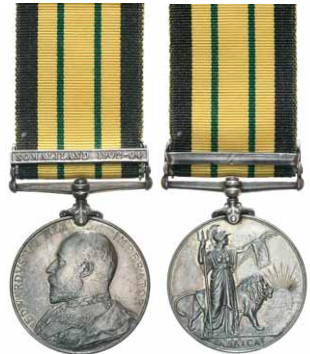
3906* Africa General Service Medal, (EVIR), - clasp - Somaliland 1902-04. H.Edwards. Sto. H.M.S.Highflyer. Impressed. Extremely fine.