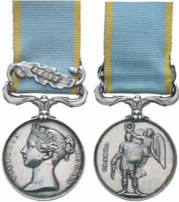
3889* Crimea Medal 1854 , - clasp - Azoff. Unnamed. Some scuffing and contact marks, otherwise good very fine.