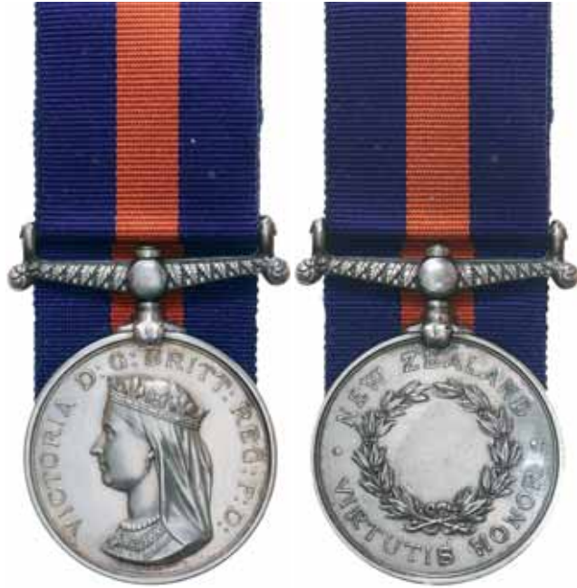
3891* New Zealand Medal 1869 , undated reverse. 3235. Driv: R.Cawthorne. 1/4. R.A. Engraved. Court mounted, hairlines, extremely fine.