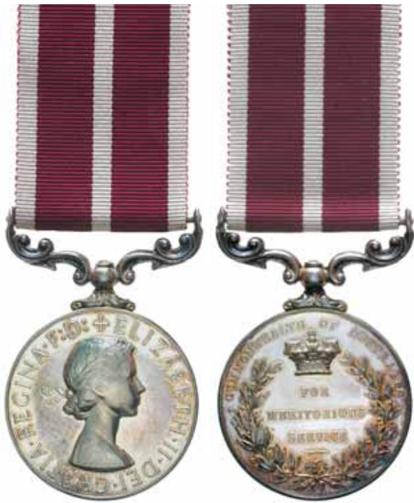
3980* Meritorious Service Medal , Commonwealth of Australia (EIIR). 4411026 A.Cartoon. Impressed. Good extremely fine.