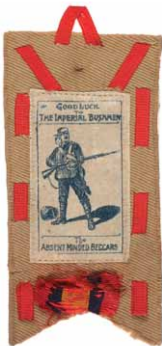
lot 4075 part