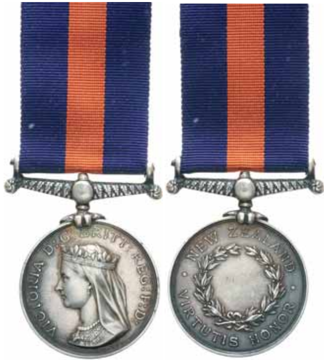
3892* New Zealand Medal 1869 , undated reverse. 913. Andr. Duncan, 99th Regt. Impressed. Nearly extremely fine. $750

Confirmed on medal roll entitlement dated 1869 as, 'New Zealand/date not shown/Wounded/Discharged'.