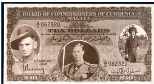
lot 4027 part