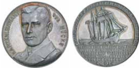
808* Captain Lieutenant Von Mucke , Emden 1914, Emden II 1915, in silver (33mm) by L.Ch.Lauer, Nuremberg (MH 431). Attractive golden grey tone, nearly FDC and rare.