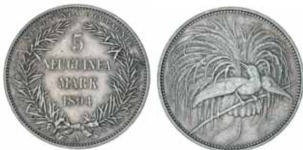
637* German New Guinea , five mark, 1894A. Toned, good very fine.