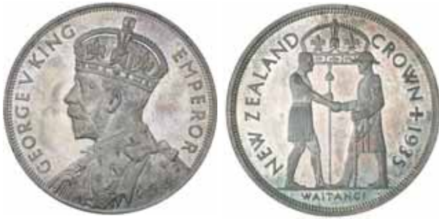
673* George V , Royal Mint London, proof Waitangi crown, 1935. Toned, FDC and rare.