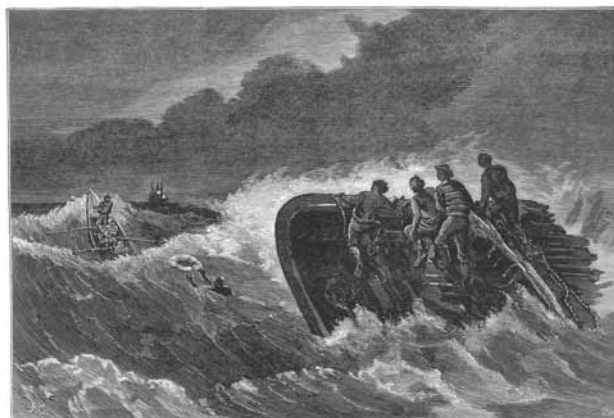
WRECK OF THE BARQUE AGNES ON CARPENTERS ROCK, N. S. W.