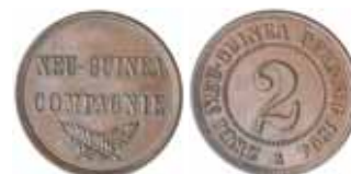
653 German New Guinea, two pfennig, 1894A. Nearly extremely fine.