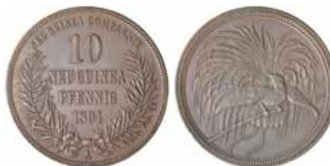
650* German New Guinea, ten pfennig, 1894A. Nearly extremely fine.