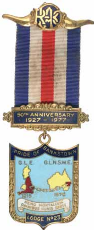
lot 882 part