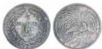
647* German New Guinea, half mark, 1894A. Nearly very fine.