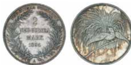
639* German New Guinea , two mark, 1894A. Proof-like, good extremely fine.