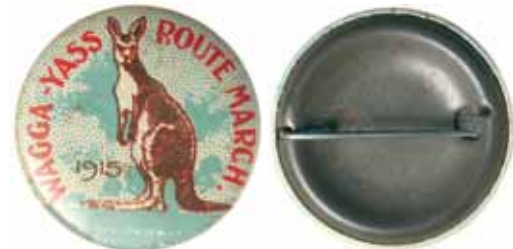
812* Kangaroo recruiting march tin badge , Wagga-Yass Route March, 1915. Extremely fine and hard to find in this condition.

The anti-German movement in Australia was in part driven by the Patriots League, an organisation of people of British birth or descent who raised money for the war effort, spoke in favour of conscription and exhorted all Australians to sign the 'Patriotic Pledge'. This badge was issued by them and is one of the rarest anti-German themed WWI badges.