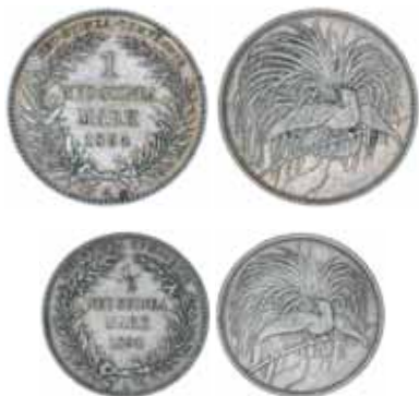
645* German New Guinea, one mark and half mark, 1894A. Good very fine; very fine. (2)