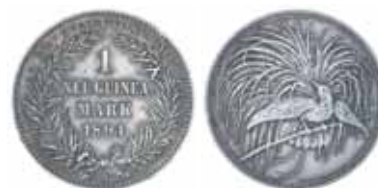
642* German New Guinea , one mark, 1894A. Toned, good very fine.