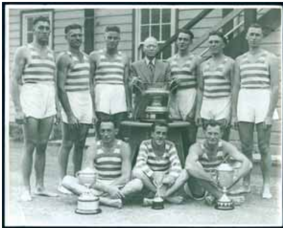
lot 979 part