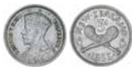
678* George V , threepence, 1935. Extremely fine.