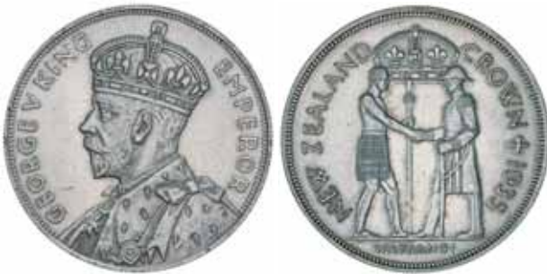
674* George V , Waitangi crown, 1935. Reverse hairline left field, good extremely fine with underlying brilliance.