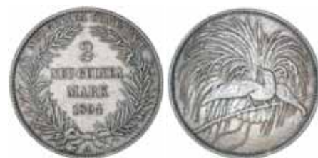
640* German New Guinea , two mark, 1894A. Toned, a little rubbed, otherwise good very fine.