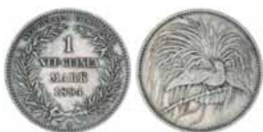
644* German New Guinea, one mark, 1894A. Very fine.