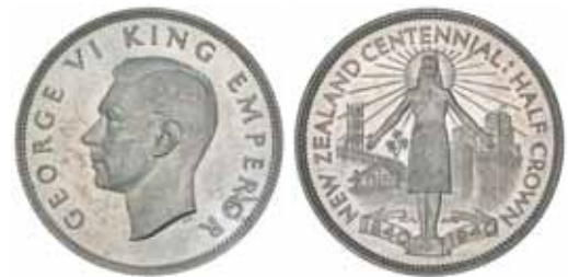
680* George VI , Royal Mint, proof Centennial halfcrown, 1940. FDC and extremely rare as a proof.