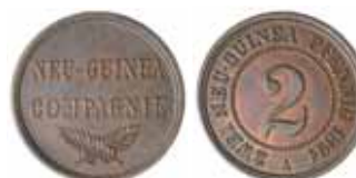
651* German New Guinea, two pfennig, 1894A. Brown and dull red, nearly extremely fine.