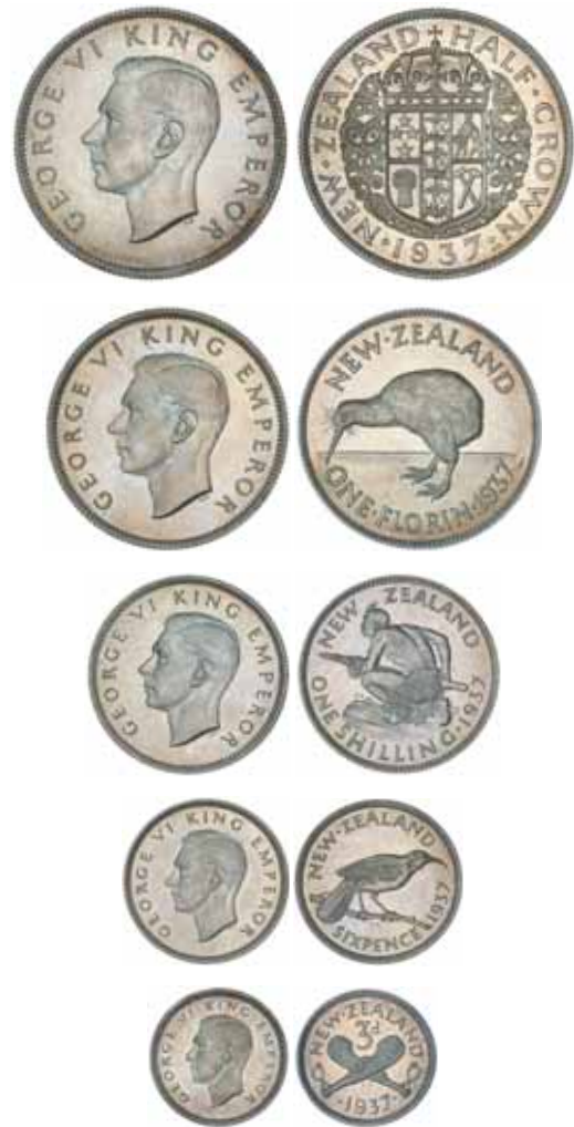
679* George VI , Royal Mint proof set, halfcrown to threepence, 1937. FDC and extremely rare. (5)