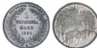
643* German New Guinea , one mark, 1894A. Rim nick at 11 o'clock on the reverse, otherwise extremely fine.