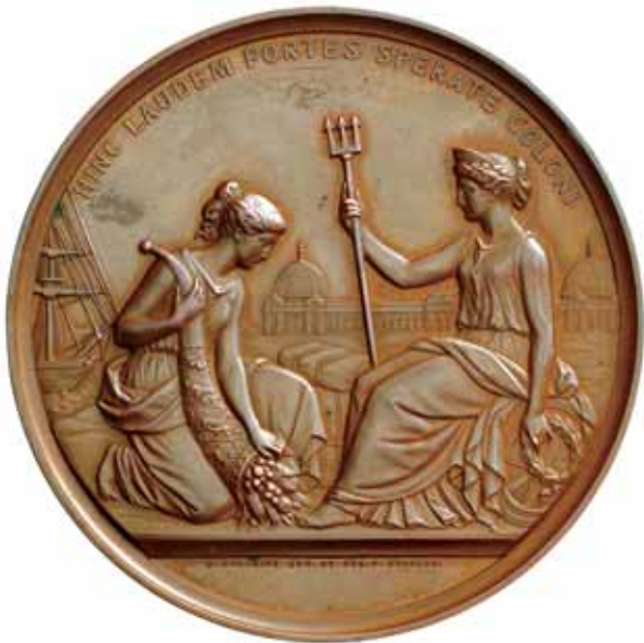
749* New South Wales Prize Exhibitors medal, 1862 (London) in bronze (76mm) uninscribed. Good extremely fine and rare in this metal.