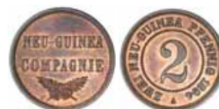
652* German New Guinea, two pfennig, 1894A. Red and brown, good extremely fine.