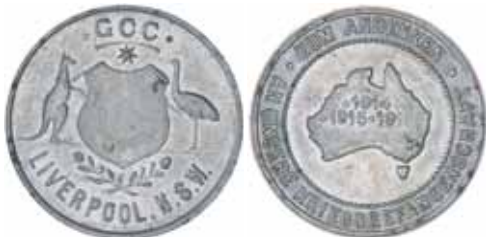
809* G(erman) C(oncentration) C(amp) , Liverpool, NSW, 1916, in aluminium (31mm) by Amor (C.1916/4). Extremely fine and rare.