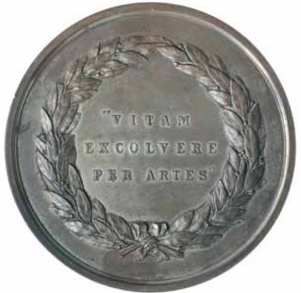
774* Melbourne International Exhibition, 1880 , in white metal (76mm) by H.Stokes, possibly a trial strike. Very fine and rare in this metal.