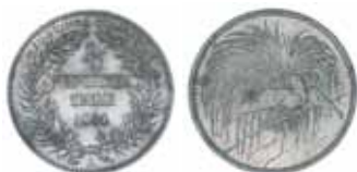
646* German New Guinea, half mark, 1894A. Good extremely fine.