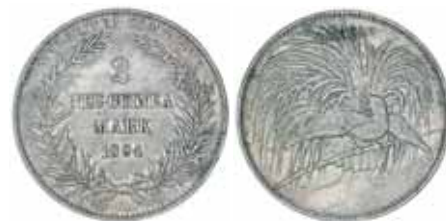
641* German New Guinea , two mark, 1894A. Good very fine.