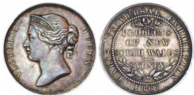
751* Products of New South Wales, Paris Universal Exhibition 1867, in silver (39mm) by L.C. Wyon, edge inscribed 'Doctor Trail For Services'. Rim bruises, otherwise nearly extremely fine and very rare in silver, no representation in the Chapman Collection.

Ex Dr John M.Chapman Collection, Noble Numismatics Sale 88 (lot 992).