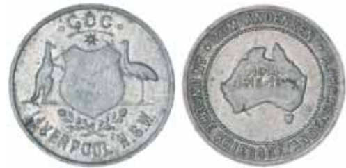
810* G(erman) C(oncentration) C(amp) , Liverpool, NSW, 1916, in aluminium (31mm) by Amor (C.1916/4). Nearly extremely fine and rare.