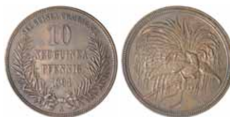
649* German New Guinea, ten pfennig, 1894A. Nearly extremely fine.