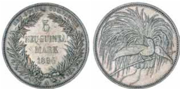
636* German New Guinea , five mark, 1894A. Underlying mint bloom, light grey and iridescent toning, extremely fine.