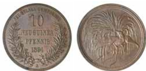
648* German New Guinea, ten pfennig, 1894A. Good extremely fine.