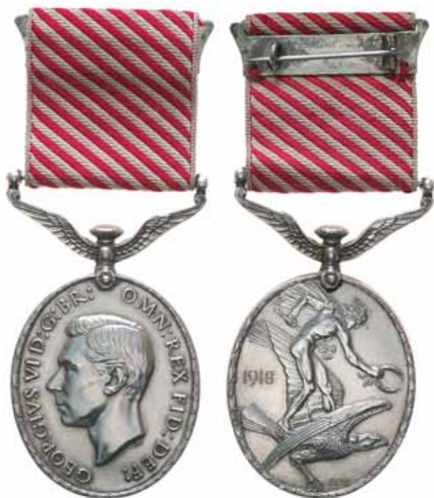
3718* Air Force Medal , (GVIR FID:DEF). 4016202. Plt.II. W.W.Green. R.A.F. Engraved. Good extremely fine. $2,500

AFM: Supplement to LG 9/6/1949, p2824. With copy of gazette page.