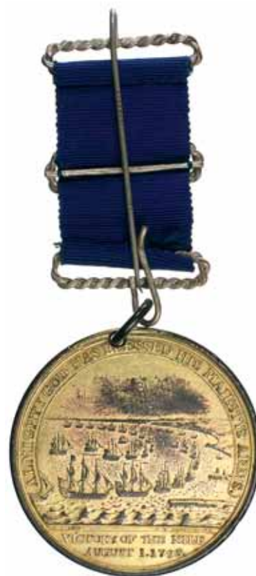
3720* Davison's Nile Medal , 1798, in gilt bronze as issued to Petty Officers. A few rim bumps, very fine. $600