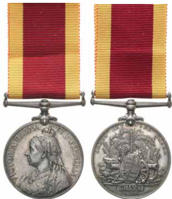
3762* China War Medal 1900. T.W.Pearce, Sign. N.S.Wales Nav. Contgt. Impressed. Extremely fine.