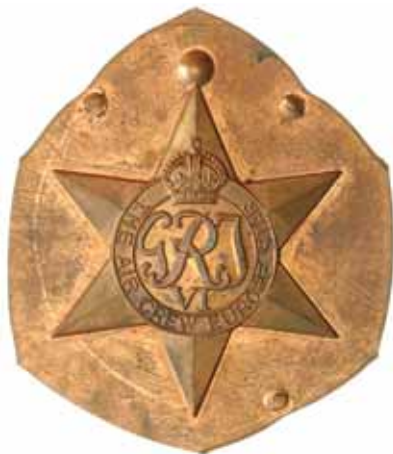
3767* Air Crew Europe Star, test strikes in bronze. Extremely fine and rare. (3) $300