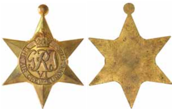
3768* Air Crew Europe Star. An unfinished example, very fine. $200