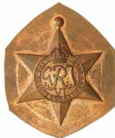
3769* France and Germany Star, test strike in bronze. Extremely fine and rare. $100