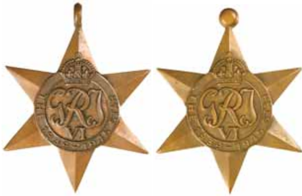
3765* 1939-45 Star. Production samples, very fine. (2) $150

Ex Amor archives, showing two stages in production of suspension ring.