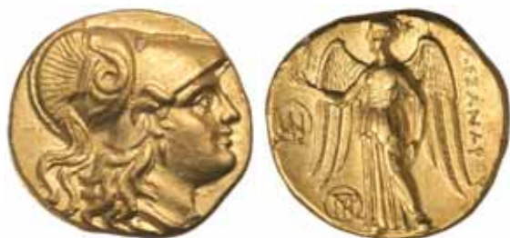
lot 3866 (enlarged)

Ex Noble Numismatics Auction Sale 100 (lot 3359).