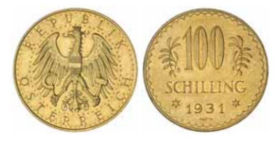
3113 Austria , Republic, one hundred schilling, 1931 (KM.2842). Nearly uncirculated. $900