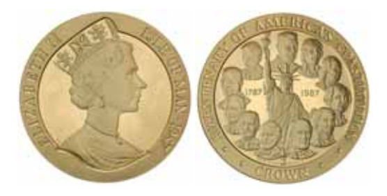
3172* Isle of Man, Elizabeth II, proof half ounce fine gold crown, 1987, US Constitution Bicentenary (KM.176c). FDC .