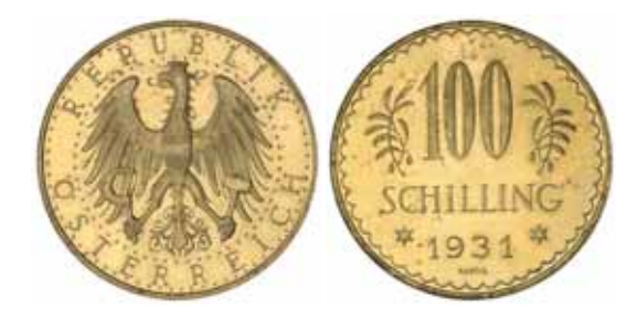
3112* Austria, Republic, one hundred schilling, 1931 (KM.2842). Proof-like, uncirculated.