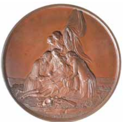
2227* Art Union of London , 1866, Benjamin West, in bronze (55mm) by W.Wilson (BHM 2862; E1589). Good extremely fine