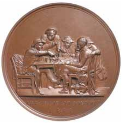
2225* Art Union of London , 1861, Sir David Wilke, in bronze (55mm) by L.Wyon (BHM 2704; E1549). Good extremely fine.