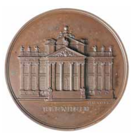
lot 2223 reverse