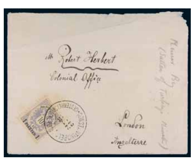
lot 2326 part (following page)

British Commonwealth, in four large loose leaf albums, British Pacific on Seven Seas leaves for Norfolk Island (1947-1972), PNG 1952 set to pound and part or incomplete sets to 1979, and two large stock books of AAT and New Zealand (these mostly used) and two small stock books, a mixed collection mostly arranged alphabetically with sets and short sets and part sets mostly c. late 1930s - 1950s, noted individual 1935 Jubilee, UPU, Peace and 1953 coronation issues scattered throughout, many issues mounted on Hagner mounts, useful pickings throughout, two albums each for Caribbean and Pacific. MUH , mint and used . (100s)