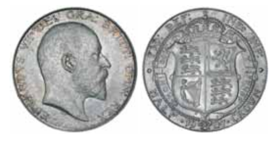
Edward VII, halfcrown, 1907 (S.3980). Lightly toned, uncirculated.