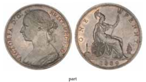
1960* Queen Victoria, pennies, bun head, 1889 (dies 13/N) and 1890 (2) (S.3954). First dark brown with traces of red, second brown and red, third cleaned red, good extremely fine. (3)