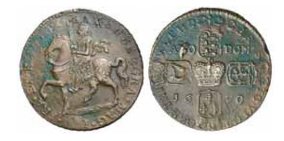
Ireland, James II, Gunmoney crown, 1690 (S.6578). Toned, very fine.