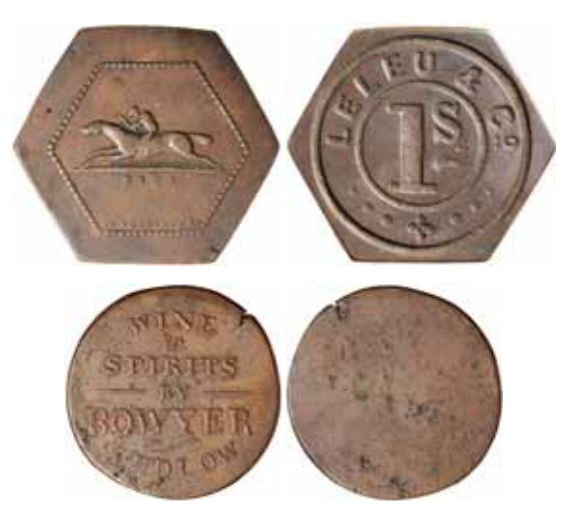
lot 2156 part

Ex W.J. Noble Collection, Sale 61B (lot 1173) previously the second probably ex Parsons (lot 1060 part) Collection and Spink in 1972 via B.Warwick, the third from Spink in 1973.