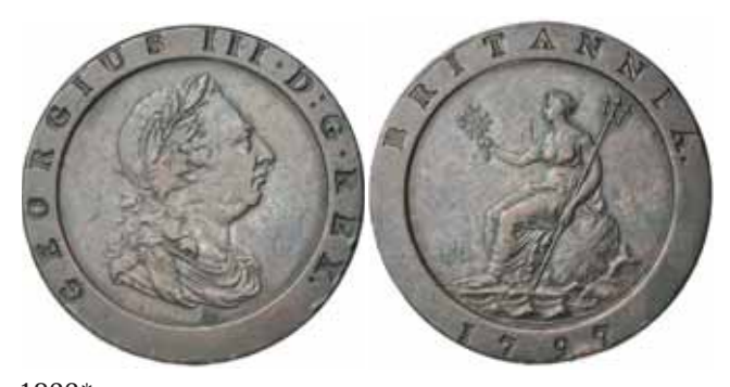
1832* George III, copper cartwheel twopence, 1797 (S.3776). Good very fine.

Lot includes NGC stamp and sticker as MS 64 BN No.3587611-001.