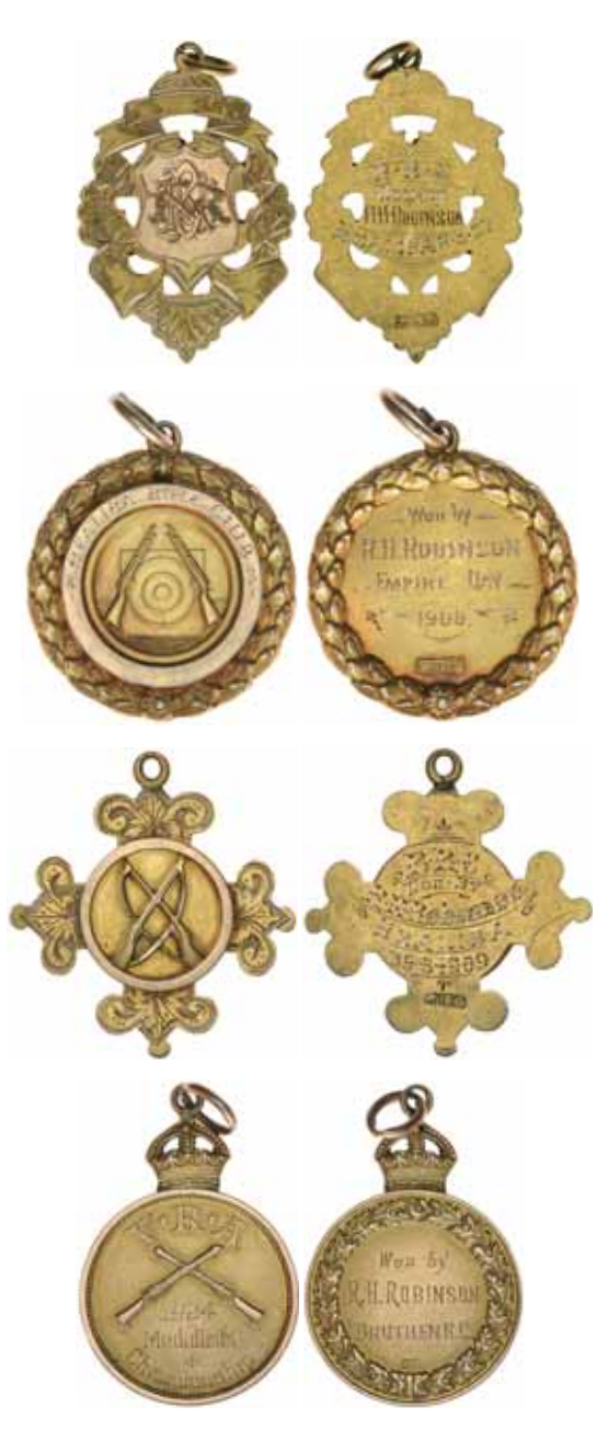
lot 868 part

Lady Northcote was sponsor of this exhibition that was held in the Melbourne Exhibition Building with the opening ceremony on 23 October 1907. The exhibition continued for almost six weeks and included approximately 16,000 exhibits.