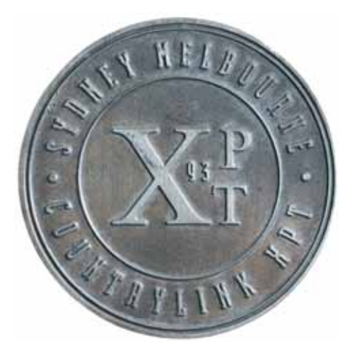
Sydney Melbourne Countrylink XPT, undated (1993), in antique silvered bronze (60mm), obverse, image of XPT train, reverse, X93P/T. Extremely fine.