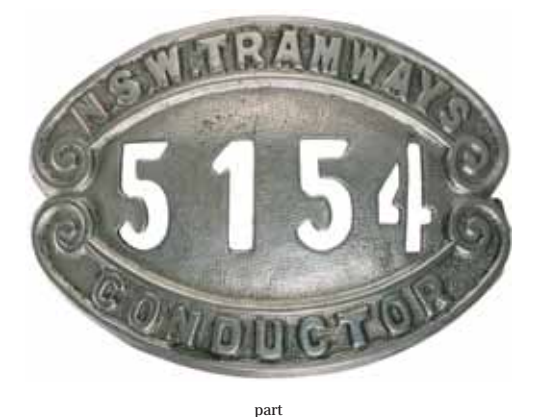
N.S.W.Tramways , Conductor badge, voided no.5154, in white metal; N.S.W.Tramways, Driver badge no.452 in gilt and enamel. The last with a few spots of enamel loss, otherwise good very fine and both scarce. (2)