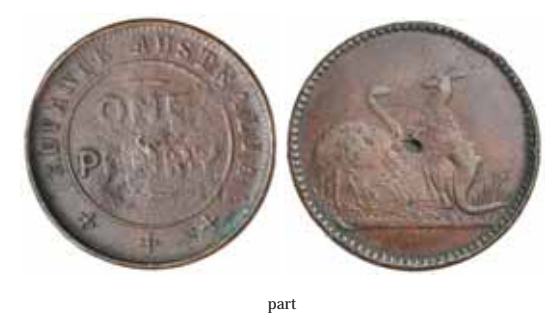
Whitty & Brown, Sydney pennies, undated (A.632, 634) (2) kangaroo and emu penny, undated (A.635 [illustrated]). The first with die axis upset by 180 degrees, the second 45 degrees to the left, the third 45 degrees to the right, fine - very fine. (3)