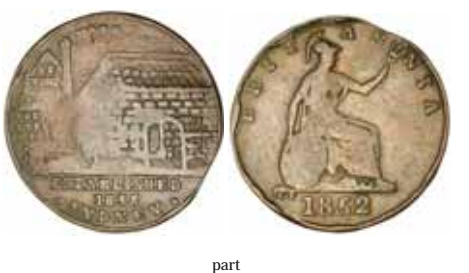
Peek and Campbell, Tea Stores, Sydney halfpenny, 1852 (A.428). Very good; good fine. (2) $200