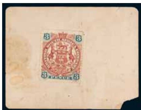
4033* South Africa , Boer War, Bulawayo, H.Marshall Hole, 1900 issue, 1st August 1900, threepence (PS.662c). Fine, water marks and corner missing.