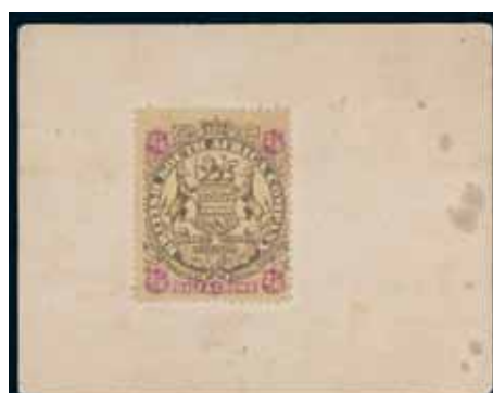
4036* South Africa , Boer War, Bulawayo, H.Marshall Hole, 1900 issue, 1st August 1900, two shillings and sixpence (PS.667a). Very fine, scarce in this condition.