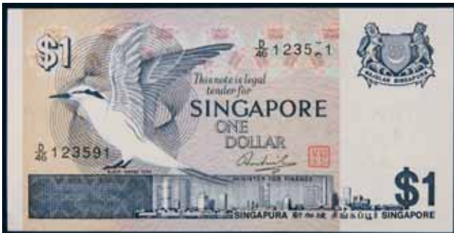
4021* Singapore , one dollar, undated (1976), D/46 123571 and D/46 123591 serial number error, first number missing second last numeral with imprint midway between 8 and 9 (P.9). Uncirculated.