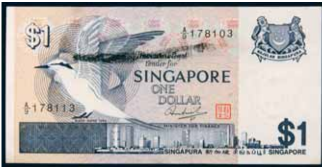
4020* Singapore , one dollar, undated (1976) A/9 178103 and A/9 178113 mis-matched serial numbers (P.9). Ink stain on front from printing process and light tone spots on bottom edge, otherwise centre fold good extremely fine and rare.