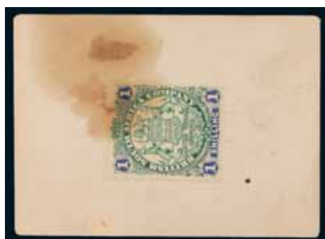
4034* South Africa , Boer War, Bulawayo, H.Marshall Hole, 1900 issue, 1st August 1900, one shilling (PS.665b). Fine, central brown stain.