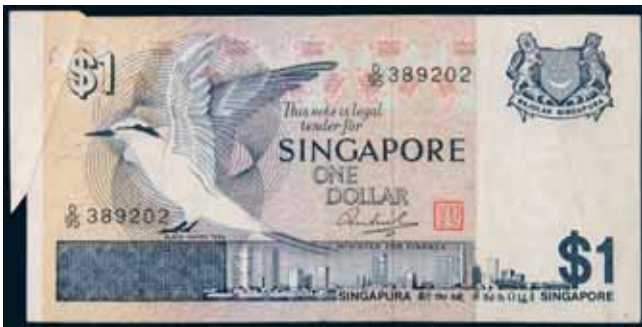
4022* Singapore , one dollar, undated (1976), D/95 389202 with paper flap at top left corner (P.9). Very fine.