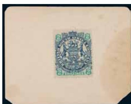
4035* South Africa , Boer War, Bulawayo, H.Marshall Hole, 1900 issue, 1st August 1900, two shillings (PS.666a). Fine, light brown stain and corner missing.