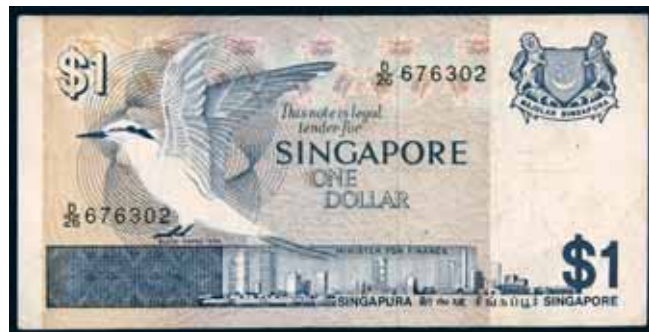
4024* Singapore , one dollar, undated (1976), D/26 676302 no signature or red seal (P.9); another identical, D/69 585928 no red seal beside signature (P.9). Nearly very fine; very fine. (2)