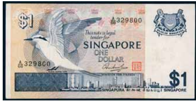
4023* Singapore , one dollar, undated (1976), A/68 329800 and A/68 3298C0 serial number error where second last 0 of second number has not registered properly resulting in C (P.9); another identical, D/53 495508 with serial numbers registered out of alignment (P.9). Very fine. (2)