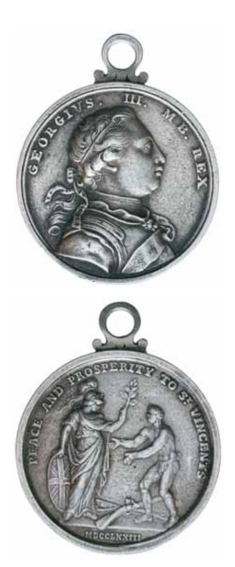
3397* Carib War Medal, 1773, George III, in silver (54mm) cast and chased as issued with loop suspension. Good very fine and very rare.