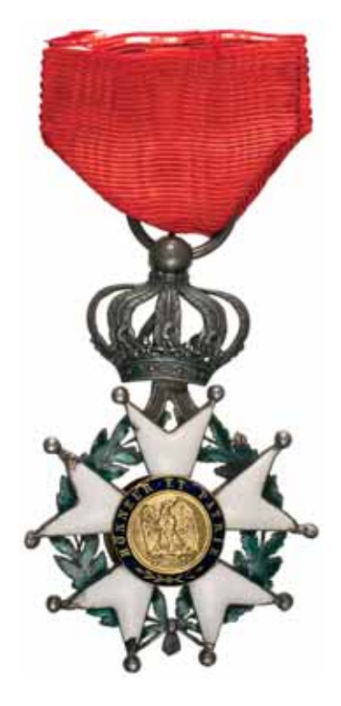
3544* France, First Empire Legion of Honour, Knight. Some enamel

Belgium , Yser Medal 1914; Victory Medal 1914-18; Commemorative Medal 1914-18. Fine - extremely fine. (3) $100