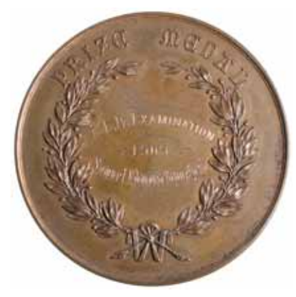
lot 3498 part