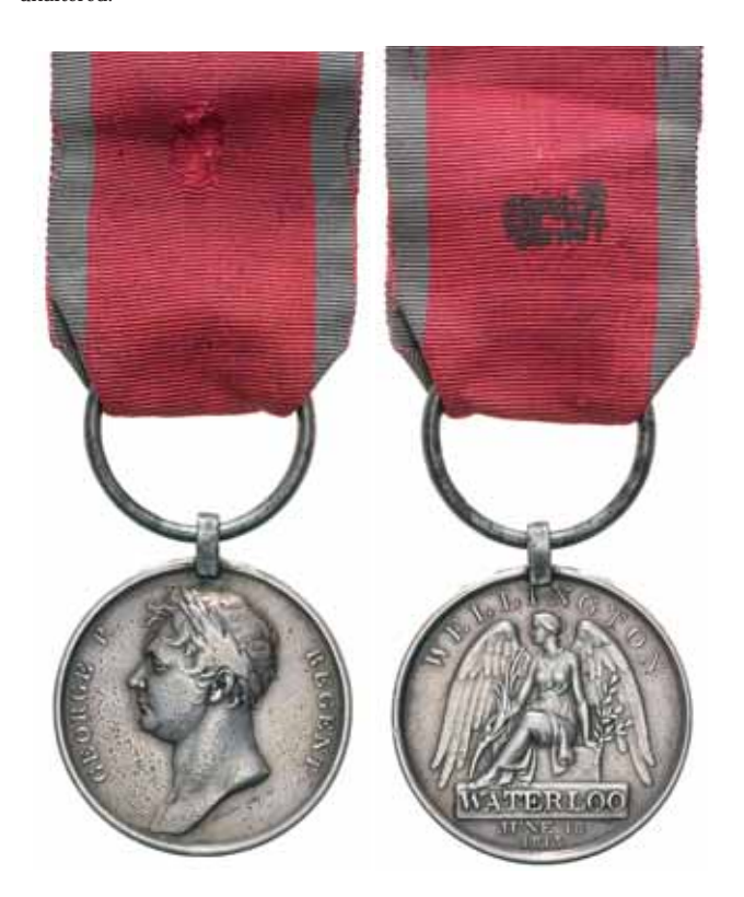
3401* Waterloo Medal 1815 , John Pasket 1st Batt 95th Regt Foot. Impressed. Fitted with steel clip and ring suspension, contact marks in field, fine.

Cannot locate on medal roll but naming appears to be genuine and unaltered.