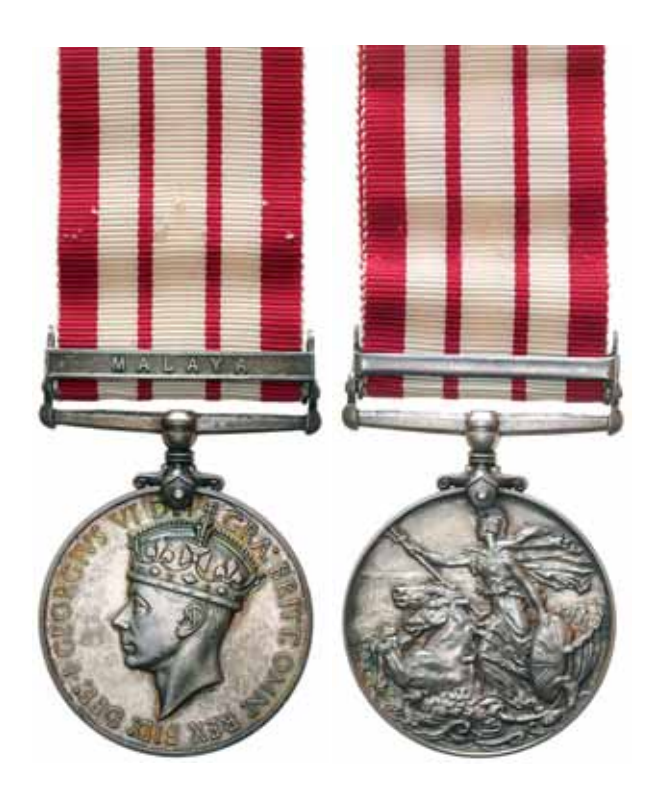
3422* Naval General Service Medal 1915-62, (GVIR), - clasp - Malaya. RM.8362 J.W.Pease Mne. RM. Impressed. Extremely fine.