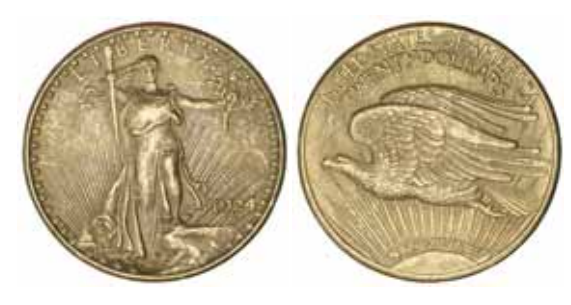
2279* USA , twenty dollars or double eagle, 1924, St.Gaudens. Frosted finish, good extremely fine. $1,500