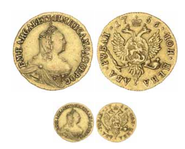
2220^{\ast} Russia, Elizabeth I, two roubles, 1756 (KM.C.23.1). Good very fine. $800