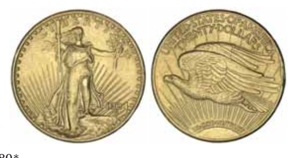
2280* USA, twenty dollars or double eagle, 1924, St.Gaudens. Good extremely fine. $1,300