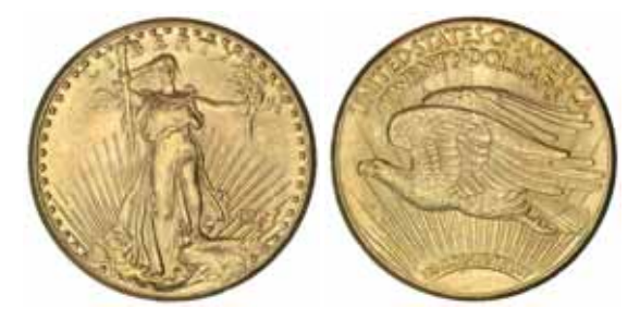
2281* USA, twenty dollars or double eagle, 1927, St.Gaudens. Nearly uncirculated.