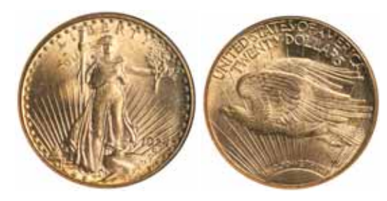
2278* USA , twenty dollars or double eagle, 1924, St.Gaudens. Uncirculated .