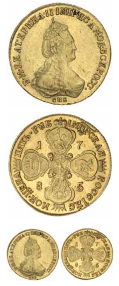
2221^{\ast} Russia, Catherine II (the Great) five roubles, 1785, St. Petersburg (KM.C.78c). Nearly extremely fine. $2,500