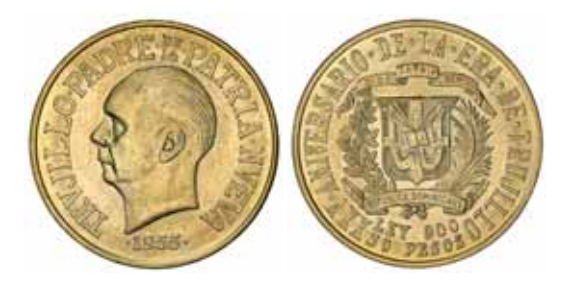
2141* Dominican Republic, thirty pesos, 1955 (KM.24). Nearly uncirculated.