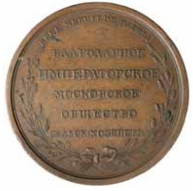
lot 2104 reverse