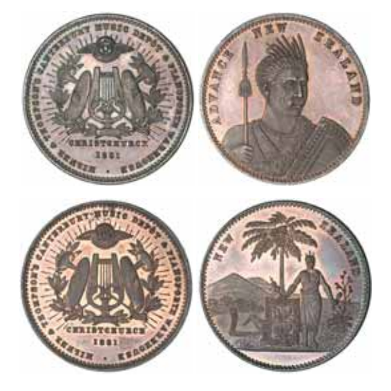
Milner & Thompson , Christchurch pennies, 1881 (A.379, 380). Uncirculated; full original brilliant mint red, choice uncirculated. (2)

The first ex Status Sale, May 2009 (lot 6652).