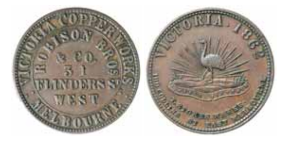
Robison Bros. , & Co., Melbourne penny, 1862 (A.461). Medium brown patina, nearly extremely fine.