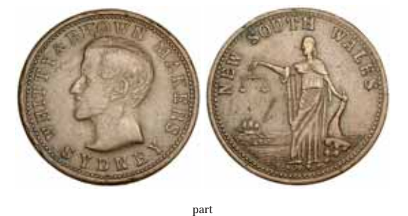
Whitty & Brown, Sydney pennies, undated (A.623, 624, 627, 629, 630). Fine - very fine. (5)

Ex Dr.J.Powell Collection, private purchase from Spink Australia 16/7/81, mostly ex A.H.Baldwin.