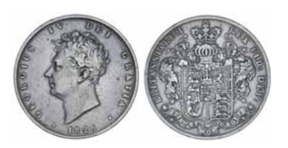
1931* George IV , bare head, halfcrown, 1826 (S.3809). Nearly very fine. $120