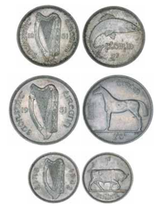
1993* Ireland, Irish Free State, florin and halfcrown, 1931 (KM.7, 8); Republic, shilling, 1942 (KM.14). Toned, extremely fine; extremely fine; uncirculated. (3) $330