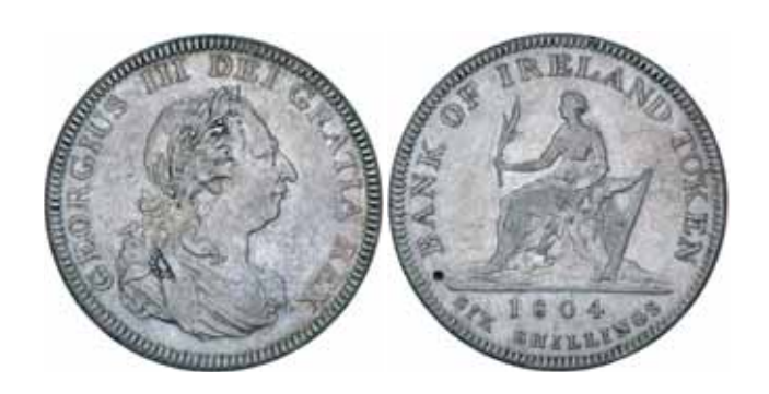
1990* Ireland, George III, Bank of Ireland token, six shillings, 1804, leaf to left side of E (S.6615). Very fine or better.