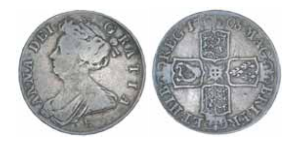
1896* Anne, after the Union, halfcrown, 1708E (S.3605). Toned, very good/nearly fine.