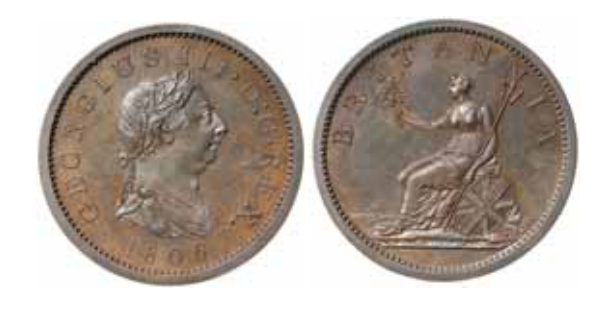
1925* George III , fourth issue, copper proof penny 1806, plain edge (Peck 1350; S.3780) restruck by Soho Mint, Birmingham. Nearly FDC. $500