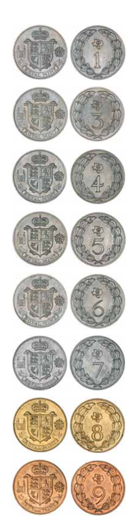
Elizabeth II, Royal mint, metal samples (23mm), numbers 1, 3, 4, 5 and 6 in nickel or cupro-nickel, number 7 in aluminium, number 8 in brass and number 9 in bronze. Nearly uncirculated - uncirculated . (8)