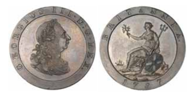
1923* George III , bronzed proof cartwheel penny, 1797 (late Soho) (Peck 1118; S.3777). Nearly FDC and very scarce.