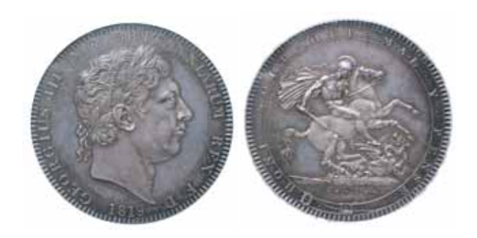
1927* George III , new coinage, proof crown, 1819, LX edge (S.3787). Deep olive and grey brilliant tone, lightest friction on high points, otherwise FDC and extremely rare as such.