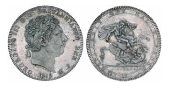
1926* George III, new coinage, silver crown, 1818 LVIII, (S.3787, ESC 211) About as struck with proof-like surface, lightly toned, uncirculated.