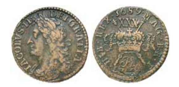
1989* Ireland, James II, gunmoney halfcrown, large size, Feb? 1689 (S.6579; KM.95). Good fine.