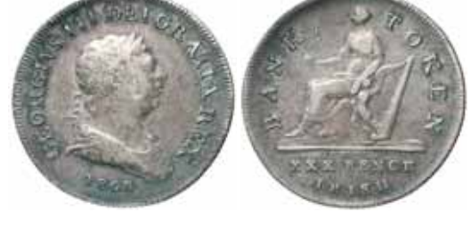
1992* Ireland, George III, bank token, thirty pence Irish, 1808 (S.6616A). Very fine. $150