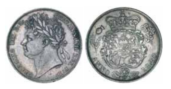
1930* George IV, laureate head, halfcrown, 1820 (S.3807). Very fine . $150