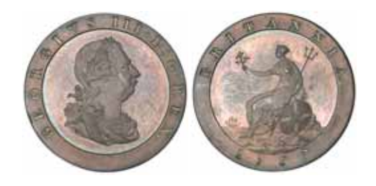
1924* George III , pattern cartwheel halfpenny, 1797, engrailed edge (Peck 1154). Original pink copper toning, FDC and rare. $1,500