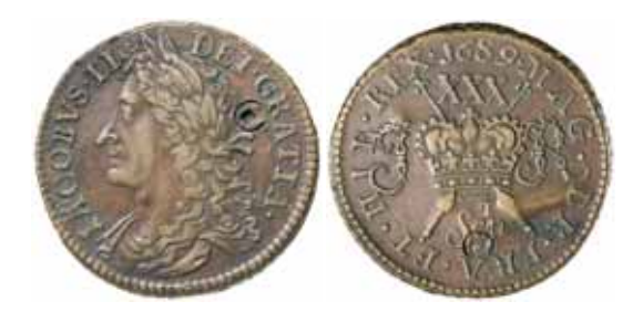
1988* Ireland, James II, gunmoney halfcrown, 1689 Sepr, C punchmark on both sides (S.6579D). Good very fine .