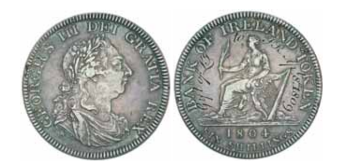
1991* Ireland , George III, Bank of Ireland token, six shillings, 1804 (S.6615) no stop after Rex, top leaf points to upright of E, engraved as love token 'Gift of LJ to SR Aprl 8th 1809'. Toned, nearly very fine.