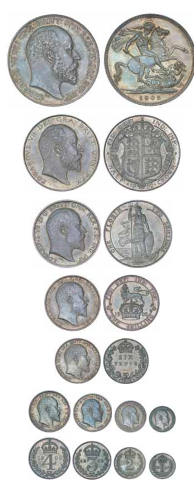
lot 1829 part