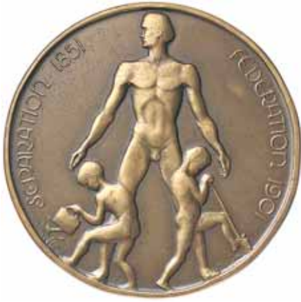
1102* Separation 1851 Federation 1901 , c1951, in bronze (58mm) by A.Meszaros (C.S/2), minted by Pinches for Numismatic Association of Victoria. Uncirculated.