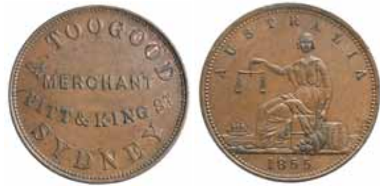
1257* Toogood, A. , Sydney penny, 1855 (A.587). Two obverse die breaks, even brown with traces of mint red, nearly uncirculated.