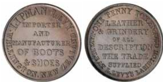
1209* Levy, Lipman, Wellington penny , undated (A.321) upset die axis. Toned, nearly uncirculated and scarce thus.