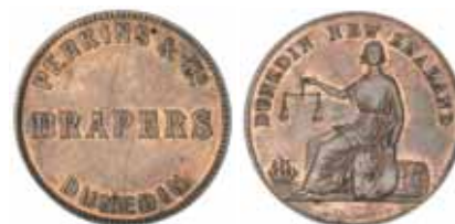
1235* Perkins & Co., Dunedin halfpenny, undated (A.436). Cleaned, minor hairlines, good very fine/very fine and rare. $180

Ex Spink Noble Sale 42 (lot 1914) and M.Ward Collection.