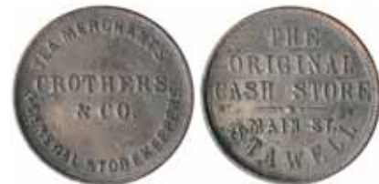
1161* Crothers & Co. , Stawell halfpenny, undated (A.89). Nearly very fine and scarce.