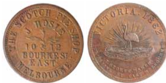
1195* Hosie, J. , Melbourne penny, 1862 (A.267), Brown patina, hints of red, good very fine.