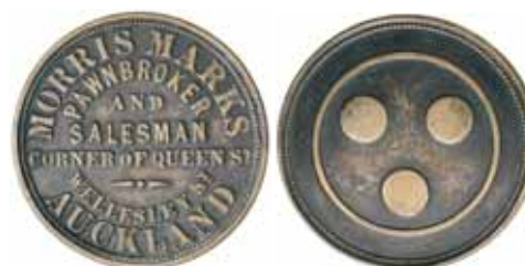
1216* Marks, Morris, Auckland penny , undated (A.341). Dark grey patina, good very fine.

Ex Spink Noble Sale 40 (lot 560) and M.Ward Collection.