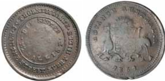
1254* Thornthwaite, J.C. , Sydney penny, 1854 (A.579). Weak in centre as always, dark brown patina, very fine and rare.

Ex Strathburn Collection (lot 2895 part) and M.Ward Collection.