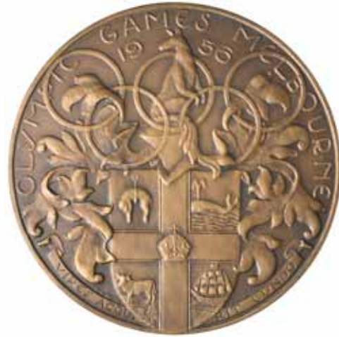
1104* Olympic Games Melbourne , 1956, in bronze (63.5mm) by Andor Meszaros, struck by K.G.Luke (C.1956/5). In maker's plastic capsule, uncirculated.