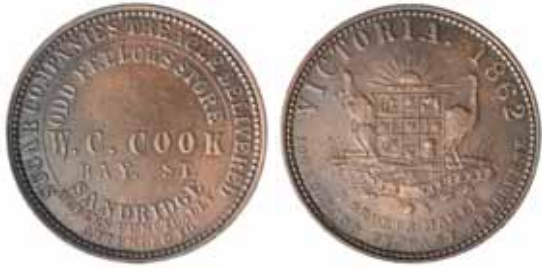
1156* Cook, W.C. , Sandridge penny, 1862 (A.75). Good very fine and very scarce.