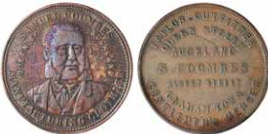
1157* Coombes, Samuel , Auckland penny, undated (A.78). Good fine and very scarce.