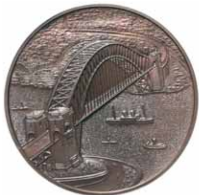
1088* Sydney Harbour Bridge , Opened 19th March 1932 Inaugural Celebrations, in bronze (51mm) by Amor (C.1932/5) edge impressed, 'Specimen Only' Possibly unique, good extremely fine.

Ex Carl Veen Collection, previously from Dave Allen.