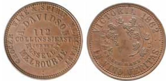
1162* Davidson, A. , Wellington penny, 1862 (A.93). Nearly extremely fine and scarce, one of the finest known.