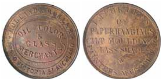
1194* Holland & Butler , Auckland penny, undated (A.263). Brown and red, uncirculated and rare thus.