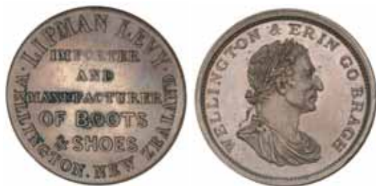
1211* Levy, Lipman, Wellington penny , undated, Wellington head pattern by W.J.Taylor (A.323) upset die axis. Attractively toned, nearly FDC and very scarce.