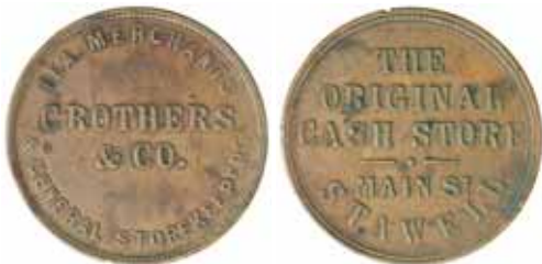
1159* Crothers & Co. , Stawell penny, undated (A.86). Small edge cut, good very fine.