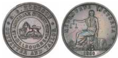
1193* Hodgson, A.G. , Melbourne halfpenny, 1860 (A.256). Dark grey patina, nearly extremely fine.