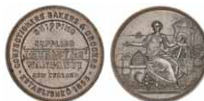
1198* Hurley, J. & Co. , Wanganui halfpenny, undated (A.277) by Todman London. Good extremely fine.