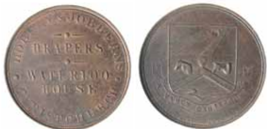
1192* Hobday & Jobberns , Christchurch penny, undated (A.249). Grey patina with hints of red, extremely fine.