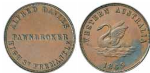
1163* Davies Alfred , Fremantle penny, 1865 (A.94). Light red brown patina, nearly extremely fine.