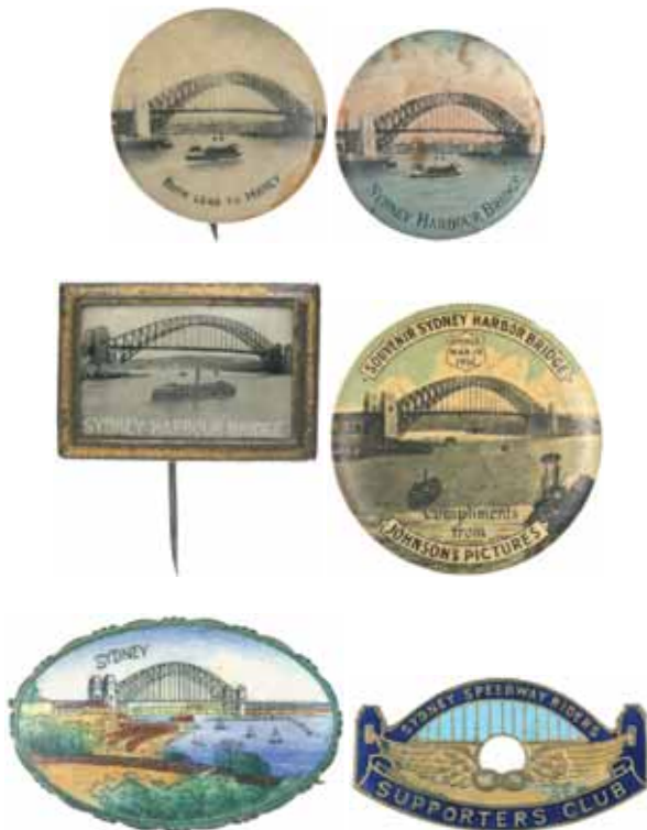
lot 1092 part