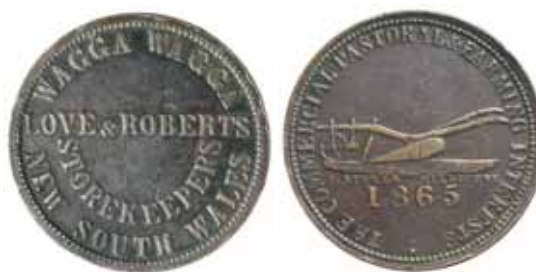
1214* Love & Roberts, Wagga Wagga penny , 1865 (A.336). Grey brown tone, very fine and rare.