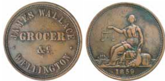
1258* Wallace, James , Wellington penny, 1859 (A.592). Nearly very fine/good fine.

Ex Strathburn Collection (lot 2887) and M.Ward Collection.