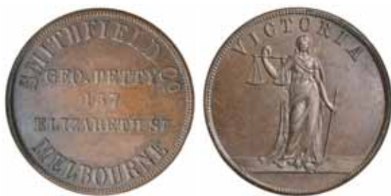
1239* Petty, Geo., Melbourne penny , undated (A.440) W.J. Taylor London visible on groundline, upset die axis. Nearly uncirculated and rare in this state. $300 Ex M.Ward Collection.