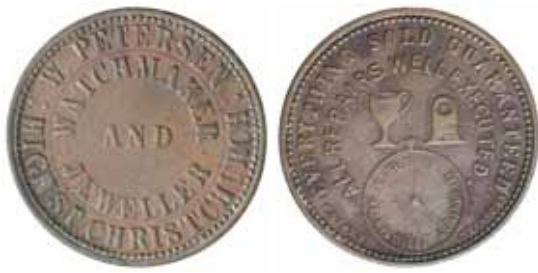
1236* Petersen, W. , Christchurch penny, undated (A.437). Very fine. $200