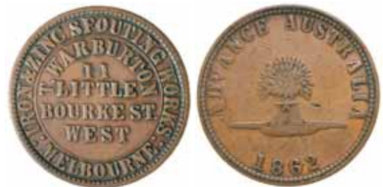
1259* Warburton, T. , Melbourne penny, 1862 (A.600). Even brown patina, nearly very fine and scarce.

Ex Strathburn Collection (lot 2890) and M.Ward Collection.