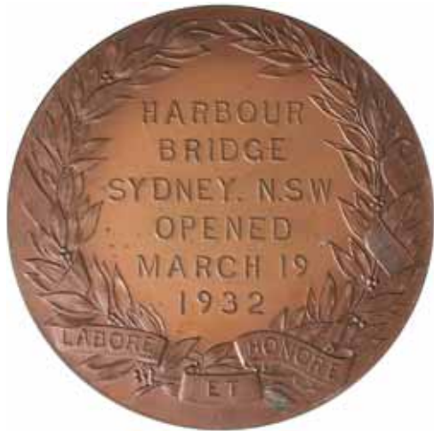
1091* Harbour Bridge Sydney N.S.W. Opened March 19 1932, in bronze (63mm) by Angus & Cooté, designed by R.M.Phipps (C.1932/7). Good extremely fine.