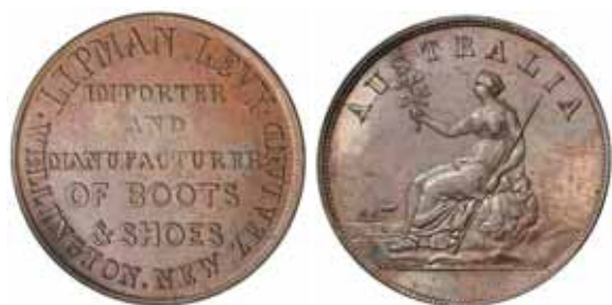
1212* Levy, Lipman, Wellington penny , undated, Australia seated figure by W.J.Taylor London (A.324). Toned, nearly FDC and rare.

Ex Spink Australia Sale 40 (lot 563) and M.Ward Collection.