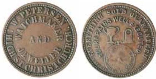
1237* Petersen, W. , Christchurch penny, undated (A.437). Nearly very fine and very scarce. $150 Ex Spink Noble Sale 37 (lot 681).