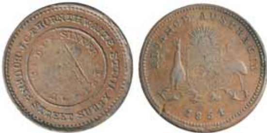
1253* Thornthwaite, J.C. , Sydney penny, 1854 (A.579). Weak in centre as always and two flan flaws, otherwise medium brown patina, good very fine and rare.

Ex Strathburn Collection (lot 2892) and M.Ward Collection.