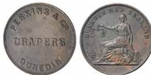
1234* Perkins & Co., Dunedin penny, undated (A.435). Die breaks on both sides, glossy grey brown patina, nearly extremely fine. $150