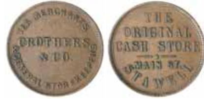
1160* Crothers & Co. , Stawell halfpenny, undated (A.89). Even brown patina, good very fine and scarce.