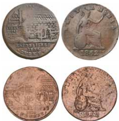
1230 Morrin & Co., Auckland pennies, undated (A.387, 388). Edge knocks very fine; very good. (2) $100