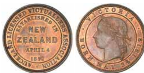
1213* Licensed Victuallers Association, Auckland penny , 1871 (A.326). Nearly full mint red, uncirculated, one of the finest known.