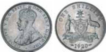
486* George V, 1920M. Some mint bloom, good extremely fine.