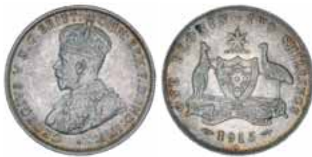
378* George V, 1915H. Very fine. $350