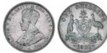
493* George V, 1921 star. Nearly very fine/fine.