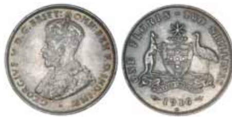
379* George V, 1916M. Toned, nearly extremely fine/extremely fine. $350