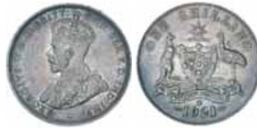
488* George V, 1921 star. Grey toned, extremely fine and rare in this condition.