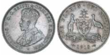
374* George V, 1913. Very fine. $250