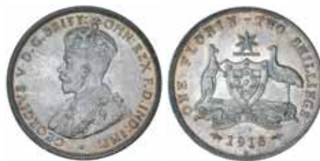
385* George V, 1918M. Obverse field with scrape mark in front of King's face, extremely fine/good extremely fine. $400