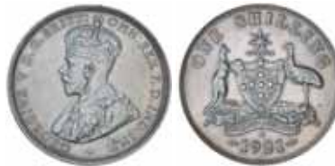
489* George V, 1921 star. Cleaned, extremely fine/nearly extremely fine.