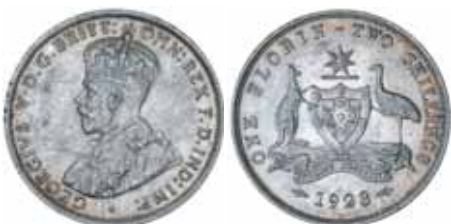
390* George V, 1923. Die break on obverse, good very fine/extremely fine. $500