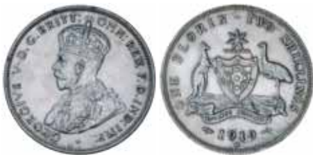
387* George V, 1919M. Cleaned, good extremely fine. $600