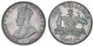
477* George V, 1915. Very fine.