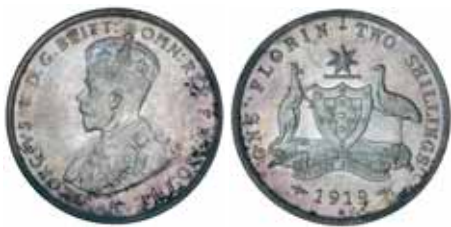
386* George V, 1919M. Considerable mint bloom, blue peripheral toning, nearly uncirculated and rare in this condition. $1,100