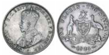
393* George V, 1926. Good extremely fine. $750