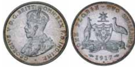
381* George V, 1917M. Extremely fine/nearly uncirculated. $550