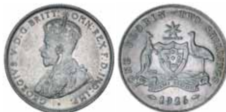
396* George V, 1926. Good very fine. $150