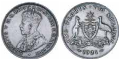
388* George V, 1921. Toned, reverse with edge knock at 1 o'clock, uncirculated. $1,650