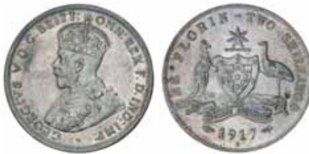
382* George V, 1917M. Reverse with two spots, extremely fine/good extremely fine. $300