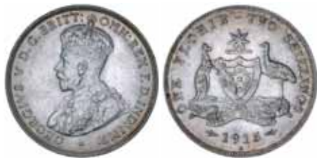
377* George V, 1915H. Extremely fine/nearly extremely fine. $1,000