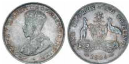
394* George V, 1926. Toned, good extremely fine. $750