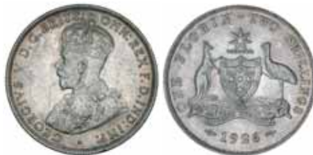
395* George V, 1926. Extremely fine/good extremely fine. $450