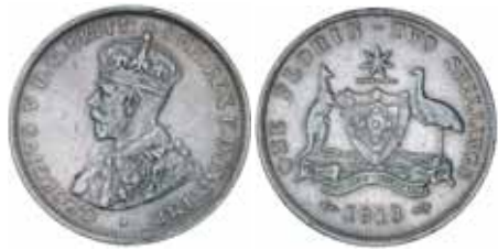
375* George V, 1913. Nearly very fine. $100