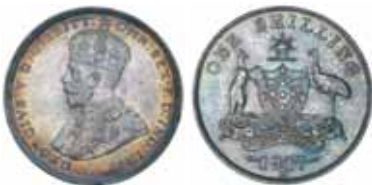
482* George V, 1917M. Peripheral golden toning on obverse, dark blue tone on reverse, good extremely fine.