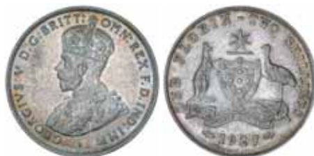
397* George V, 1927. Extremely fine. $250