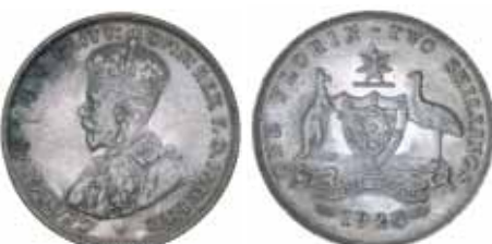
392* George V, 1925. Extremely fine. $350