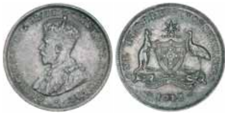
373* George V, 1912. Toned, very fine/good very fine. $200