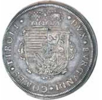
3576 Austria , Holy Roman Empire, Tyrol, Leopold, thaler 1626 (KM.629.1). Good very fine .

Austria, Holy Roman Empire, silver three kreuzers of Ferdinand II (1619-1637), Ferdinand III (1638-1657), Leopold I (1657-1705); 1625 Saint Veit Mint, (KM.499) (illustrated); 1628 HR, Breslau Mint (KM.491); 1639 bird in circle, Vienna Mint (KM.837); 1688 Hall Mint (KM.1245) (illustrated); 1697 MMW Breslau Mint (KM.1230) (2). Very fine - extremely fine, first with straight edge. (6)