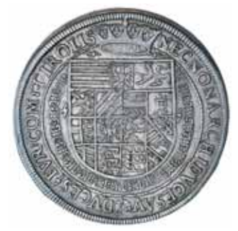
3573* Austria, Holy Roman Empire, Rudolph II, thaler 1604 (KM.56.1). Good very fine.