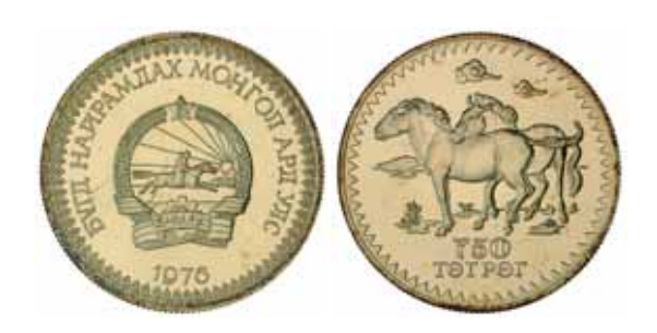
Mongolia, seven hundred and fifty tugrik, 1976, Przewalski Horses (KM.38). Uncirculated. $1,400