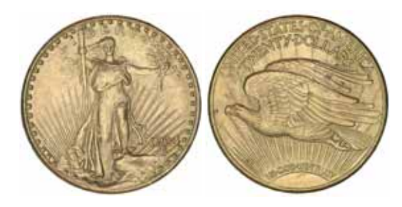
3560* USA, twenty dollars or double eagle, 1924, St.Gaudens. Nearly uncirculated. $1,500