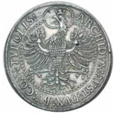
3578* Austria , Holy Roman Empire, Leopold I, double thaler (1686-96) older portrait (KM.1338). Some tooling and obverse mark, toned extremely fine.