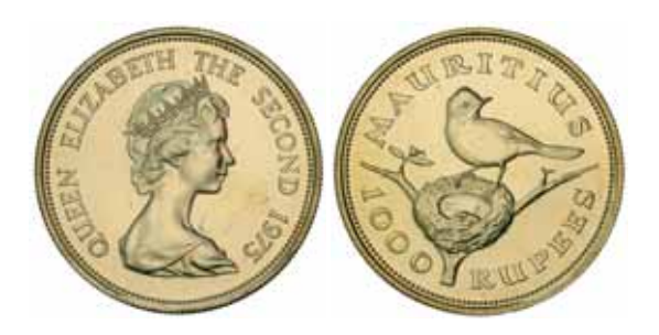
3484* Mauritius, one thousand rupees, 1975, Mauritius Fly Catcher (KM.42). Uncirculated .

Malta, silver two and four pounds, gold ten, twenty and fifty pounds, 1975 (KM.30, 32, 34, 36, 38). Uncirculated. (5) $1,150