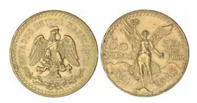
3486* Mexico, fifty pesos, 1945 (KM.481). Dull tone, nearly uncirculated.