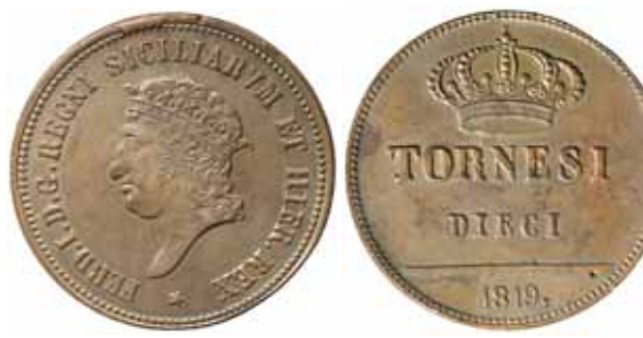
. . . .