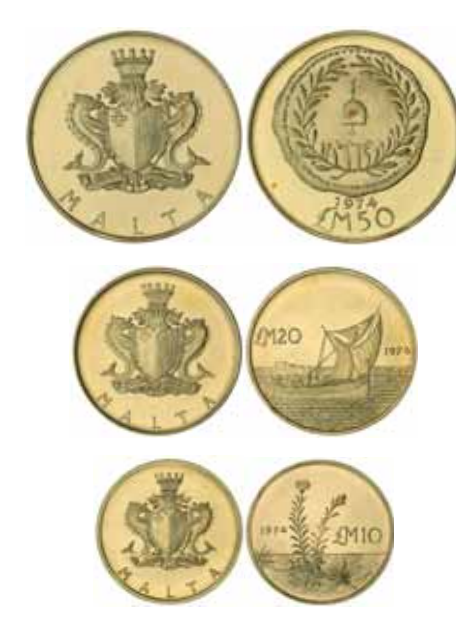
3482* Malta, ten, twenty and fifty pounds, 1974 (KM.26, 27, 28). Uncirculated. (3)