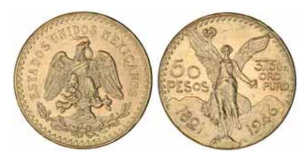
3488^* Mexico , fifty pesos, 1946 (KM.481). Nearly uncirculated. $1,800