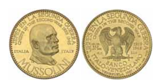
3565* Venezuela, medallic coinage, sixty bolivares, 1957, Mussolini (KM. XMB28). Uncirculated .