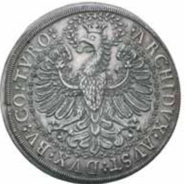
Austria , Holy Roman Empire, Leopold I, double thaler (1670) younger portrait (KM.1119.1). Nearly extremely fine.