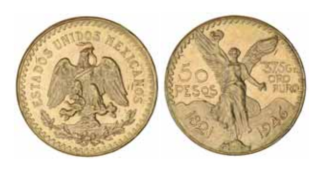
3487* Mexico , fifty pesos, 1946 (KM.481). Mirror-like fields, nearly uncirculated. $1,800