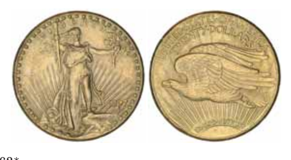
3562* USA , twenty dollars or double eagle, 1927, St.Gaudens. Nearly uncirculated. $1,600