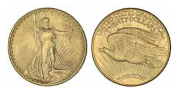
3561* USA, twenty dollars or double eagle, 1924, St Gaudens. Nearly extremely fine. $1,550