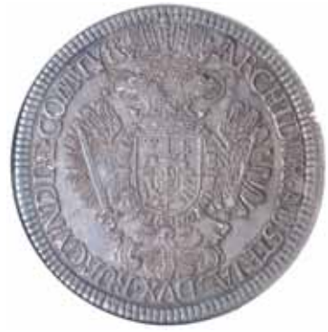
3579 Austria , Holy Roman Empire, Charles VI, double thaler, 1711-40, Hall Mint (Dav.1049; KM.1523). Deep gun metal grey toned, good extremely fine and rare.