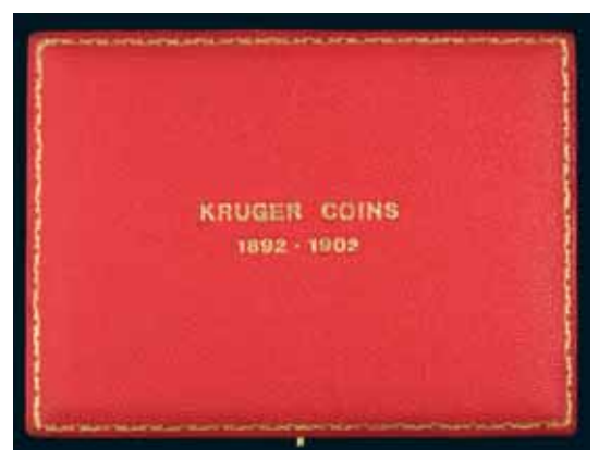
lot 3516 part