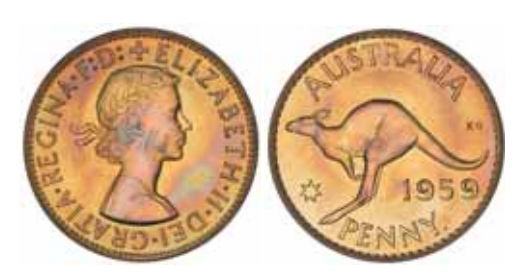
1527* Elizabeth II, Perth Mint proof penny, 1959. Attractive, FDC.