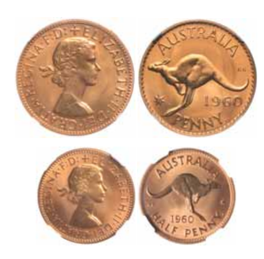
1531* Elizabeth II , Perth Mint proof set, 1960. Full red, FDC . (2) $1,250

In slabs by NGC as PF66RD. Ex Heritage Auctions (sale 3017, lot 27242).