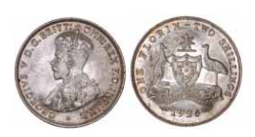
1577* George V, 1926. Considerable original mint bloom, golden condition.