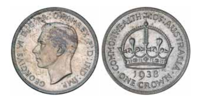
1561* George VI , 1938. Mint bloom, nearly uncirculated.