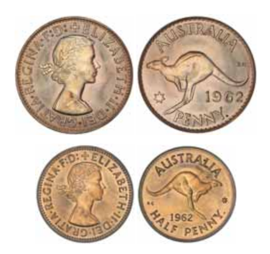
1542* Elizabeth II , Perth Mint proof set, 1962. Halfpenny with slight toning, otherwise full red FDC. (2) $1,200