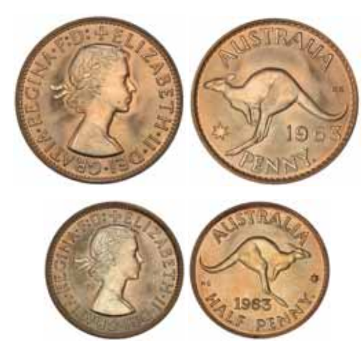
1547* Elizabeth II , Perth Mint proof set, 1963. Full red, FDC and scarce thus. (2) $1,800