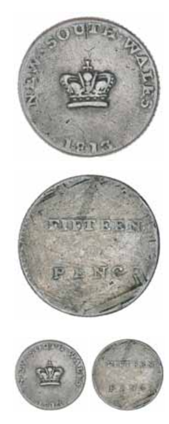
1319* New South Wales, fifteen pence or dump, 1813 (Mira dies D/2). Traces of the reverse of original coin on the reverse, lightly toned very fine and rare.