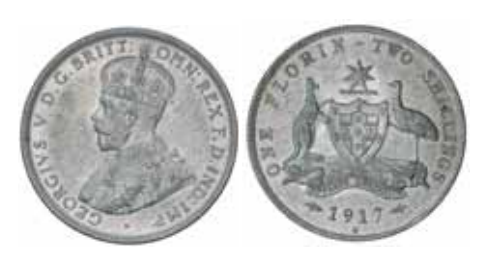
1569* George V, 1917M. Nearly uncirculated.