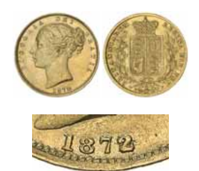
1364* Queen Victoria, 1872/1 Melbourne, overdate. Nearly extremely fine and rare. $2,000