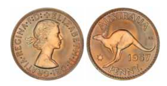
1512* Elizabeth II , Perth Mint proof penny, 1957. Full mint red, FDC.