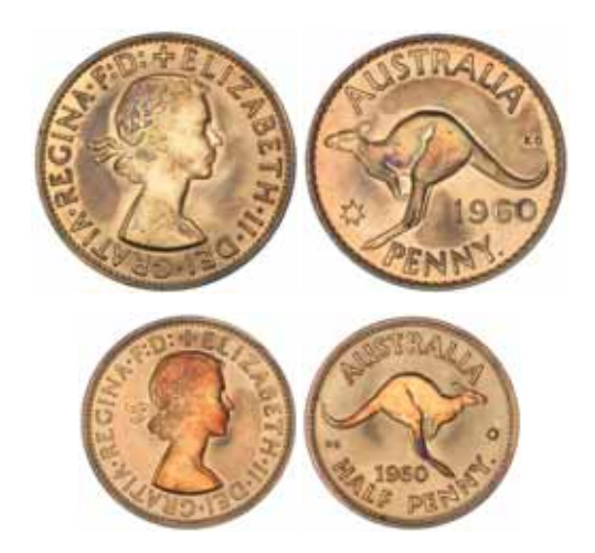
1533* Elizabeth II, Perth Mint proof set, 1960. Light toning, full red FDC. (2) $1,000