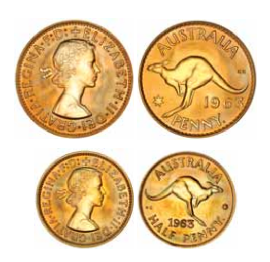
1548* Elizabeth II, Perth Mint proof set, 1963. Full mint red, FDC. (2) $850

Elizabeth II, Perth Mint proof set, 1963. FDC. (2) $800