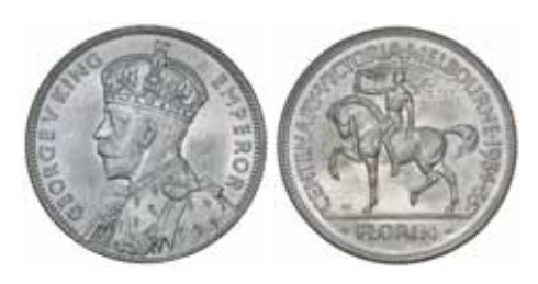
1584\,^* George V, 1934-35 Melbourne Centenary. Choice uncirculated with full satin-like bloom. $1,000