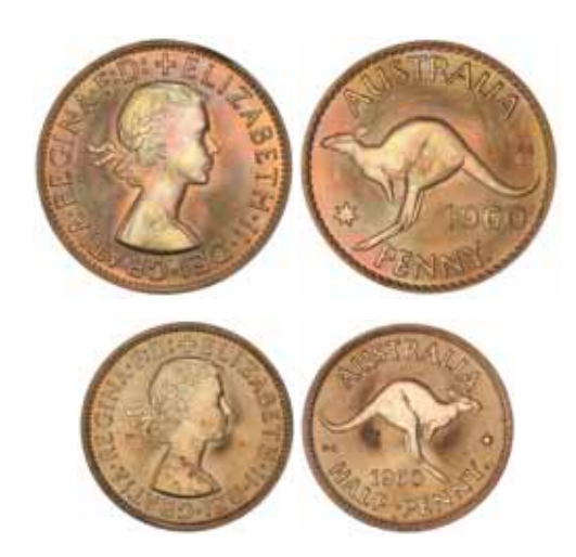
1530* Elizabeth II, Perth Mint proof set, 1960. Slightest toning on halfpenny otherwise full red, FDC. (2) $1,500

1529 Elizabeth II , Perth Mint proof penny, 1959. Tiny carbon spot at 3 o'clock, FDC.