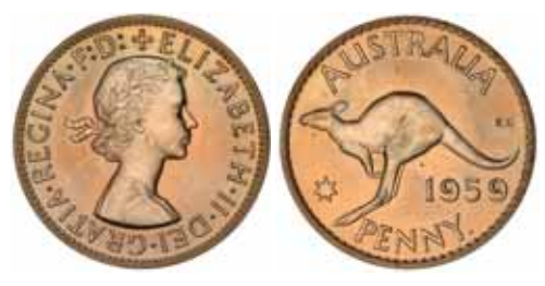
1528* Elizabeth II, Perth Mint proof penny, 1959. Full mint red, FDC.

1529 Elizabeth II , Perth Mint proof penny, 1959. Tiny carbon spot at 3 o'clock, FDC.