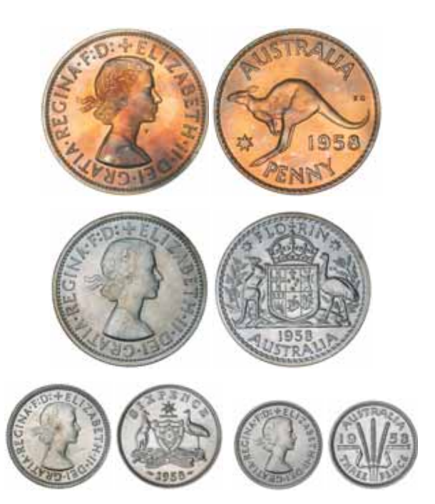
lot 1487 part