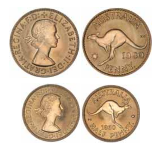
1535* Elizabeth II, Perth Mint proof set, 1960. FDC. (2)