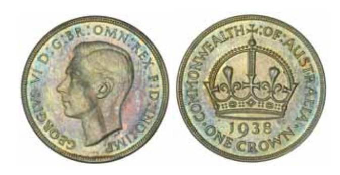
1562* George VI, 1938. Obverse contact marks, olive green toned, extremely fine/good extremely fine. $200