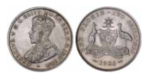
1576* George V, 1924. Seriffed 4, die break through date, lightly toned matte fields, well struck nearly uncirculated. $2,000