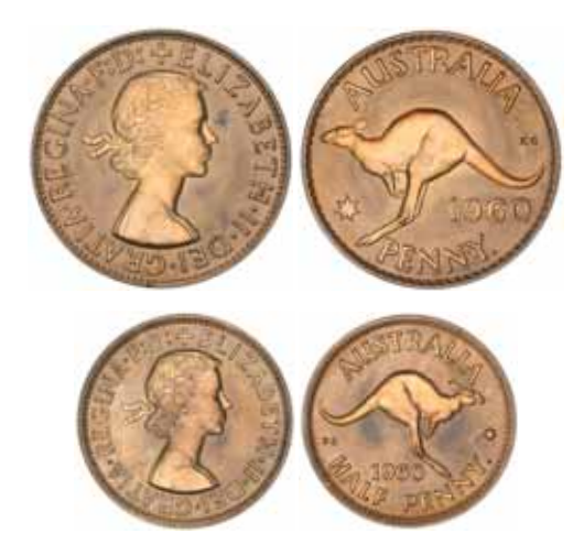
1534* Elizabeth II , Perth Mint proof set, 1960. Slight dark area on reverse of halfpenny, otherwise FDC. (2) $1,000