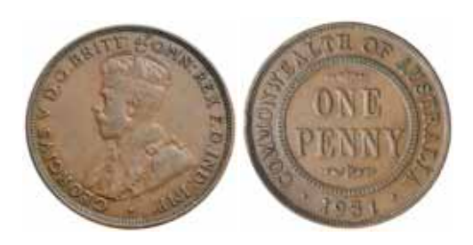
1659* George V, 1931, dropped 1, Indian die. Fine and very rare. $750