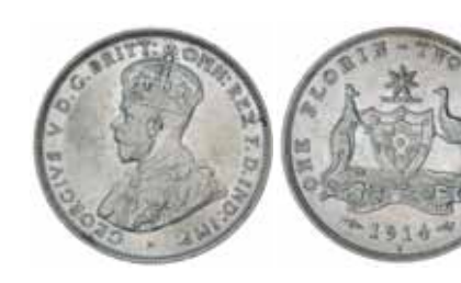
1565* George V , 1914H. Very fine.