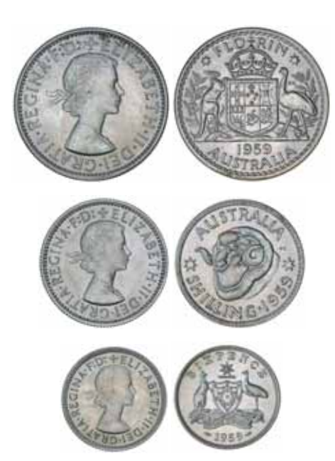
lot 1493 part