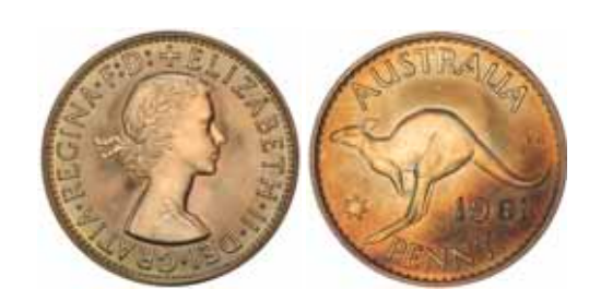
1541* Elizabeth II , Perth Mint proof penny, 1961. Toned lower right quarter on reverse, otherwise brilliant red FDC. $350

1540 Elizabeth II, Perth Mint proof set, 1961. Toned and some spotting, extremely fine. (2) $250