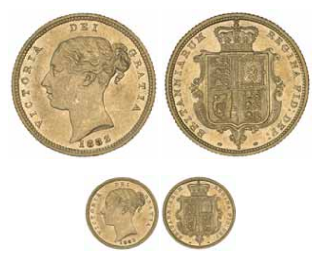
1434* Queen Victoria, 1882 Sydney. Obverse surface marks, otherwise extremely fine and very rare, the key date. $8,000