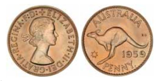
1526* Elizabeth II , Perth Mint proof penny, 1959. Full mint red, FDC