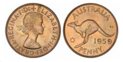
1525* Elizabeth II, Perth Mint proof penny, 1959. Full red, FDC. $900