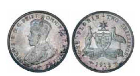
1572* George V, 1919M. Considerable mint bloom, blue peripheral toning, nearly uncirculated and rare in this condition. $1,200