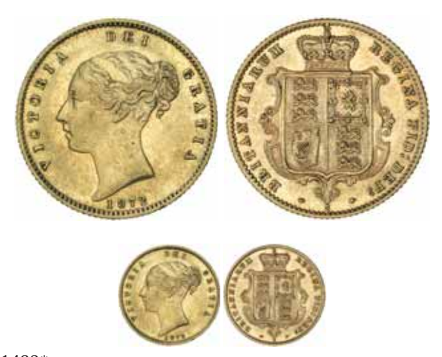
1423* Queen Victoria, 1872 Sydney. Nearly uncirculated and rare in this condition.