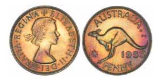
1473* Elizabeth II , Perth Mint proof penny, 1953. Attractive red brown, obverse hairline, nearly FDC and very rare. $20,000