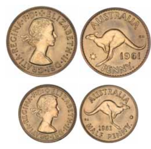
1537* Elizabeth II, Perth Mint proof set, 1961. Full red, FDC. (2) $1,500

1538 Elizabeth II , Perth Mint proof set, 1961. Slight toning otherwise FDC . (2) $900