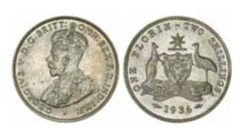
1592* George V, 1936. Lightly toned uncirculated.