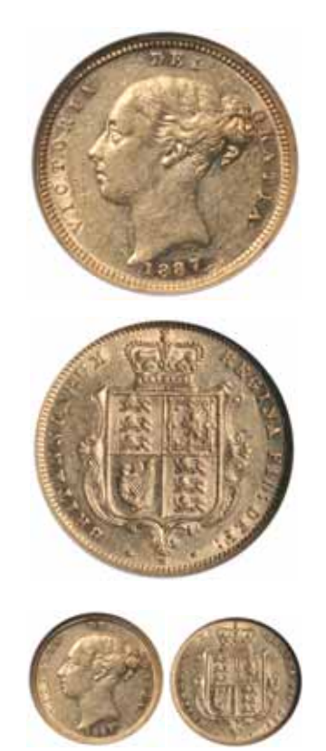
1440* Queen Victoria, young head, 1887 Melbourne. Nearly uncirculated and very rare. $12,000

Private purchase from Winsor & Sons 10 September 2007.