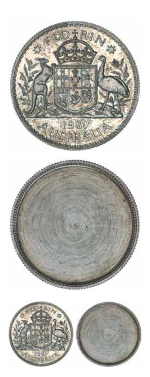
1471* George VI, Royal Mint uniface pattern florin, 1937, the obverse tooled out, probably of Edward VIII. Brilliant with toning, nearly FDC and extremely rare. $100,000