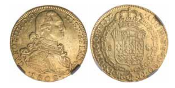
1305* Colombia, Charles IIII, eight escudos, 1802 JJ, NR = Nuevo

Reino (Bogota) Mint, (KM.62.1). Usual hairlines, extremely fine and a rare mint.