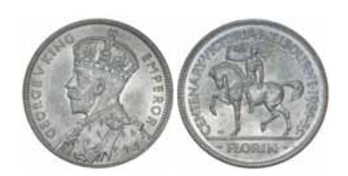
1586* George V, 1934-35 Melbourne Centenary. Full frosty mint bloom, uncirculated. $1,000