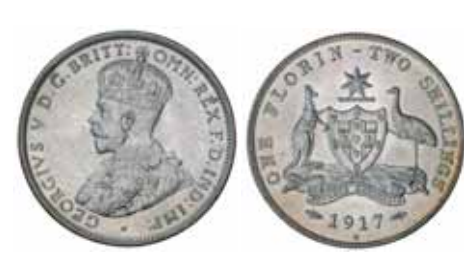
1568* George V, 1917M. Uncirculated.