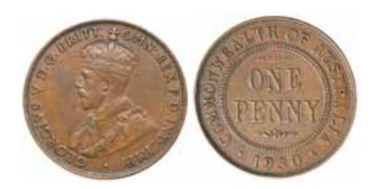
1658* George V, 1930 Indian die. Even brown patina, good fine and rare.

Ex Noble Numismatics Sale 82 (lot 1467).