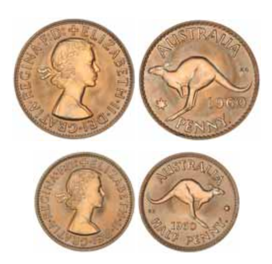
1532* Elizabeth II , Perth Mint proof set, 1960. Full mint red, FDC. (2) $1,000

In slabs by NGC as PF66RD. Ex Heritage Auctions (sale 3017, lot 27242).