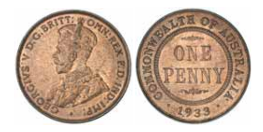
1660 George V , 1933. Mint red uncirculated .