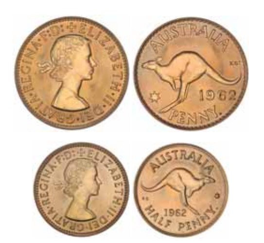
1543 Elizabeth II , Perth Mint proof set, 1962. Full mint red, FDC. (2) $1,000

1544 Elizabeth II , Perth Mint proof set, 1962. Some toning on penny, otherwise FDC. (2) $350