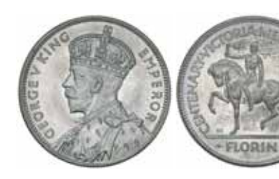
1583^{\ast} George V, 1934-35 Melbourne Centenary. Full original mint bloom, choice uncirculated. $1,000