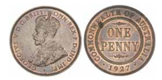
1656* George V, 1927, London die. Brown and red, uncirculated.