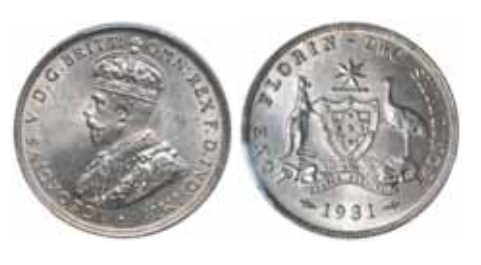
George V, 1931. Full mint bloom, uncirculated.