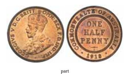
1668* George V , 1916I and 1918I. Cleaned, otherwise good extremely fine, the second rare. (2)