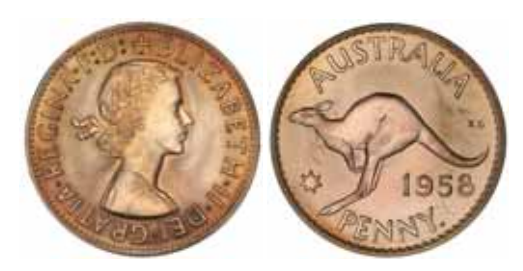
1520* Elizabeth II, Perth Mint, proof penny, 1958. Full mint red, darker on obverse, FDC.