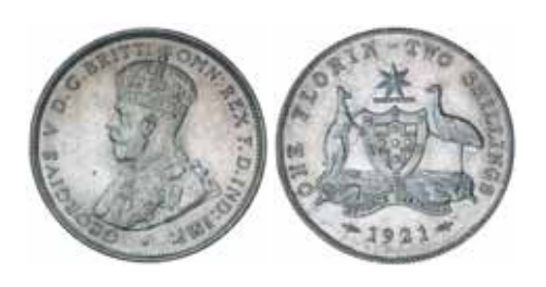
George V, 1921. Uncirculated and rare in this condition. $1,500

brown toning in parts, nearly uncirculated and rare in this $1,500