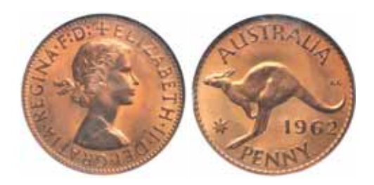
1545* Elizabeth II , Perth Mint, proof penny, 1962. Lightly toned, red FDC .

1544 Elizabeth II , Perth Mint proof set, 1962. Some toning on penny, otherwise FDC. (2) $350