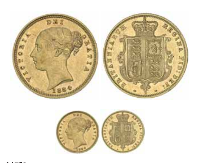
1437* Queen victoria , 1884 Melbourne. Nearly uncirculated and very rare in this condition. $10,000

Ex Monetarium Sale 2 (lot 412) 16 May 1988.