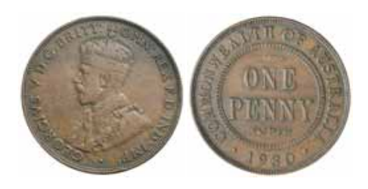
1657* George V , 1930 Indian die. Six pearls, good fine/nearly very fine and rare.