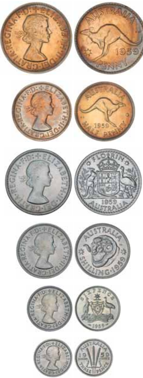
1492* Elizabeth II , Melbourne Mint proof set, 1959. FDC. (6) $1,000