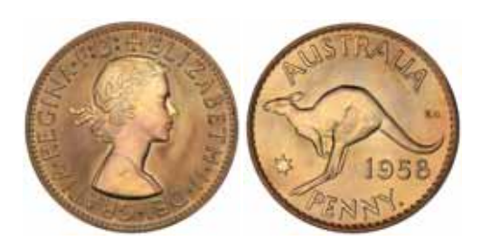
1519* Elizabeth II , Perth Mint proof penny, 1958. Full red, FDC .