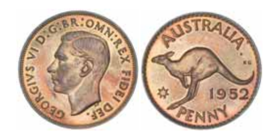
1472* George VI , Perth Mint proof penny, 1952. Brilliant full original mint red, FDC and very rare, one of the finest known.