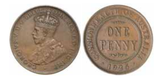
1108* George V, 1925. Very fine.

George V, 1925. Broken N die state, good very fine. $150