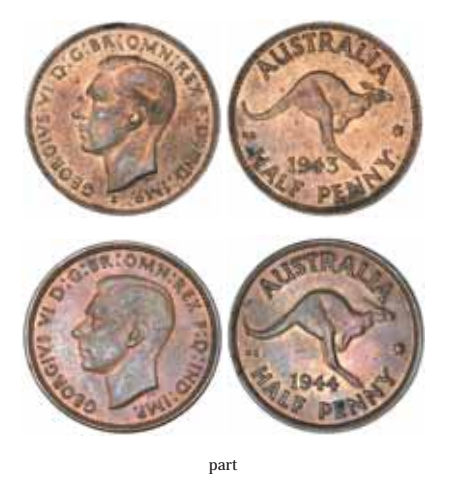
George VI , 1942I, 1943, 1943I, 1944 and 1945 (2). Brown and red, nearly uncirculated - uncirculated. (6) $200