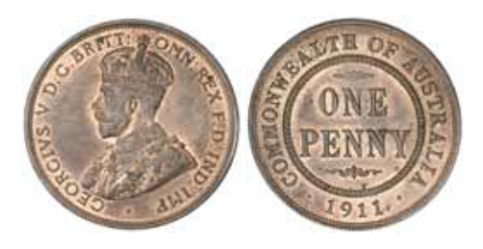
1243* George V, 1911. Brown and red, uncirculated.