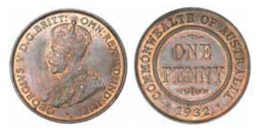
1267* George V, 1932. Dark brown and red, uncirculated.