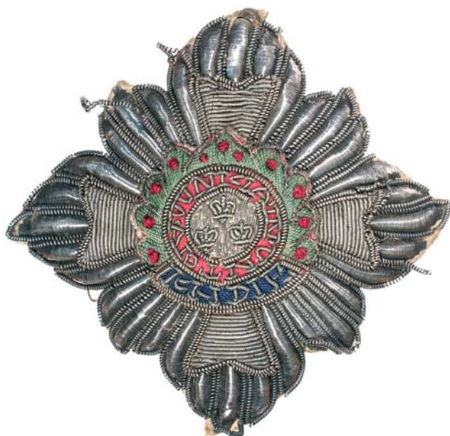
4297* The Most Honourable Order of the Bath, Knight Commander (Military) (KCB Mily) embroidered star. Wire thread loose in a few places, otherwise good very fine.