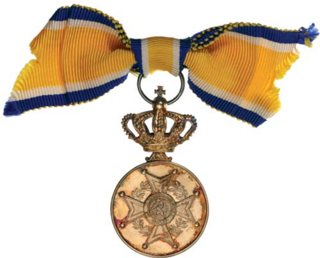
4592* Netherlands , Gold Medal of Honour of the Order of Orange Nassau (Civil), in silver gilt on female ribbon. Uncirculated.