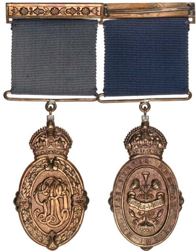
4327* Kaisar-I-Hind Medal, in bronze (GRI) (third class). In case of issue, with pin back ribbon suspender, extremely fine.