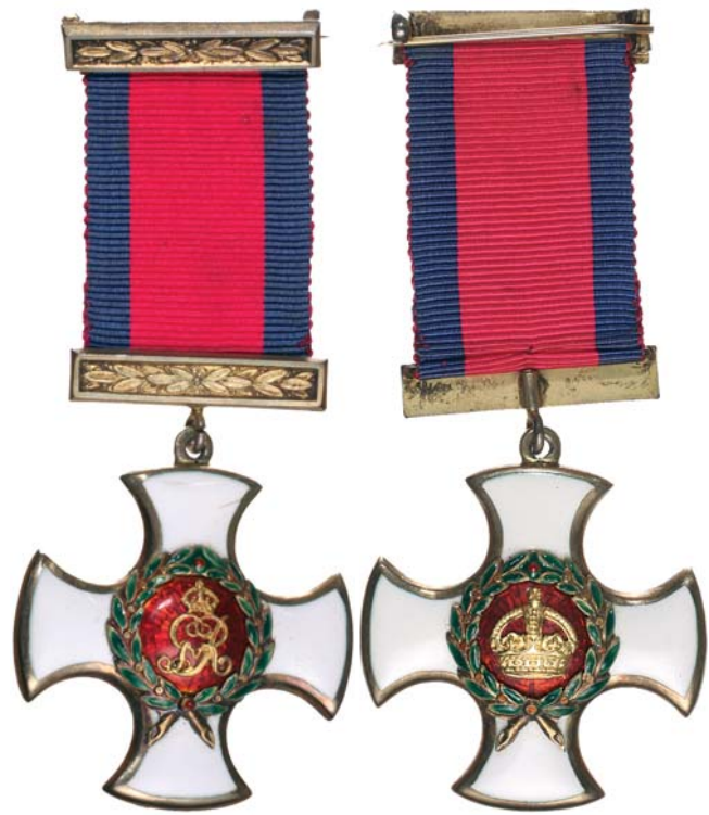
4317* Distinguished Service Order, (GVR) . In case of issue by Garrard & Co Ltd, with pin back ribbon suspension bar, extremely fine.