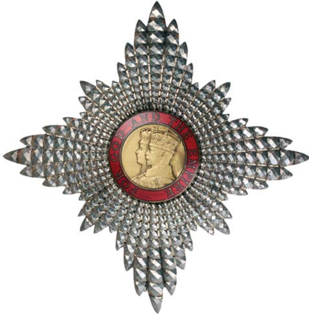
4310* The Most Excellent Order of the British Empire, Knight (type 2) (Military) (KBE Mily) star and neck badge. In set case of issue by Garrard & Co Ltd, small loop at top of crown on neck badge has broken away and needs re-attachment, otherwise good very fine - extremely fine.