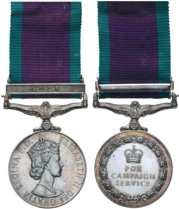
4414* General Service Medal 1962, - clasp - Gulf. MEM (M) 1 G P Paskin D204150S RN. Impressed. Extremely fine. $200