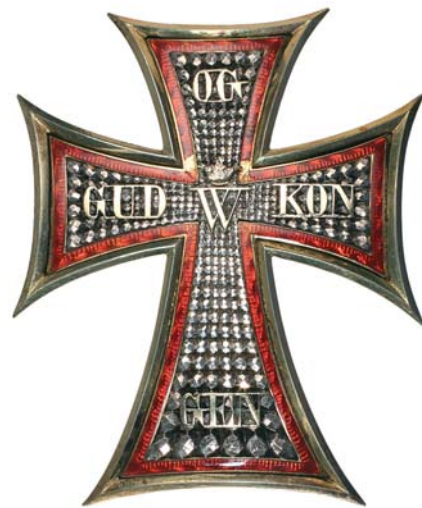
4572* Denmark , Order of the Dannebrog, Grand Commander star, reverse hallmark of crown over M, Queen Margrethe II, 1972 -. In official maker's case, A.Michelsen, Kjobenhavn (Copenhagen), good extremely fine.