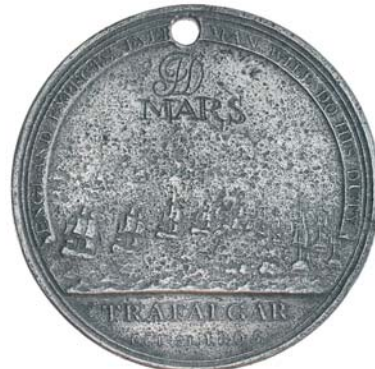
4333* Boulton's Trafalgar Medal 1805, in white metal. J D Mars engraved on reverse. With unofficial case, this damaged, pitted and holed at top for wearing, good.