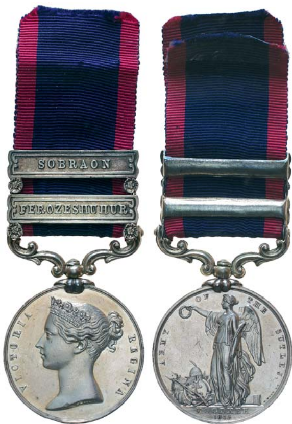
4341* Sutej Medal 1846, reverse with Moodkee 1845 in exergue, - two clasps - Ferozeshuhur, Sobraon. John Eagle. 80th Foot. Impressed. Some edge bumps, otherwise very fine. $500