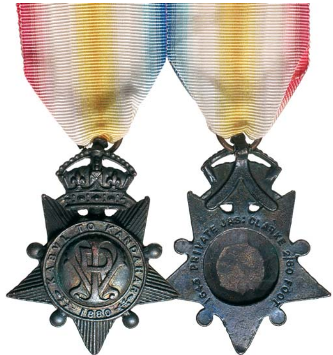
4359* Kabul to Kandahar Star . 1643 Private Jas:Clarke 2/60 Foot. Impressed. Nearly extremely fine.

1632 Sgt R.King, 1/13th Foot, S.L.I. served for a total of twenty years and was engaged against Sekukuni in 1879 and against the Zulus also in 1879. Served for four years and 290 days in South Africa. Discharged with fracture of patella. General remarks: habits regular, conduct good.