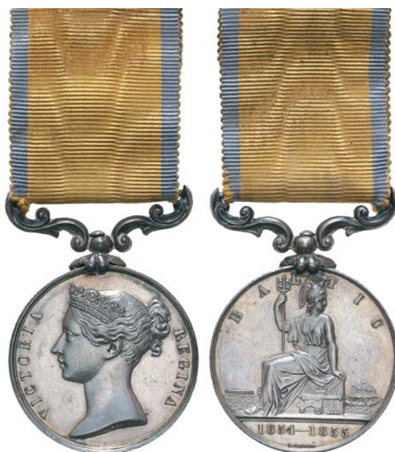
4346* Baltic Medal 1856. W.W.Kiddle. R.N. Engraved. Hairlines, extremely fine. $150