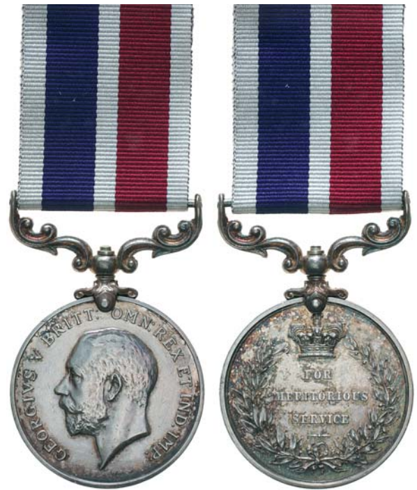
4420* Royal Air Force Meritorious Service Medal, (GVR). 6387 Sjt C.G.Ward. R.A.F. Impressed. Good very fine.