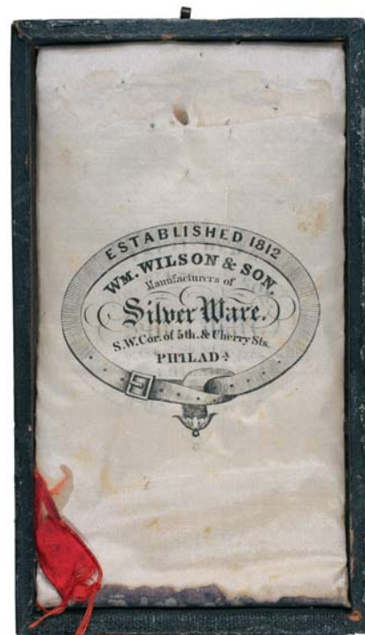
lot 4601 part (next page)