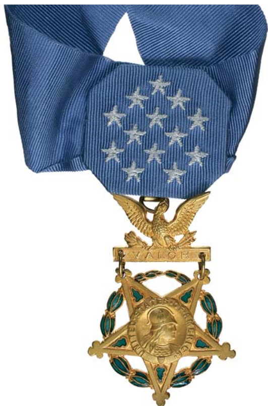
4602* USA, Army Medal of Honour type VI, 1964- with neck cravat. High quality unnamed specimen, extremely fine.