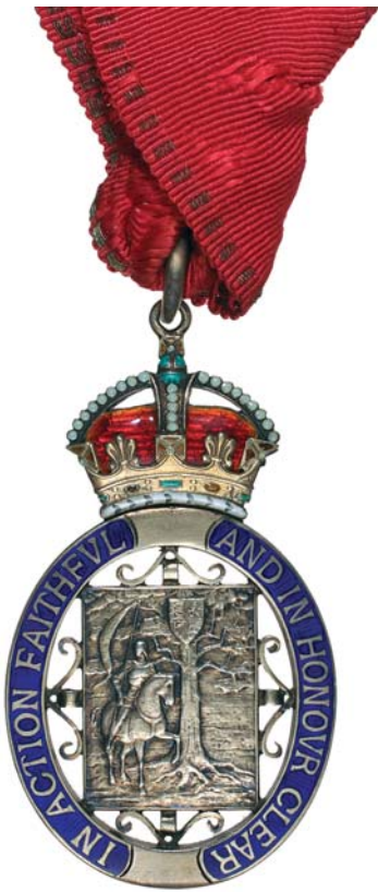
4315* The Order of the Companions of Honour , neck badge in silver and enamel. In case of issue by John Pinches, London, extremely fine and scarce.