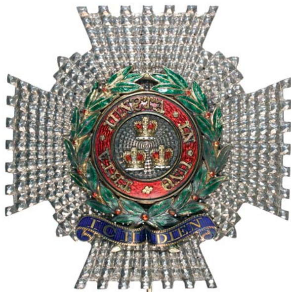
4296* The Most Honourable Order of the Bath, Knight Commander (Military) (KCB Mily) star in silver, gilt and enamel. Extremely fine.