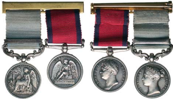
4566* Pair: Army of India Medal 1851, - clasp - Bhurtpoor; Waterloo Medal 1815, mounted out of order on a gold pin back suspension bar. Extremely fine.