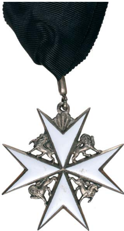
4316* The Order of St John, Commander (Brother) , neck badge in silver and enamel. Some light scuffing to part of enamel on one side, otherwise extremely fine.