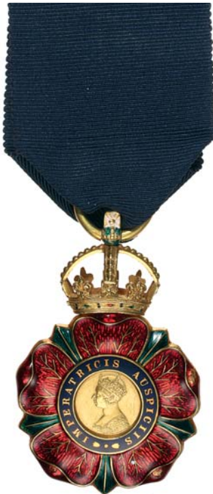
4303* The Most Eminent Order of the Indian Empire, Companion breast badge (without India), in gold and enamel. In case of issue by Garrard & Co Ltd, uncirculated.