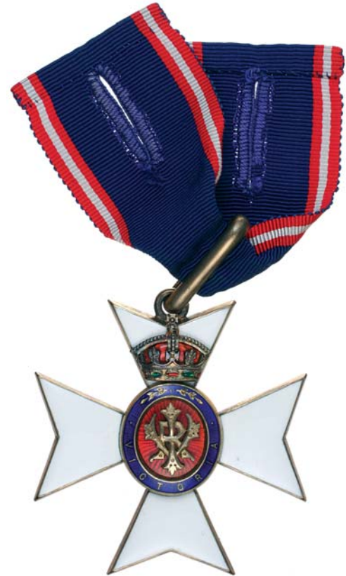
4304* The Royal Victorian Order, Second Class, Knight Commander (KCVO), neck badge and breast star set, on reverse centre disc of badge, K175 and on the star, 175. In case of issue by Collingwood & Co, closing clip needs adjusting, with instructions for wearing, uncirculated.