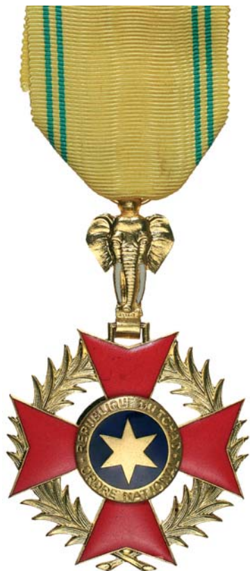
4571* Chad , French Colony, 1920-1960, National Order of Tchad, Officer breast badge in gilt and enamel. Uncirculated.