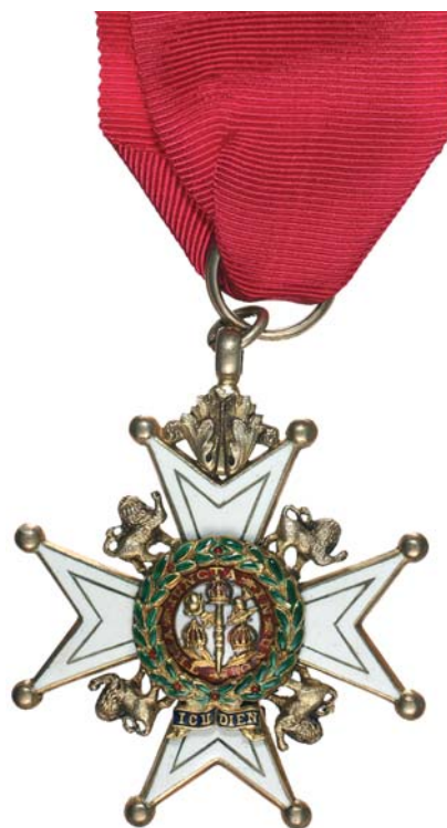
4299* The Most Honourable Order of the Bath, Companion (Military) (CB Mily) neck badge in gilt and enamel (approx 55mm x 48mm). In case of issue by Garrard & Co Ltd, this with some foxing, good extremely fine.