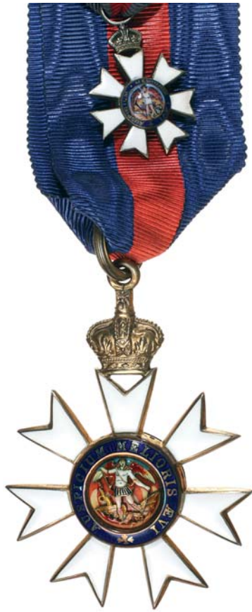
4302* The Most Distinguished Order of St Michael and St George, Companion (CMG) neck badge (60mm x 45mm) in silver gilt and enamel. In case of issue by Garrard & Co Ltd, extremely fine.