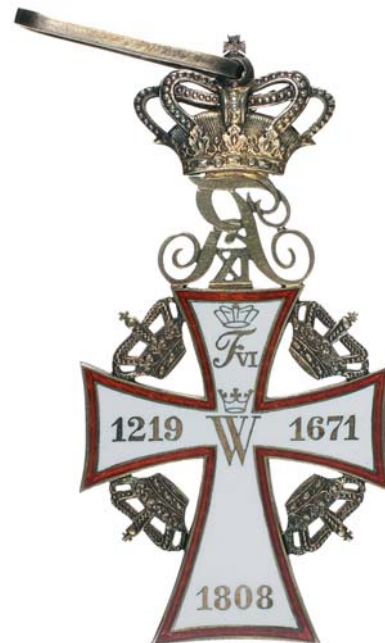
4573* Denmark , Order of the Dannebrog, Grand Commander neck badge, issue of Frederick IX, 1947-1972. In official maker's case, A.Michelson, Kjobenhavn (Copenhagen), with neck ribbon, uncirculated.