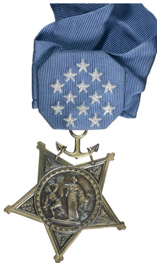
4603* USA, Navy Medal of Honour type X, 1964- with neck cravat. High quality unnamed specimen, extremely fine.

With extensive research including 143 pages of photocopies of muster rolls, letters, death certificates, various application forms and statutory declarations, Medal of Honor file and other relevant files.