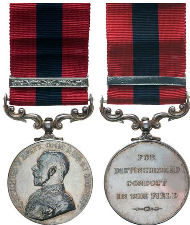
4328* Distinguished Conduct Medal, (GVR Field Marshall's uniform) with Bar. Edge marked Specimen. Hairlines, extremely fine.