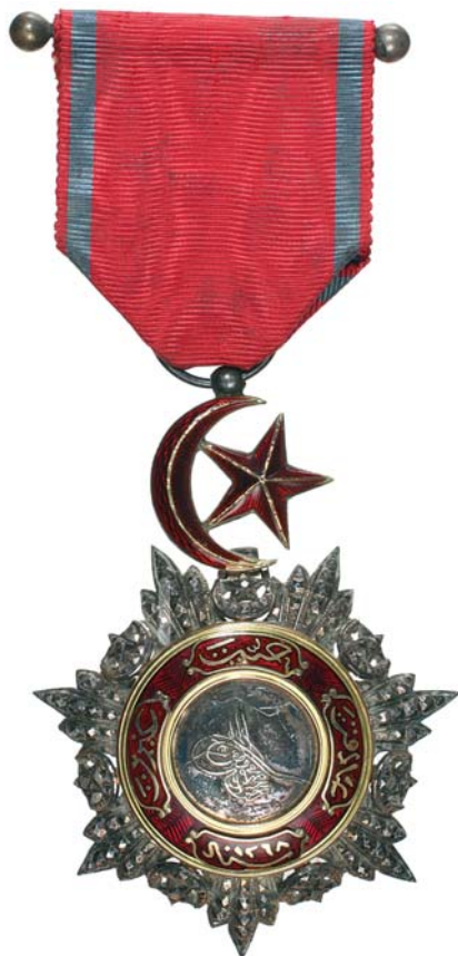
4599* Turkey , Order of Medjidjie, badge in silver and enamel (66mm including crescent). Slight enamel loss at end of crescent and star tips, otherwise toned, extremely fine. $250