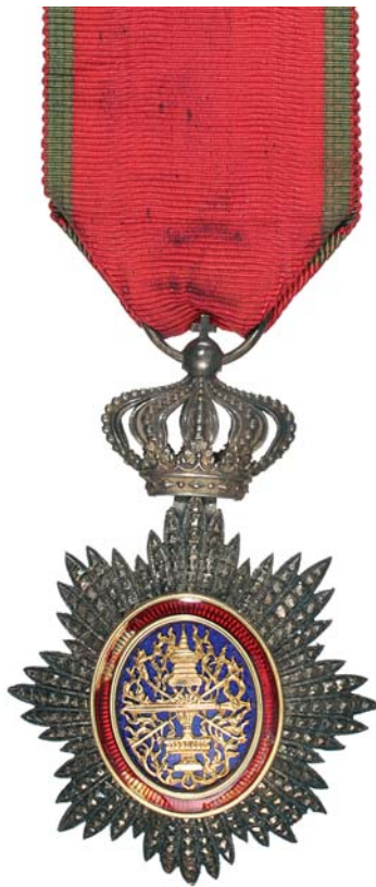
4570* Cambodia , French Protectorate, 1896-1948, Royal Order of Cambodia, Officer badge in silver gilt and enamel (62mm) with Cambodian Government conferment ribbon. Some red enamel loss, otherwise extremely fine.