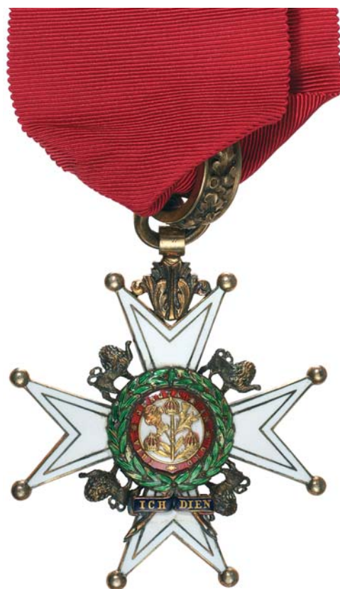
4298* The Most Honourable Order of the Bath, Knight Commander (Military) (KCB Mily) neck badge in silver, gilt and enamel. Top arm of cross bent back slightly, otherwise extremely fine.