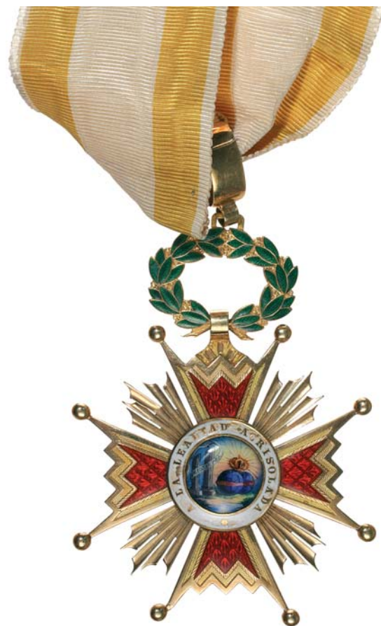
4596* Spain , Order of Isabella the Catholic, Commander's neck badge in gilt and enamel (51mm), reverse, cypher FR7. Some white enamel loss, otherwise extremely fine.