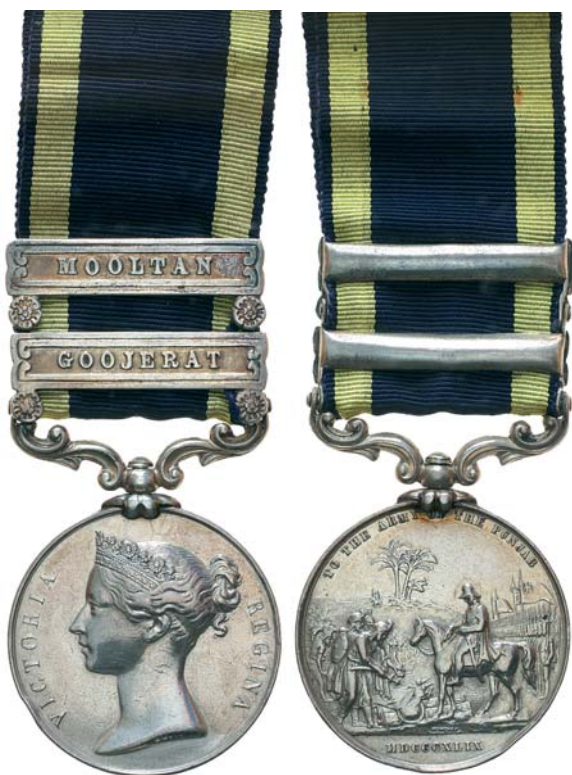
4342* Punjab Medal 1849, - two clasps - Mooltan, Goojerat. R.Brindley, 1st Bn 60th R.Rifles. Impressed. A few edge bumps, otherwise very fine. $350