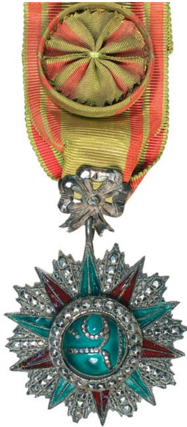
4598* Tunisia , French Protectorate, Order of Nichan Iftikhar, Officer's badge type II (1822-1957) in silver and enamel, partial Tunisian hallmark on reverse. Good very fine. $200