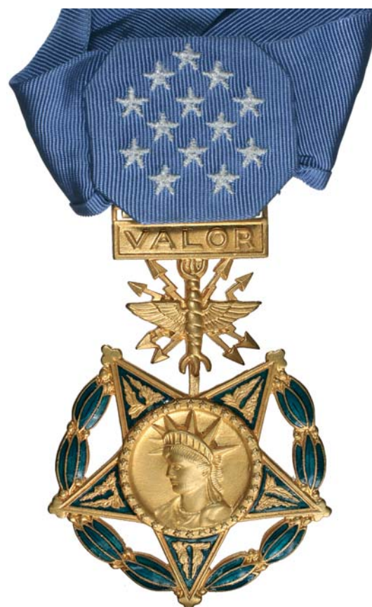
4604* USA, Air Force Medal of Honour, 1965- with neck cravat. High quality unnamed specimen, extremely fine.