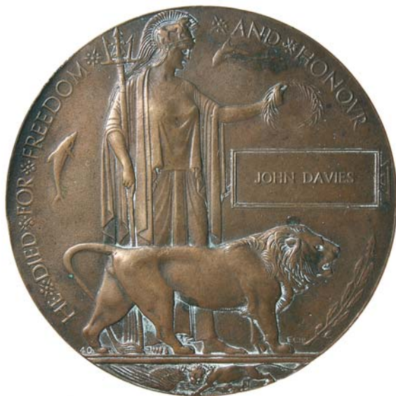
lot 4545 part