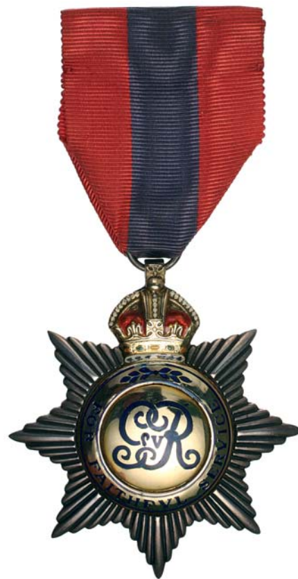
4318* Imperial Service Order, (GVR) . In case of issue by Elkington & Co Ltd, glue mark on lid lining, extremely fine.

Together with colour photo of interior of RVO Chapel of the Savoy, London, Duchy of Lancaster.