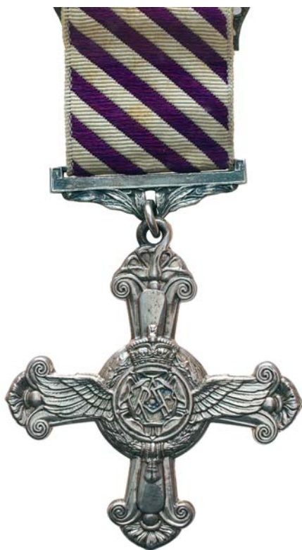
4326* Distinguished Flying Cross, (GRI). 1945 on reverse of lower arm. Engraved. In case of issue by Royal Mint, with pin back ribbon suspender, extremely fine.