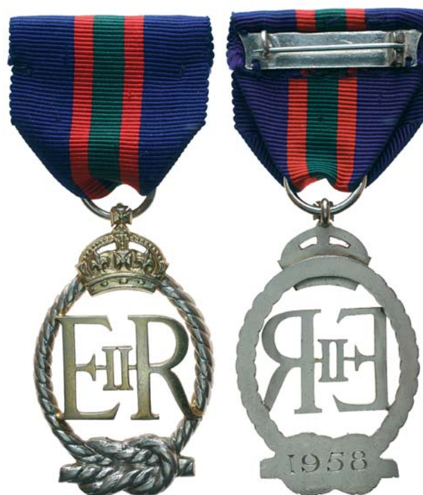
4426* Royal Naval Volunteer Reserve Decoration, (EIIR). 1958 on reverse. Engraved. With pin back suspender, extremely fine.