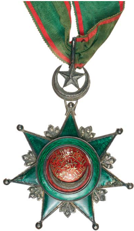
4600* Turkey , Order of Osmania, third class neck badge in silver and enamel (65mm), reverse with Arabic number 699 on oval disc above trophy of arms. Some enamel loss, otherwise good very fine. $150