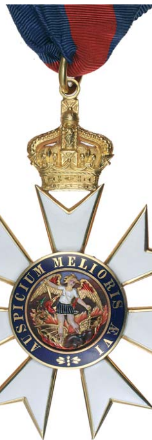
4301* The Most Distinguished Order of St Michael and St George, Knight Commander (KCMG), set of neck badge (95mm x 70mm) and breast star (89mm diameter) in silver, gilt and enamel, complete with full neck cravat and clasp fitment. The clasp fitment on one side needs adjustment to stitching on to ribbon, otherwise virtually uncirculated.