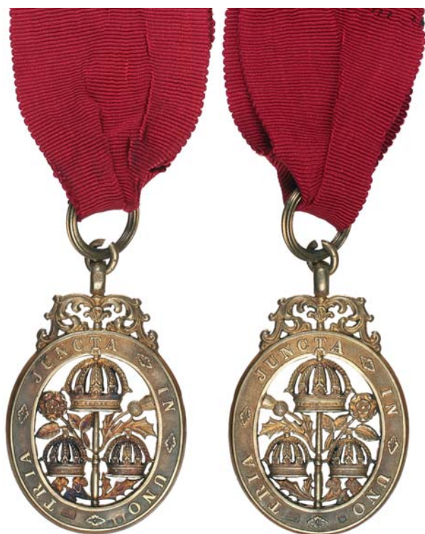
4300* The Most Honourable Order of the Bath, Companion (CB) (Civil) neck badge in silver gilt. In case of issue by Garrard & Co Ltd, toned extremely fine.