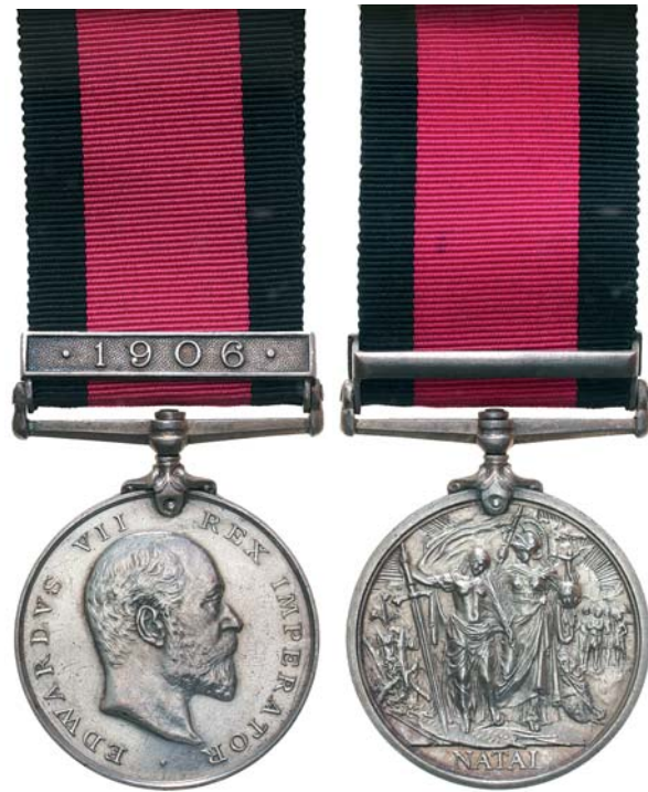
4376* Natal Rebellion Medal 1907, - clasp - 1906. Tpr: T.Serjeant, Umvoti Mtd, Rifles. Impressed. Extremely fine.