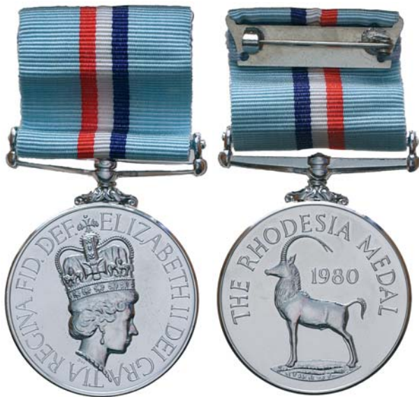
4415* Rhodesia Medal 1980. Unnamed. In box of issue and with pin back ribbon bar, uncirculated.