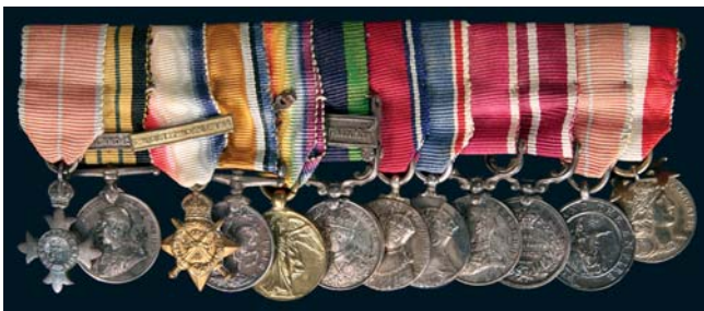
4567* Group of Twelve: The Most Excellent Order of the British Empire (Military) Member (MBE Mly); Africa General Service Medal (GVR), - clasp Somaliland 1908-10; 1914 Star, - Mons clasp - 5th August. - 22nd November 1914; British War Medal 1914-18; Victory Medal 1914-19 with MID; India General Service Medal (GVR Kaiser-I-Hind), - clasp - Waziristan 1921-24; Jubilee Medal 1935; Coronation Medal 1937; Army Long Service and Good Conduct Medal (GVIR Field Marshall's uniform); Army Meritorious Service Medal (GVR Field Marshall's uniform) swivel type; Medal of the Order of the British Empire (GRI); France, Medaille d'Honneur avec Glaives. An original set of contemporary swing mounted medals, nicely toned, extremely fine.