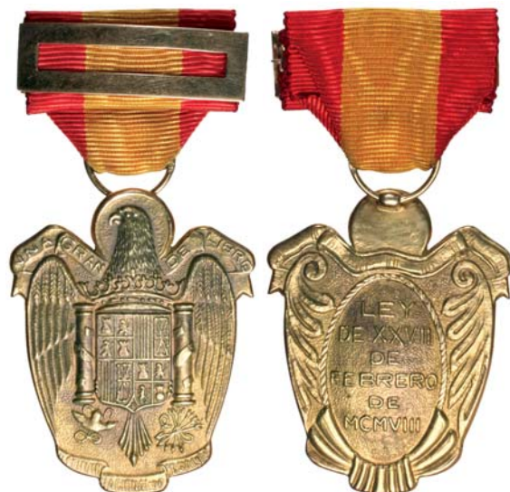
4597* Spain , Instituto Nacional de Prevision, Social Welfare Medal in gold (18ct+; approx 39g), together with matching miniature (approx 5g). Extremely fine.