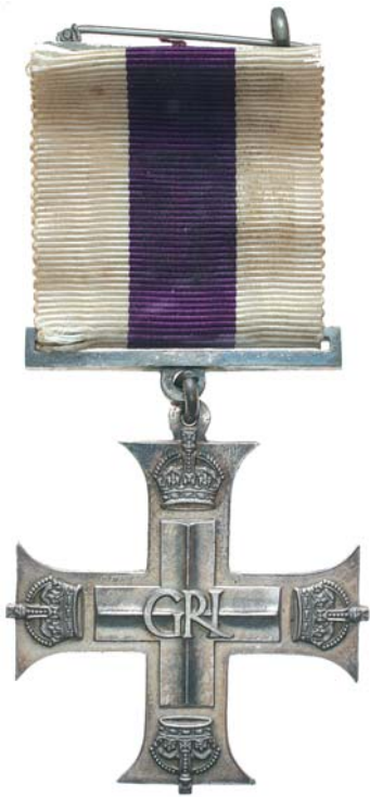
4324* Military Cross, (GRI), 1945 on reverse of lower arm. Engraved. In official case, this damaged, ribbon dirty and small tear, pin back ribbon suspender, extremely fine.