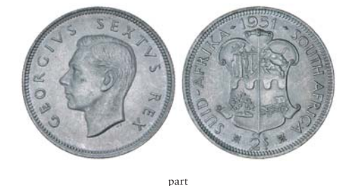
South Africa, George VI, two shillings, 1951 and 1952 (KM.38.2). Uncirculated; nearly uncirculated. (2) $100