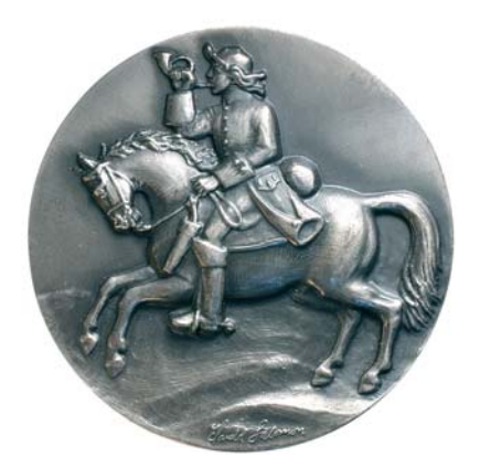
lot 4232 obverse