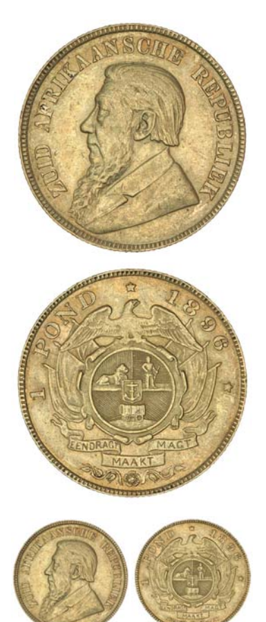
3775* South Africa, ZAR, pond, 1896 (KM.10.2). Nearly extremely fine.