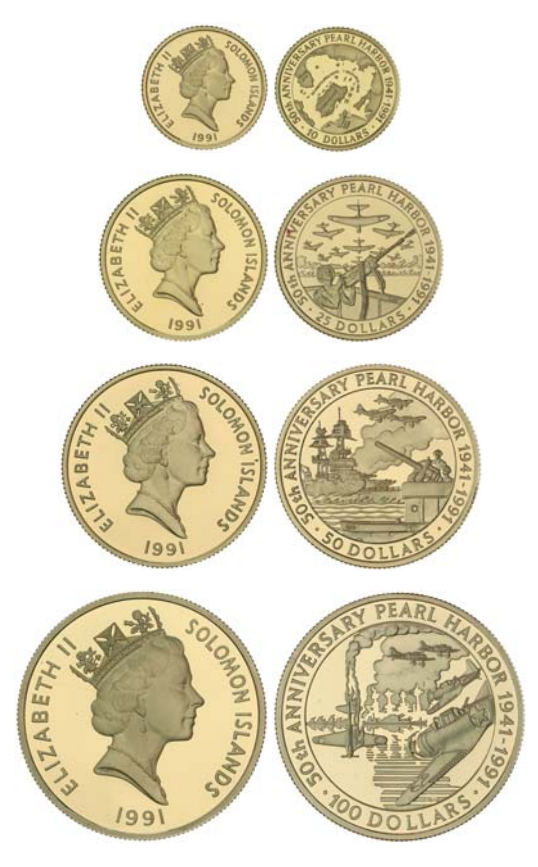
3769* Solomon Islands, Elizabeth II, four coin proof set 100, 50, 25 and 10 dollars 1991 (50th Anniversary of Pearl Harbour) (KM.PS8). In case of issue with certificate 461, FDC.