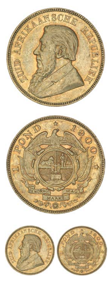
3779* South Africa, ZAR, pond, 1900 (KM.10.2). Nearly extremely fine/extremely fine. $1,500