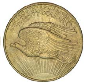
3843* USA, twenty dollars or double eagle, 1908, St. Gaudens, without motto. Nearly uncirculated . $1,700