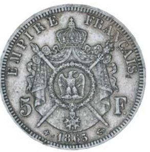
3917* France, Napoleopn III, five francs, 1865BB (KM.799.2). Toned, good very fine and very scarce.