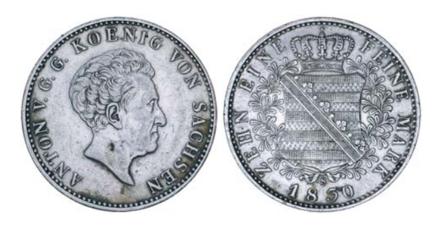
3925* Germany, Saxony, Anton, thaler, 1830S (KM.1121). Edge nicks, very fine.