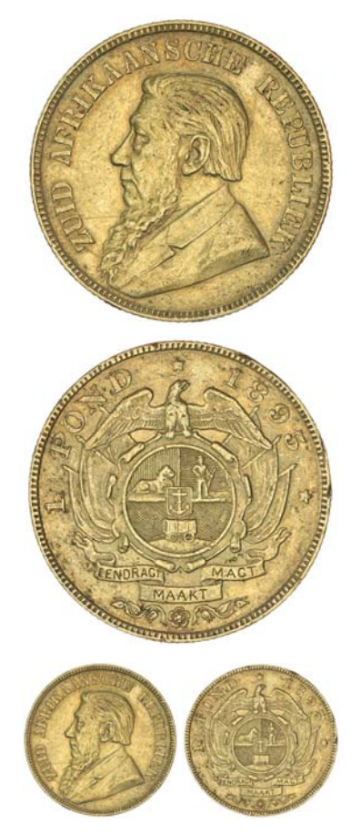
3774* South Africa, ZAR, pond, 1895 (KM.10.2). Good very fine and very scarce. $2,500