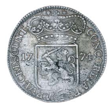
3970* Netherlands, Zeeland, ducat, 1774 (KM.52.4). Central flan flaw, shallow strike, very fine.