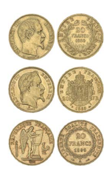
3691 France, Napoleon III, twenty francs, 1854A (KM.781.1); 1869A (KM.801.1); Third Republic, twenty francs 1896A (KM.825). Good very fine - extremely fine. (3) $900