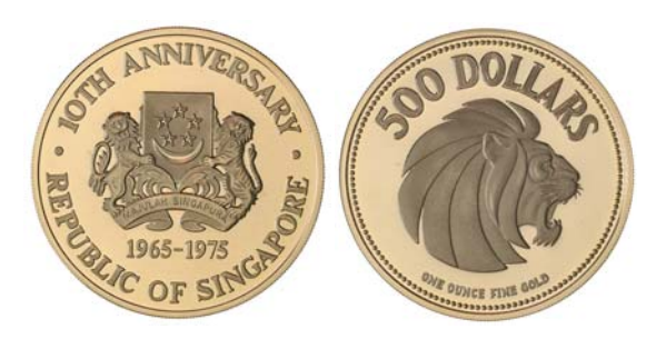
3768* Singapore, proof five hundred dollars, 1975 10th Anniversary of Independence (KM.14). FDC . $1,550