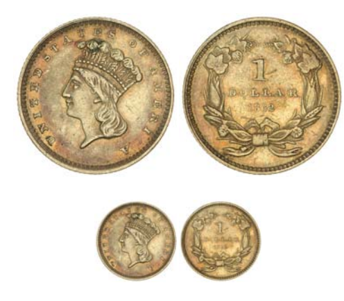
3813* USA, gold dollar, 1862, Indian Princess head. Toned good very fine. $150