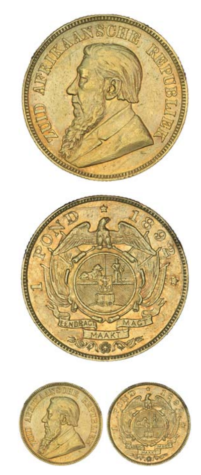
3771* South Africa, ZAR, pond 1892, single shaft (KM.10.2). Has been removed from a mount, otherwise very fine and rare. $1,500

This and the next eleven illustrated lots ex Captain Cullimore Allen Collection