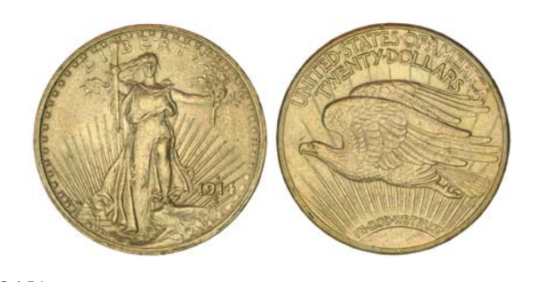
3845* USA, twenty dollars or double eagle, 1914S, St. Gaudens. Nearly uncirculated. $1,700

Western Samoa, proof one hundred tala, 1976 USA Independence; another, 1979 Cook bicentenary; another 1980 Olympic Games (KM.21, 34, 37). In cases of issue, FDC. (3)