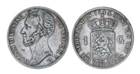
3972* Netherlands, William II, silver gulden, 1843 (KM.66). Very fine . $80