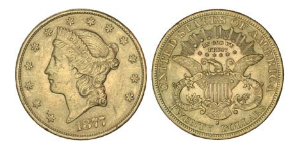
3839* USA, twenty dollars or double eagle, 1877S, Liberty head. Obverse surface marks, otherwise nearly extremely fine.