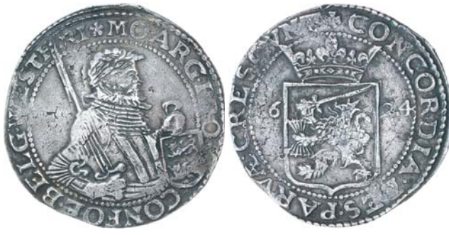
3968* Netherlands, Westfriesland, rijksdaalder, 1624 (KM.15.1). Nearly very fine.