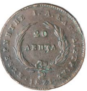
3933* Greece, copper twenty lepta, 1831 (KM.11). Even dark brown patina, very fine.