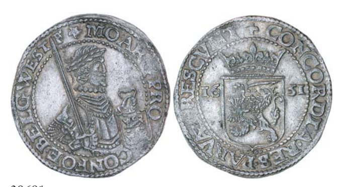
3969* Netherlands, Westfriesland, rijksdaalder, 1651 (KM.15.3). Well struck for this, nearly extremely fine. $450