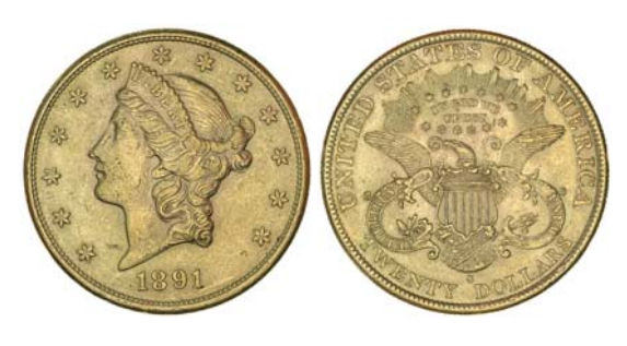
3840* USA, twenty dollars or double eagle, 1891S, Liberty head. Obverse surface marks, otherwise nearly extremely fine. $1,600