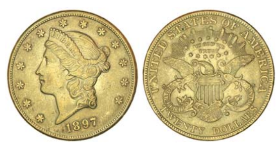
3841* USA, twenty dollars or double eagle, 1897, Liberty head. Good very fine . $1,500