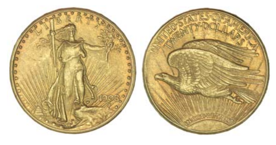
3844* USA, twenty dollars or double eagle, 1908, St. Gaudens, with motto. Nearly extremely fine . $1,600