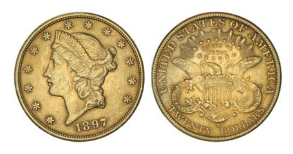
3842* USA, twenty dollars or double eagle, 1897S, Liberty head. Toned, good very fine. $1,600