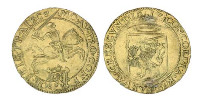
3741* Netherlands, Utrecht, cavalier d'or, 1617 (KM.15). Badly scraped on crown from mounting, otherwise fine and rare. $750

Mexico, fifty pesos, 1947 (KM.481). Uncirculated . $1,850