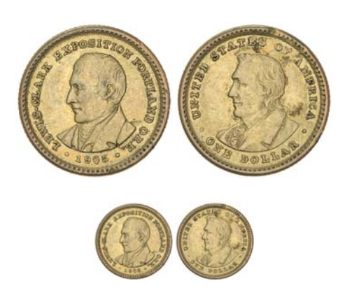
3814* USA, commemorative gold dollar, 1905 Lewis and Clark Exposition. Slight damage from mis-handling, otherwise good very fine. $300