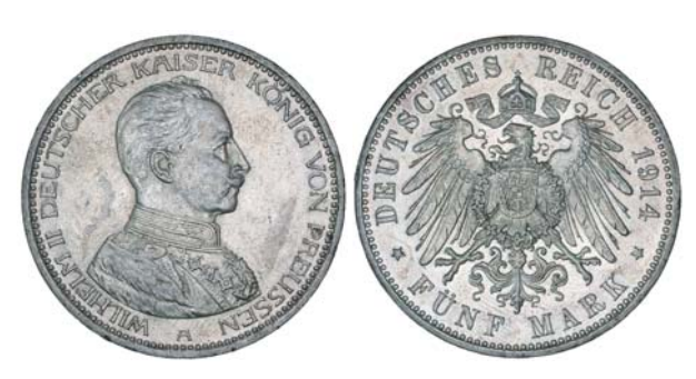
3923* Germany, Prussia, Wilhelm II, five mark, 1914A (KM.536). Good extremely fine/uncirculated. $80