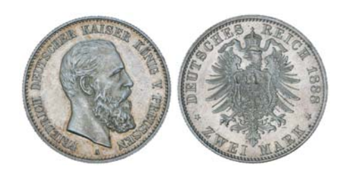
3922* Germany , Prussia, Friedrich III, proof-like two mark, 1888A (KM.510). Uncirculated . $70