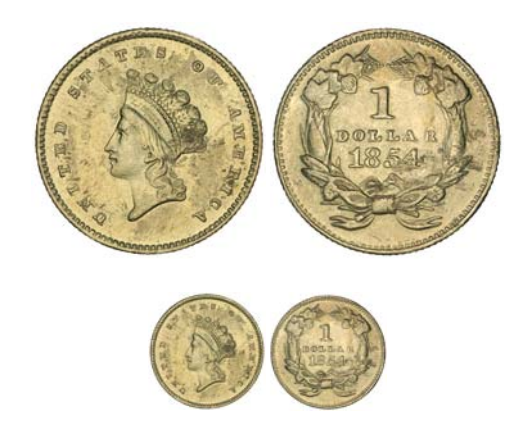
3811* USA, gold dollar, 1854, Indian head type 2. Very fine. $240