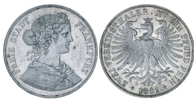
3921* Germany, Frankfurt am Main, two thaler, 1861 (KM.365). Nearly extremely finelextremely fine. $100