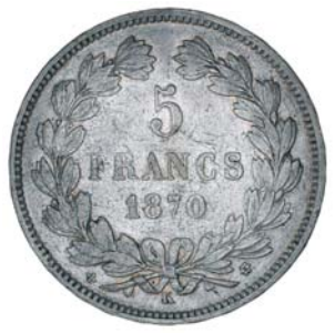
3918* France, Third Republic, five francs, 1870K (KM.818.3). Very fine and rare.