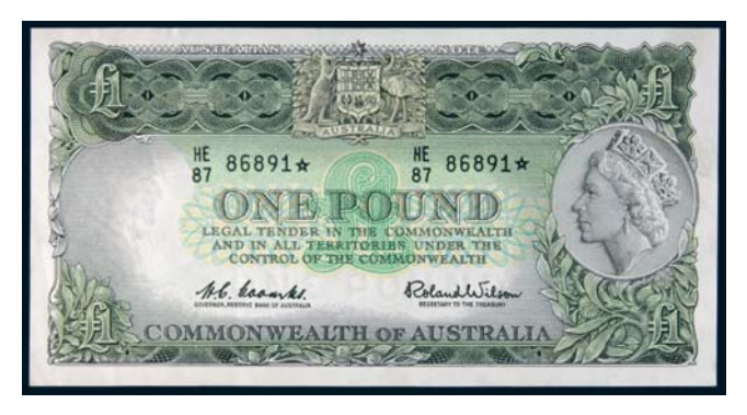
One pound, Coombs/Wilson (1961) HE/87 86891* (R.34bs). Vertical folds and minor creasing, otherwise crisp full bodied original, nearly uncirculated and rare thus.