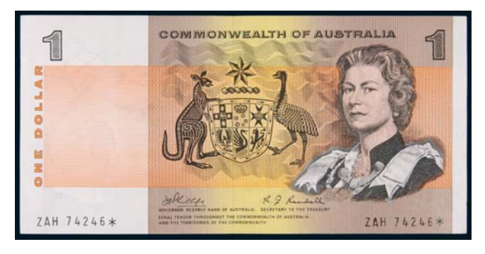
One dollar, Phillips/Randall (1969), ZAH 74246* (R.73s). Two vertical folds, good extremely fine.