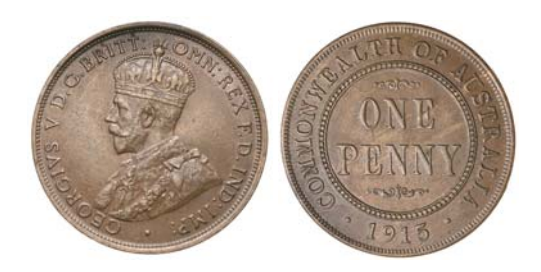
1649* George V, 1915. Brown, nearly extremely fine/extremely fine and rare. $200