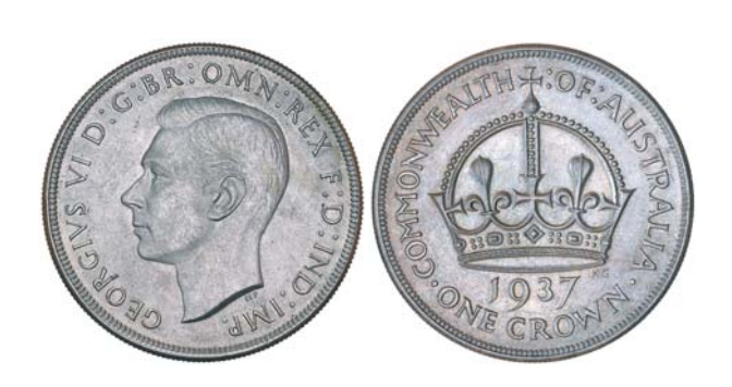
1527* George VI, 1937. Full mint bloom, light rub on cheek, virtually uncirculated. $100