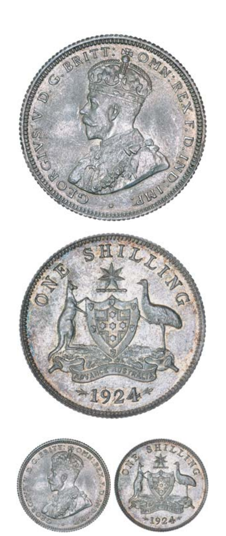
George V, 1924. Full original mint bloom, subdued obverse, choice uncirculated and rare in this condition, one of the finest known.