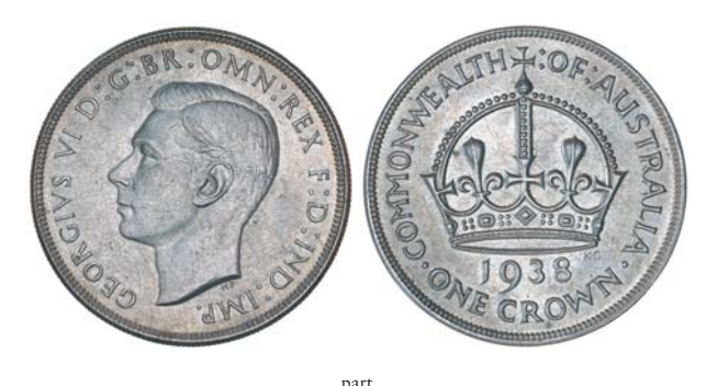
1528* George VI, 1937 and 1938. The first polished, good extremely fine; second attractive light tone, good extremely fine. (2)