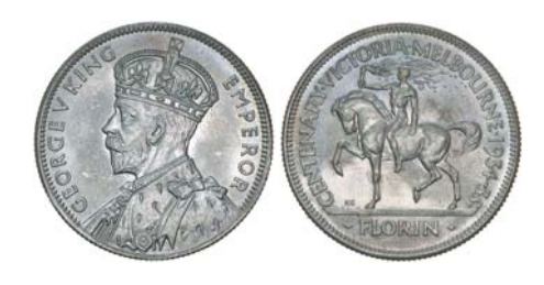
1565* George V, 1934-35 Melbourne Centenary. Full frosty mint bloom, uncirculated. $1,000