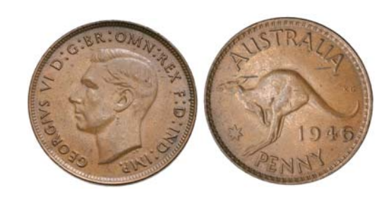
1679* George VI, 1946. The 4 and 6 double entered, hints of red, light brown, good extremely fine.