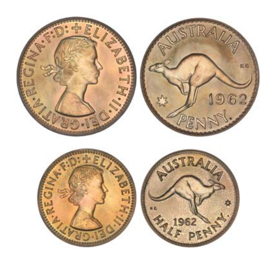
1517* Elizabeth II, Perth Mint proof set, 1962. Red , FDC. (2) $800