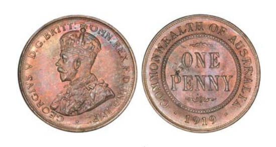
1654* George V, 1919, 1919 dot below. Good extremely fine; reverse carbon metal flaw, otherwise red uncirculated. (2) $500