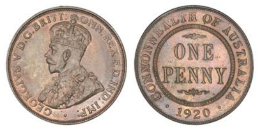
1655* George V, 1920 dot below lower scroll, Indian die. Brown and red, uncirculated. $900