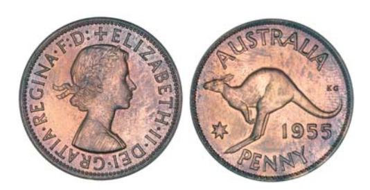
1485* Elizabeth II, Melbourne Mint proof penny, 1955. Dark toned and with some spotting, nearly FDC.

Elizabeth II, Melbourne Mint proof set, 1955. In lucite case , FDC. (4) $800