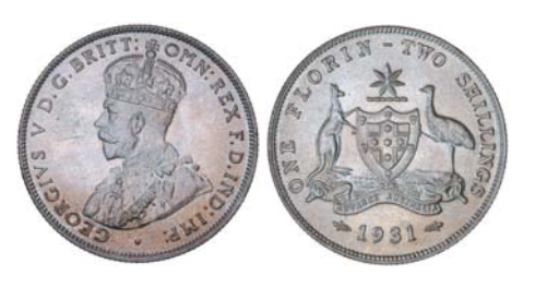
1555* George V, 1931. Choice uncirculated.