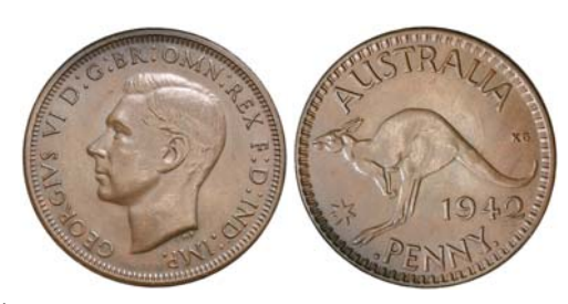
1676* George VI, 1942I. Missing I, even brown patina, nearly uncirculated and very rare in this condition, one of the finest known of this variety. $300