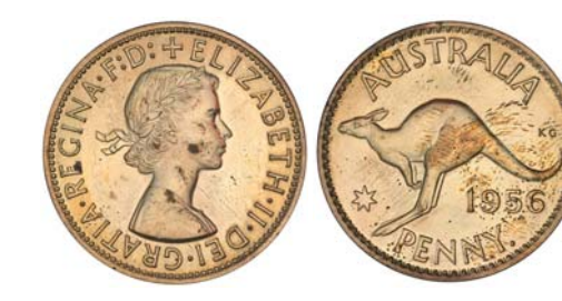
1492* Elizabeth II, Perth Mint proof penny, 1956. Minor carbon spots on obverse, otherwise full mint red, nearly FDC and rare.