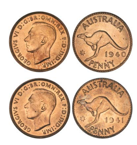
1673* George VI, 1940 and 1941. Full original mint red, choice uncirculated. (2) $300