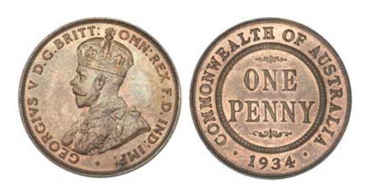
1670* George V, 1934. Red and brown, choice uncirculated. $350