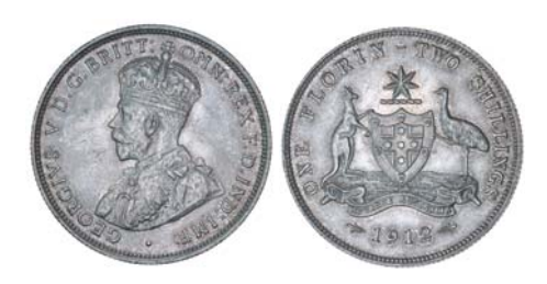
1534* George V, 1912. Light grey tone, nearly uncirculated/uncirculated and rare in this condition, one of the finest known.