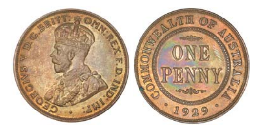
1666* George V, 1929, London die. Subdued red and brown mint bloom, uncirculated and rare in this condition.