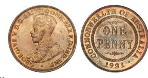
1658* George V, 1921, Indian die. Red and brown, uncirculated and rare in this condition.