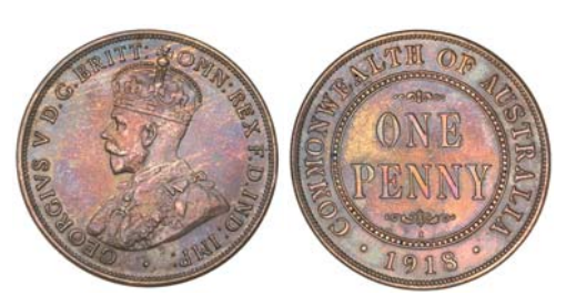
1653* George V, 1918I. Dark purple brown, rubbed, otherwise good extremely fine and rare. $750