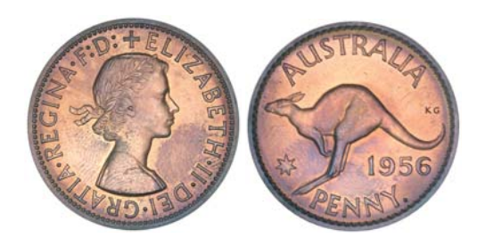
1491* Elizabeth II, Perth Mint proof penny, 1956. Dark toned, obverse and reverse field with finger print, nearly FDC. $4,500