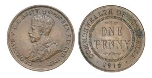
1650* George V, 1915H. Dark brown patina, dry oxidised spots on reverse, extremely fine or better.