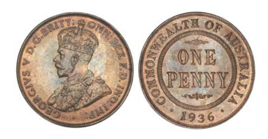
1671* George V, 1935 and 1936. Brown and red uncirculated, the first weak top centre of crown. (2) $300