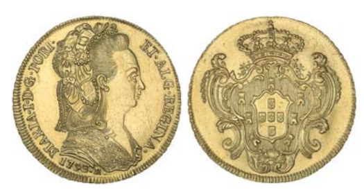
1332* Brazil, Mary I, 6,400 reis or half 'Johanna' 1793R (Rio) (KM.226.1). Obverse right field brushed, otherwise extremely fine.