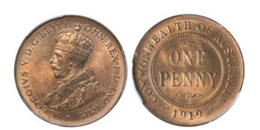
1696* George V, 1919 dot below scroll. Full original mint red, uncirculated. $750