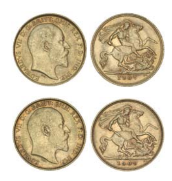
1466* Edward VII, 1907 and 1909 Melbourne. Good extremely fine; good very fine. (2) $500