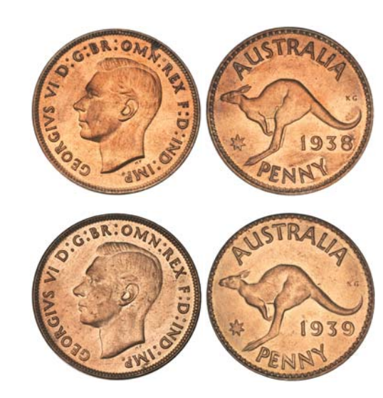
1672* George VI, 1938 and 1939. Full original mint red, choice uncirculated. (2) $300