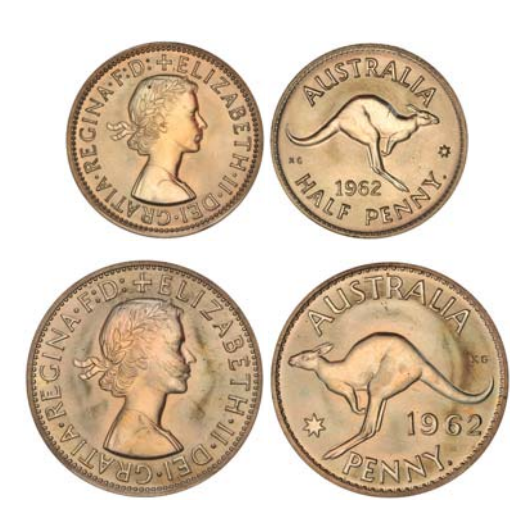
1518* Elizabeth II, Perth Mint proof set, 1962. Nearly FDC. (2) $600

1519 Elizabeth II, Perth Mint proof set, 1962. Slightest toning, full red, nearly FDC. (2)