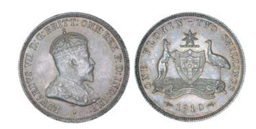
1532* Edward VII, 1910. Subdued light golden brown toned mint bloom, nearly uncirculated.