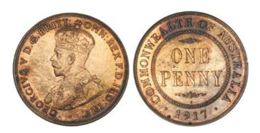
George V, 1917I. Red with lilac toned areas, uncirculated. $500