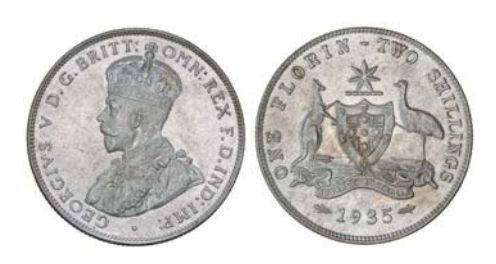
1567* George V, 1935. Uncirculated .