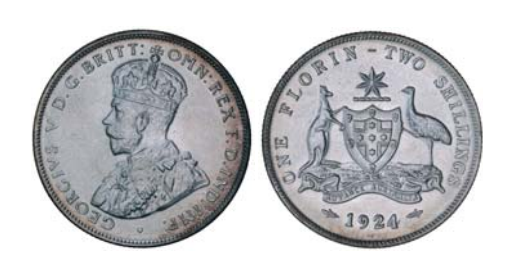
1552* George V, 1924. Has been dipped, otherwise uncirculated. $1,250

Ex the Richmond Collection, Noble Numismatics Sale 66 (lot 1409).