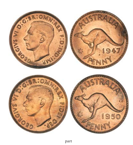
1680* George VI, 1947, 1948, 1949, 1950, 1951, 1952, all Melbourne Mint issues. Full blazing mint red, choice uncirculated. (6)