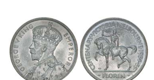
1564* George V, 1934-35 Melbourne Centenary. Full frosty mint bloom, uncirculated. $1,000