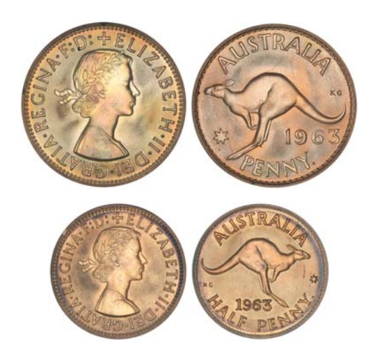
1522* Elizabeth II, Perth Mint proof set, 1963. Red , FDC. (2) $1,200

1521 Elizabeth II, Melbourne mint proof set, 1963. With black case of issue, FDC. (4) $300