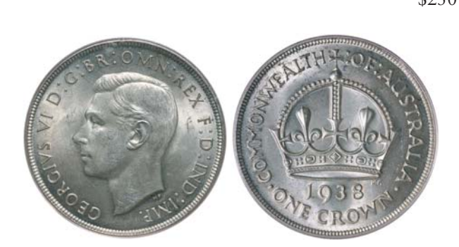
1529* George VI, 1938. Obverse hairlines, otherwise attractive mint bloom, nearly uncirculated/uncirculated. $750