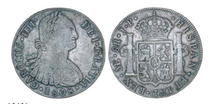
Peru, Charles IIII, eight reales 1808JP, Lima Mint, (KM.97). Toned, nearly very fine.