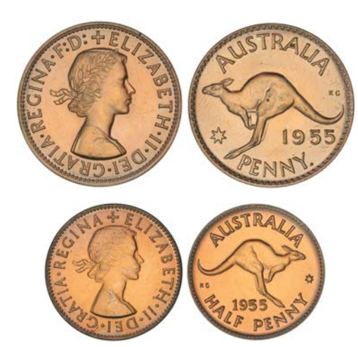
1487* Elizabeth II, Perth Mint proof set, 1955. Full original brilliant mint red proofs, FDC and rare. (2) $14,000