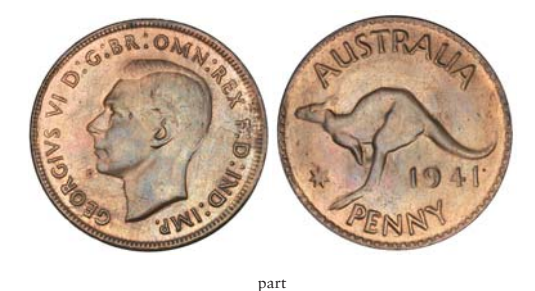
1675* George VI, 1941 K dot G and 1941Y. (Perth). Brown, nearly uncirculated; mostly red, uncirculated. (2) $300