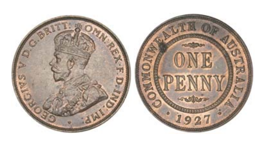
1664* George V, 1927, London die. Brown and red, uncirculated.