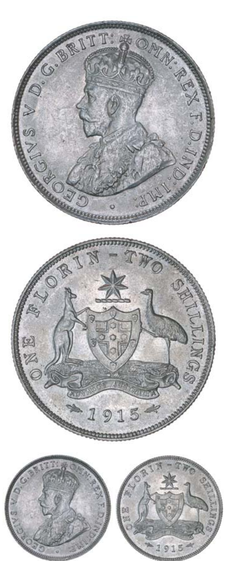
1538* George V, 1915. Some mint bloom, minor surface marks, otherwise nearly uncirculated and rare in this condition. $3,500

Ex the Richmond Collection, Noble Numismatics Sale 66 (lot 1399).