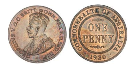
George V, 1920 dot above lower scroll, Indian die. Brown and red, uncirculated and rare in this condition. $1,500