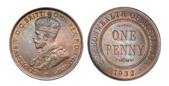
1668* George V, 1932, London die. Brown with traces of red, nearly uncirculated. $250