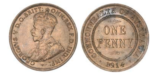
1648* George V, 1914. Brown and red, nearly uncirculated with three spot lacquered areas on the reverse. $500