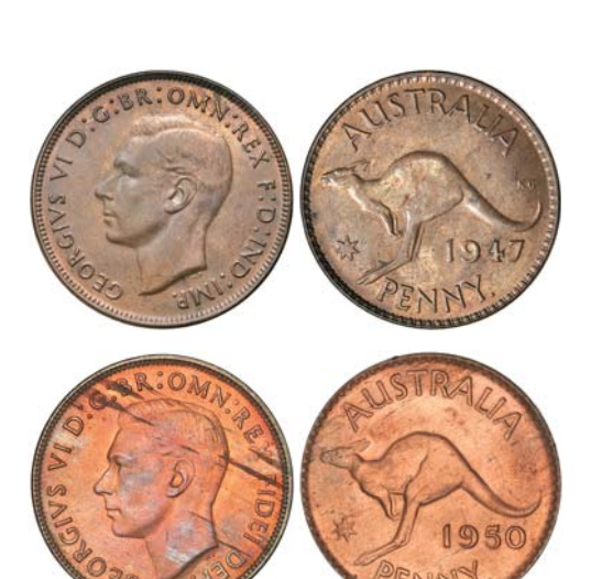
1681* George VI, 1947Y. and 1950Y., both Perth Mint issues. Toned uncirculated; red uncirculated. (2) $300