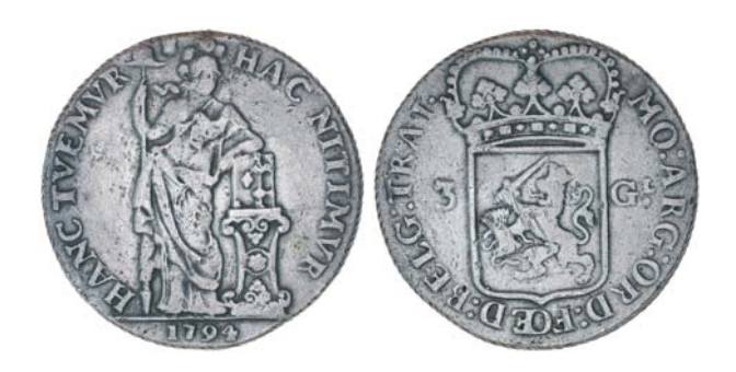
Netherlands, Utrecht, three gulden, 1794 (KM.117). Toned and fine.