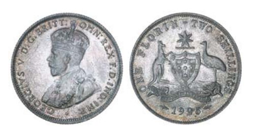
1553* George V, 1925. Lightly toned, underlying brilliance, uncirculated/choice uncirculated. $2,000