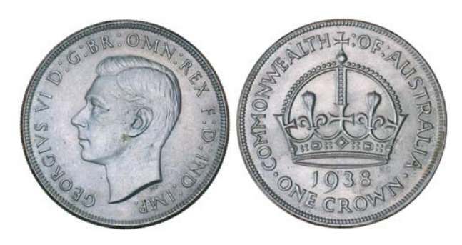
1530* George VI, 1938. Nearly uncirculated.