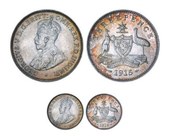
1629* George V, 1915. Attractive gold and iridescent toned reverse, full mint bloom, uncirculated/choice uncirculated and rare in this condition, one of the finest known. $6,500