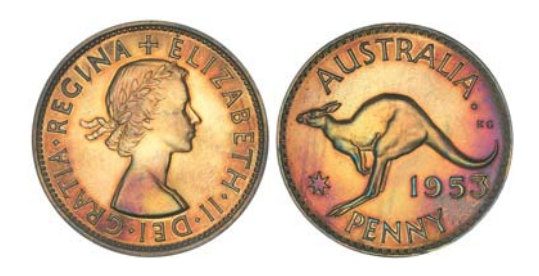
1482* Elizabeth II, Perth Mint proof penny, 1953. Attractive red brown FDC and very rare. $20,000