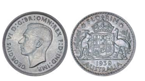
1571* George VI, 1939. Lightly toned reverse, nearly uncirculated. $400