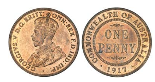
1652* George V, 1917I. Full mint red, choice uncirculated. $900