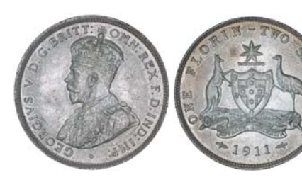
1533* George V, 1911. Minor contact marks on the obverse, otherwise full original mint bloom, uncirculated/choice uncirculated and rare in this condition, one of the finest known.