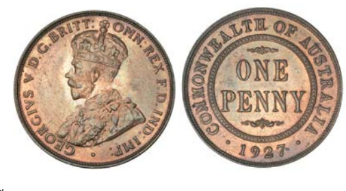
1701* George V, 1927, London die. Red and brown uncirculated. $400