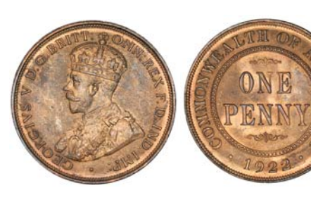
1698* George V, 1922, London die. Full mint red, uncirculated and rare in this condition.