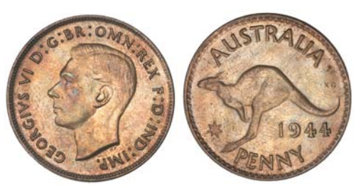
1678* George VI, 1944. Full dark mint red, choice uncirculated. $200