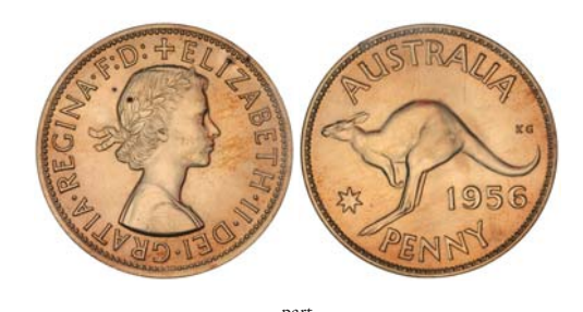
1489* Elizabeth II, Melbourne Mint proof set, 1956. In lucite case , FDC . (5) $1,000