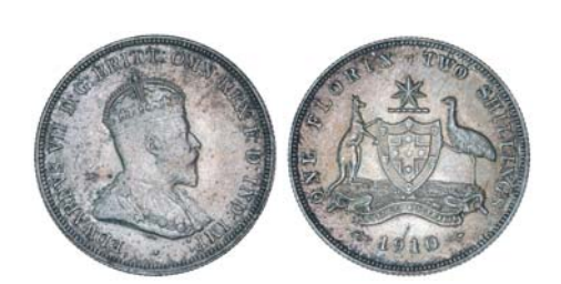
1531* Edward VII, 1910. Nearly uncirculated/uncirculated. $1,700