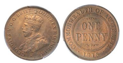
George V, 1918I. Subdued mottled full original mint red with some toned areas, uncirculated and rare, especially in this condition, one of the finest known.