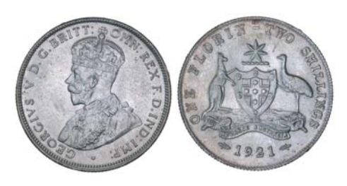
1545* George V, 1921. Frosty mint bloom, nearly uncirculated. $1,500

Ex Spink Australia Sale 6 (lot 1217), Noble Numismatics Sale 48 (lot 1799) and the E.S.Dobbin Collection.