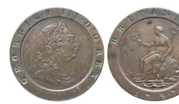
1339* Great Britain, George III, copper cartwheel twopence, 1797 (S.3776). Very fine .