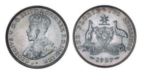
1554* George V, 1927. Well struck, full mint bloom, nearly uncirculated. $400