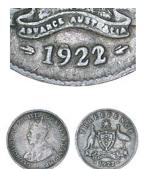
1635* George V, 1922/1 overdate. Clear Advance Australia, coin slightly bent, otherwise very good/nearly fine with clear overdate and very rare thus.