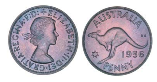
1490* Elizabeth II, Melbourne Mint proof penny, 1956. Dark toned, FDC. $300