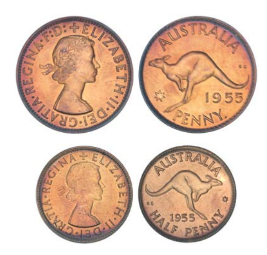
1488* Elizabeth II, Perth Mint proof set, 1955. Toned, halfpenny obverse die clashed, nearly FDC - FDC. (2)