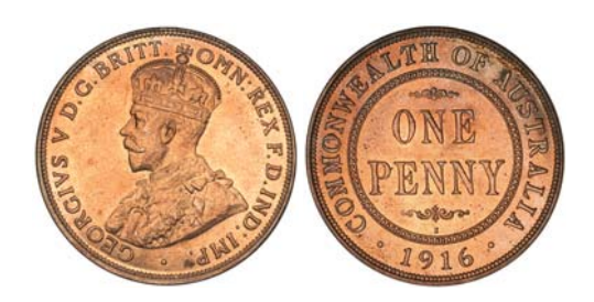
1651* George V, 1916I. Obverse brilliance, full mint red, choice uncirculated, one of the finest known. $1,000