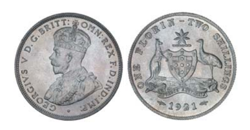
1544* George V, 1921. Full original mint bloom, nearly gem uncirculated and very rare in this condition, possibly the finest known.