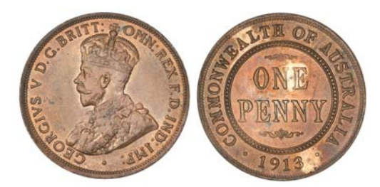
1647* George V, 1913. Red and brown, uncirculated and rare. $750