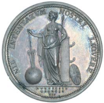
674* Captain James Cook, memorial medal in silver (43 mm) by L. Pingo for the Royal Society in 1784 (MH374; BHM258; Eimer 780). Rim nick at 8 o'clock on reverse, deep blue grey iridescent tone with underlying brilliance, good extremely