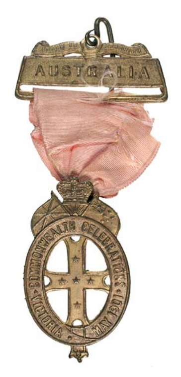
700* Commonwealth Celebrations, Victoria, May 1901, in silver gilt (50mm x 29mm) clasp Victoria (C.1901/10). Good very fine.