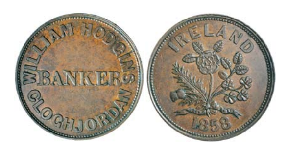
867* Hodgins, William, Cloghjordan penny, 1858 (A.659). Obverse die break at 2 o'clock, two hairline scratches on left of reverse, grey brown tone, extremely fine or better and scarce.