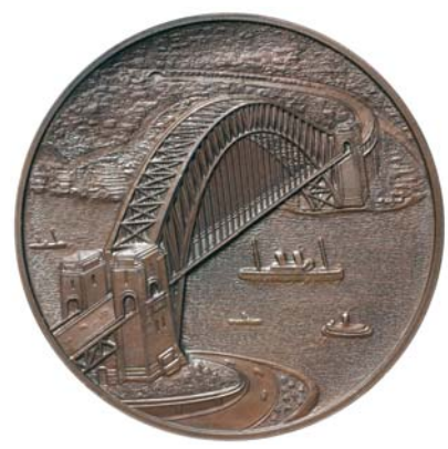
lot 773 part