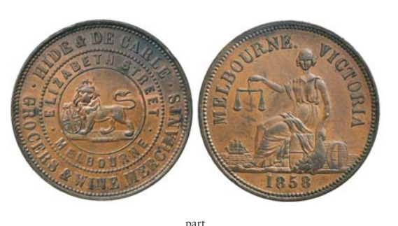
822* Hide & De Carle, Melbourne pennies, 1858 (A.241, 243, 244[illustrated]). Rim nick, good very fine; good very fine; traces of red, good extremely fine. (3)