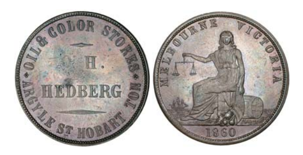
816* Hedberg, O.H., Hobart, seated figure mule penny, 1860 (A.199). Softly struck in centre as always, blue brown brilliant patina, uncirculated and rare.

815* Hanks and Lloyd, Sydney halfpenny, 1857 (A.193). Slightly sea affected, otherwise good extremely fine. $120