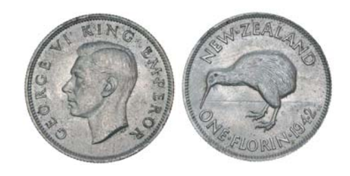
924* George VI, florin, 1942. Uncirculated .