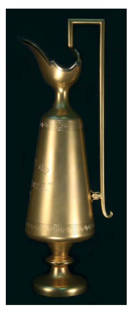
712* Broken Hill Cup, 1911, in 18ct gold (570g; 22.9cm) by Frederick Bass, art nouveau claret jug style with engraved arabesque pattern near top and bottom, removed from circular ebony base, cup with inscription, '1911/BROKEN HILL CUP/ won by/'MASTER KORAN'/3Yrs'. Uncirculated and rare.