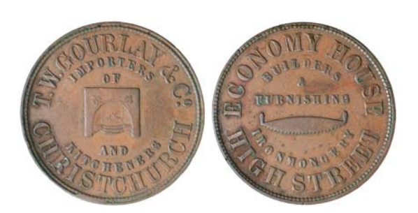
809* Gourlay, J.W. & Co., Christchurch penny, undated (A.151). Red brown patina, very fine. $200