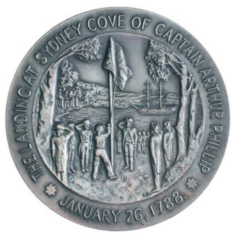
721* Australia's 150th Anniversary, 1938, in oxidised silver (57mm) by Amor (C.1938/7). Nearly extremely fine. $100