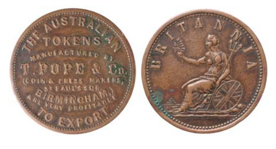
866* Pope, T. & Co., Birmingham penny, undated (A.658). Two verdigris areas , otherwise nearly very fine and scarce . $200