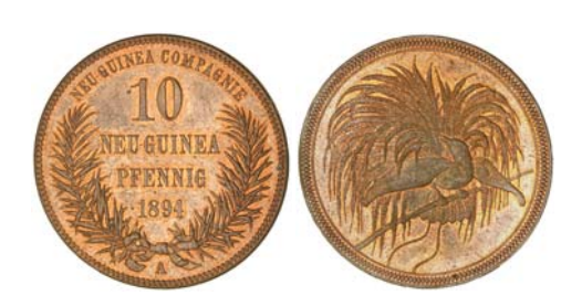
905* German New Guinea, bronze ten pfennig, 1894A. Nearly full original mint red, uncirculated. $500