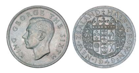
922* George VI, halfcrown, 1949. Uncirculated .