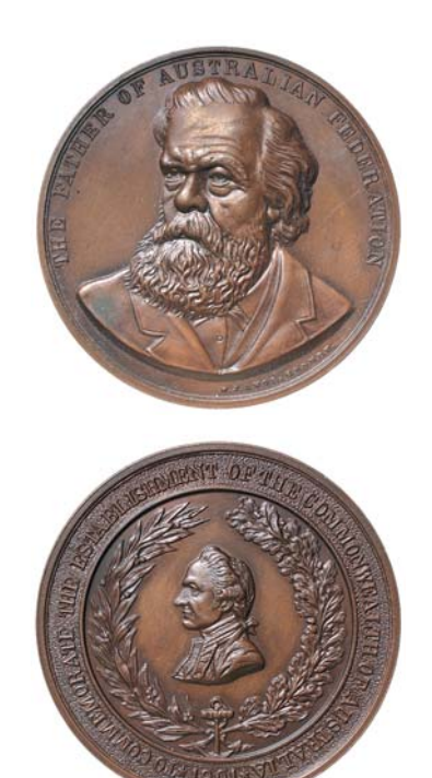
702* To Commemorate the Establishment of the Commonwealth of Australia, 1901, in bronze (44mm) by W.J.Amor Sydney (C.1901/39), reverse, The Father of Australian Federation. Good extremely fine.