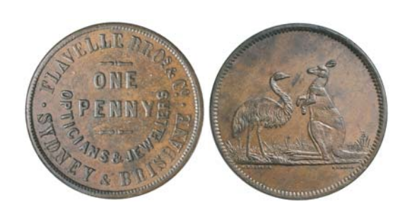
808* Flavelle Bros. & Co., Sydney & Brisbane penny, undated (A.126). Die break at 10 o'clock on reverse, second smaller dot under 'S' on obverse, glossy brown, good extremely fine and rare in this condition.