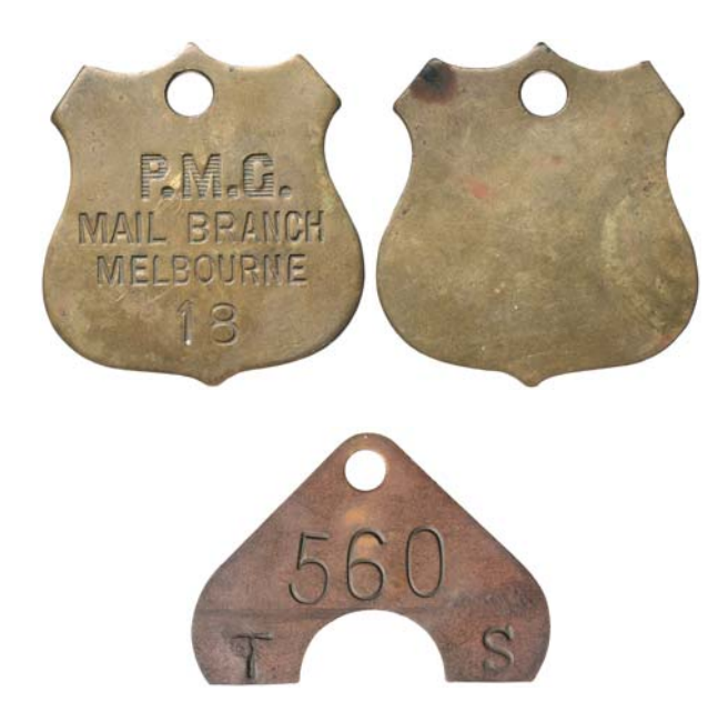
lot 887 part