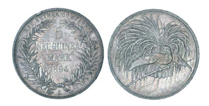
904* German New Guinea, five mark, 1894A. Toned, nearly extremely fine.