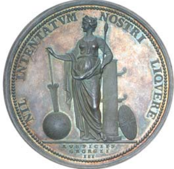
673* Captain James Cook, memorial medal in silver (43 mm) by L. Pingo for the Royal Society in 1784 (MH 374; BHM 258; Eimer 780). Beautifully toned golden brown iridescence, nearly FDC and one of the finest known.