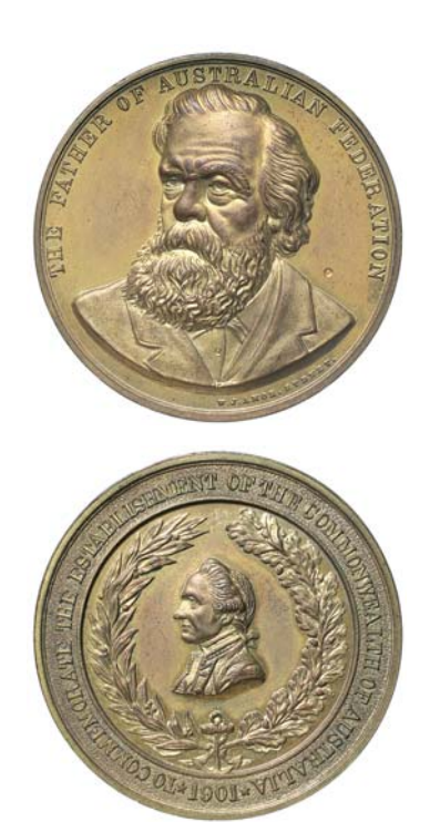
703* To Commemorate the Establisment of the Commonwealth of Australia, 1901, in gilt bronze (44mm) by W.J.Amor Sydney (C.1901/39), reverse, The Father of Australian Federation. Good extremely fine.