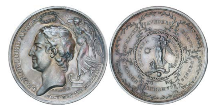
672* Admiral of the Fleet, Lord Anson, 1747 in silver (43 mm) by T. Pingo, names of the principal officers of the Centurion on her world voyage, 1740-3 (MIii634/325; Eimer 616). Slightly polished, otherwise extremely fine/good extremely fine and rare in silver.