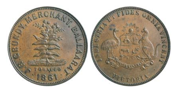
810* Grundy, J.R., Ballarat penny, 1861 (A.155). Glossy light brown patina, good extremely fine and rare in this condition, one of the finest known. $450