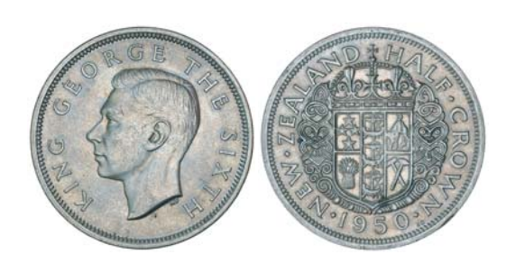
923* George VI, halfcrown, 1950 high diamond. A few tone spots on reverse, virtually uncirculated with mint bloom. $100