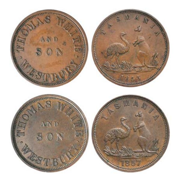
864* White, Thomas & Son, Westbury pennies, 1855 and 1857 (A.620, 622). Good very fine; good extremely fine. (2) $400