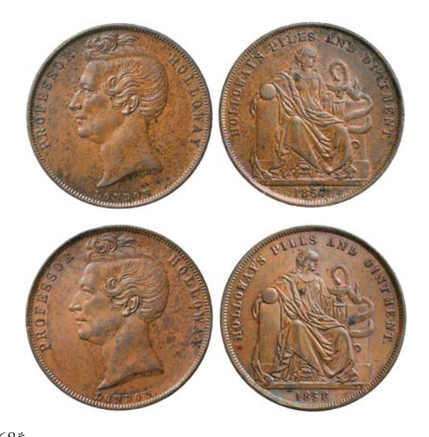
Holloway, Professor, London, England pennies, 1857 and 1858 (A.660, 668). Good extremely fine with hints of red; subdued mint bloom, nearly uncirculated. (2)