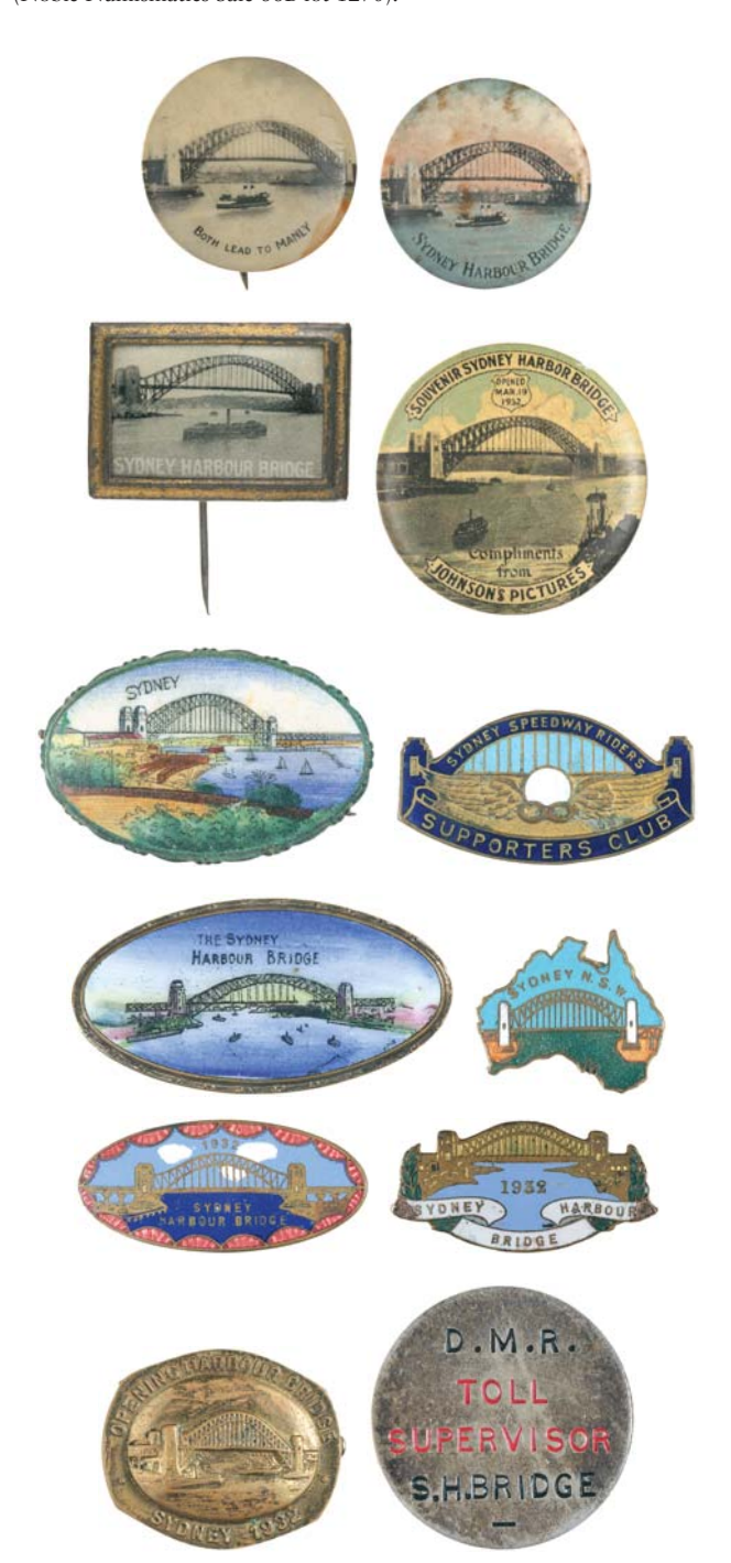
lot 775 part