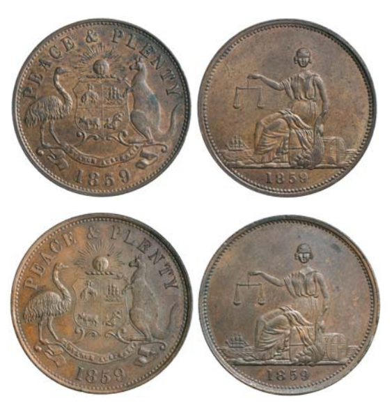
865* Peace & Plenty, Melbourne pennies, 1859 (A.655, 656). Good extremely fine; die axis upset by ten degrees to the left, nearly uncirculated. (2) $200