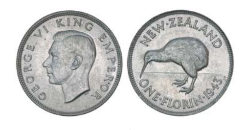
925* George VI, florin, 1943 and 1946. Second toned, uncirculated. (2) $250