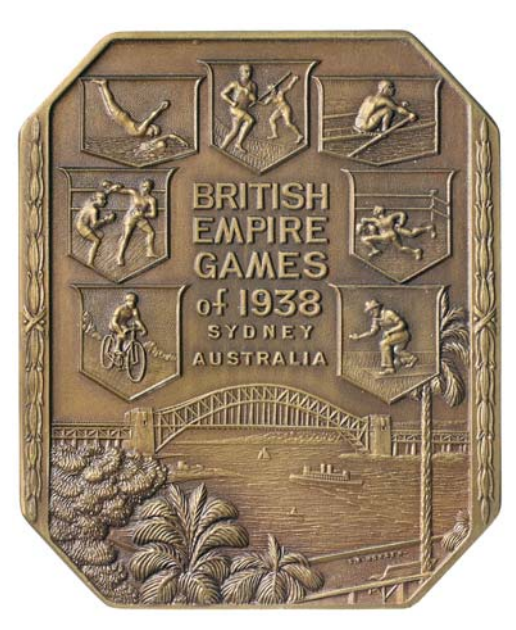
lot 773 part