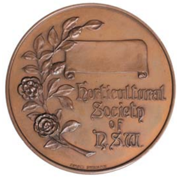
722* Horticultural Society of N.S.W., Walter G.Gates Memorial Medal, in bronze (44mm) by Amor Sydney, unnamed. Uncirculated .