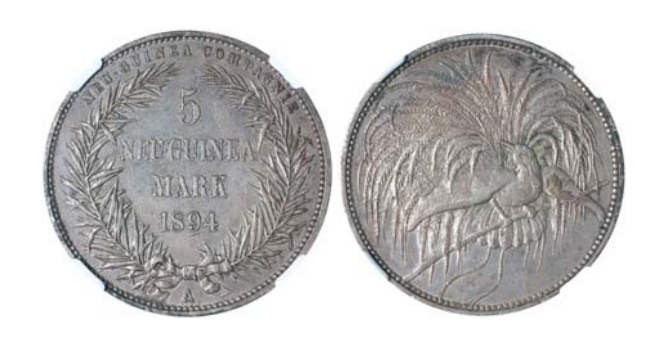
903* German New Guinea, five mark 1894A. Toned, nearly extremely fine.