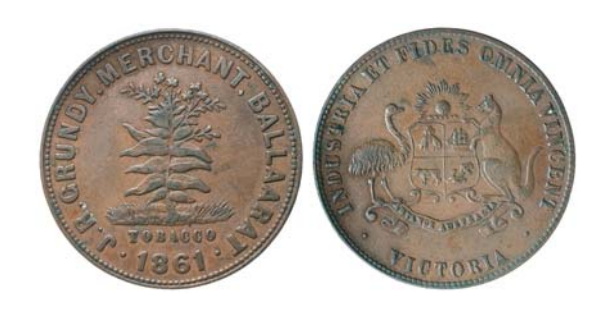
811* Grundy, J.R., Ballarat penny, 1861 (A.155). Brown patina, good very fine.