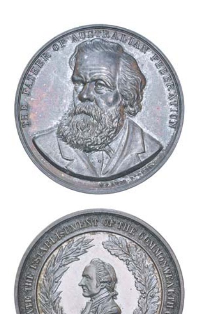
701* To Commemorate the Establishment of the Commonwealth of Australia, 1901, in silver (44mm) by W.J.Amor Sydney (C.1901/39), reverse, The Father of Australian Federation. Good extremely fine .