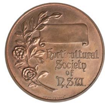
723* Horticultural Society of N.S.W., Walter G.Gates Memorial Medal, in bronze (44mm) by Amor Sydney, unnamed. Mint red, uncirculated .