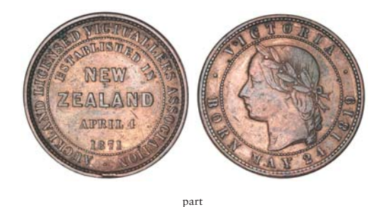
834* Licensed Victuallers Association, Auckland pennies, 1871 (A.326, 327). Fine; very fine. (2)

The first private purchase from Coin Trends, others ex Status Sale 266 (lot 6718).