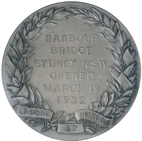
lot 773 part