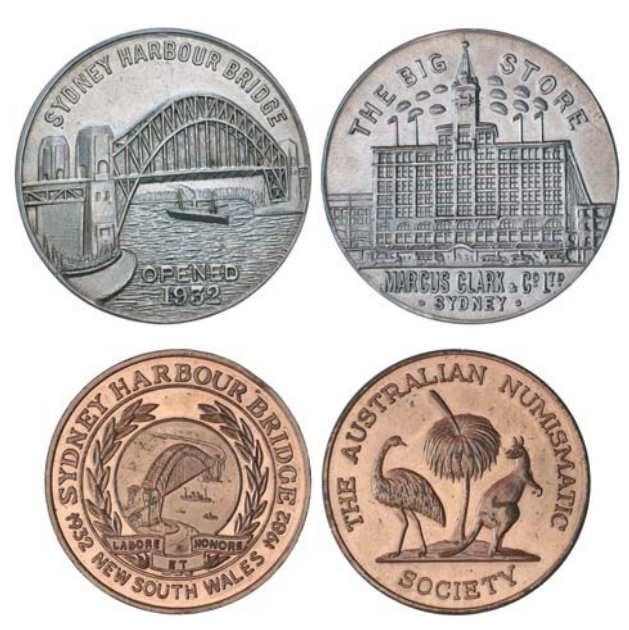
lot 775 part