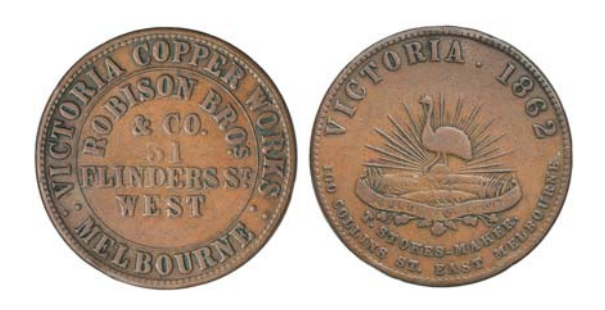
Robison Bros & Co., Melbourne penny, 1862 (A.460). Nearly very fine and rare.