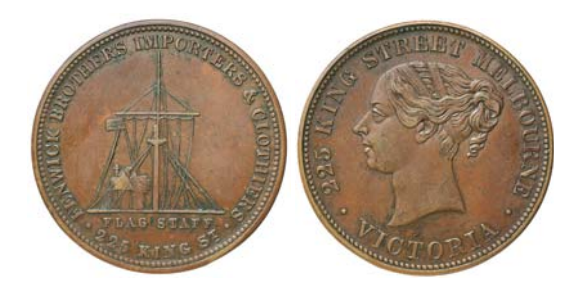
807* Fenwick Brothers, Melbourne penny, undated (A.121). Glossy brown, extremely fine and rare in this condition.