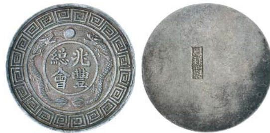
3956* China, Shanghai, c.1930, gambling token in silver 'Dao Yue sang' text, (9.33 g), with collector ticket. Extremely fine, rare.