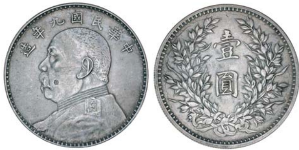
3950* China, Republic, general issue, Yuan Shih-kai silver dollar, year 9, (KM.Y.329.6). Mark on cheek, otherwise extremely fine or better.