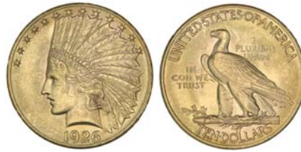
3866* USA, ten dollars or eagle, 1926, Indian head. Nearly uncirculated. $900