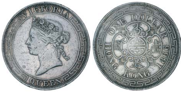
3995* Hong Kong, Queen Victoria, silver dollar, 1866 (KM.10). Nearly very fine.