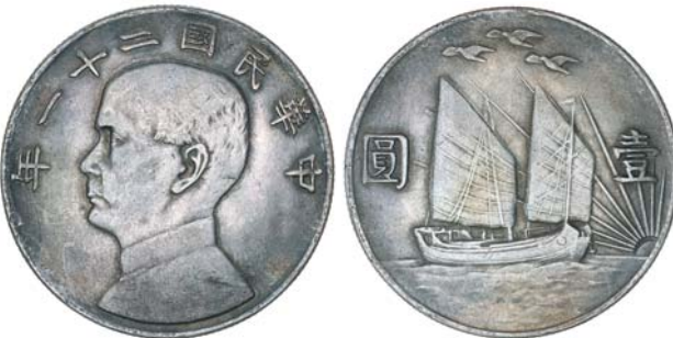
3951* China, Republic, Sun Yat-sen, silver dollar, Yr 21 (1932) birds over junk (KM.Y.344). Some surface toning, otherwise very fine.