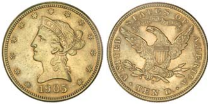
3862* USA, ten dollars or eagle, 1905S, Liberty head. Good extremely fine. $800