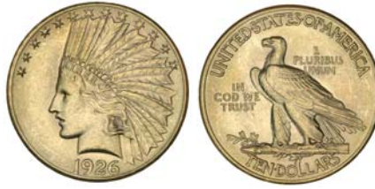
3867* USA, ten dollars or eagle, 1926, Indian head. Uncirculated. $750