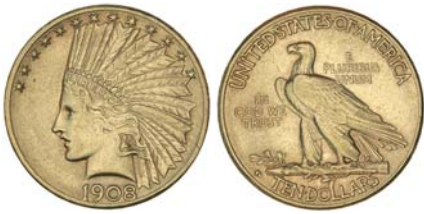
3863* USA, ten dollars or eagle, 1908D, Indian head. Extremely fine. $800