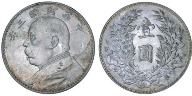
3949* China, Republic, Yuan Shih-Kai, silver dollar, Yr 3 (1914) (KM.Y.329). Brilliant, good extremely fine.