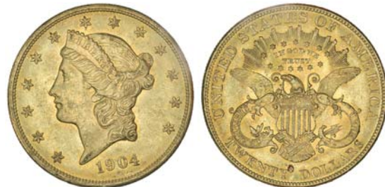
3870* USA, twenty dollars or double eagle, 1904, Liberty head. Nearly uncirculated. $1,700