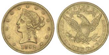
3860* USA, ten dollars or eagle, 1892, Liberty head. Nearly extremely fine/ extremely fine. $800