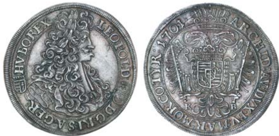
3998* Hungary, Leopold I, half thaler 1701KB (KM.251). Toned, nearly extremely fine.