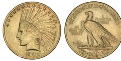
3868 USA, ten dollars or eagle, 1926 Indian head. Small edge nick, otherwise extremely fine. $750