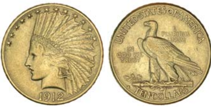
3865* USA, ten dollars or eagle, 1912S, Indian head. Good very fine. $850