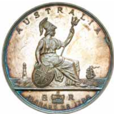
Lot 1579 obverse