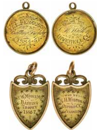
1576* Cricket fob, in gold (2.7gms, 25mm) , loop top suspension, obverse inscribed "W.L. Ferguson/Batting Trophy/1884-5" reverse inscribed "Won by/G.H. Wilton/Inverell C.C."; another, shield shape in gold (7.8gms, 32mm x 21mm), scroll and loop top suspension, obverse inscribed "S.W. Moore M.P./Batting Trophy/1886-7", reverse inscribed "Won by/G.H. Wilton/Oxford C.C./Inverell". Fine; very fine. (2)