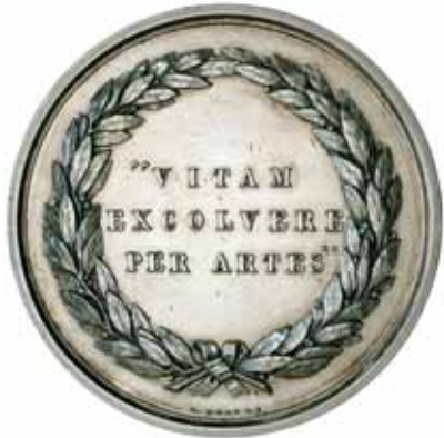
1572* Melbourne International Exhibition, 1880 , in silver (51mm) by H.Stokes, impressed around edge 'Andrew Newell - For Services'. Three small edge bruises on obverse, nearly extremely fine.