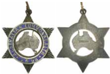
1588* Australia's Commonwealth , 3.6.98, in silver and enamel (27mm) voided. Extremely fine.