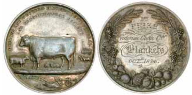
1565* Geelong and Western District Agricultural and Horticultural Society, 1874 , in silver (42mm) by Pinches, London, inscribed on reverse '1st / Prize / Victorian Cloth Coy / for / Blankets / Oct. 1874'. Extremely fine.