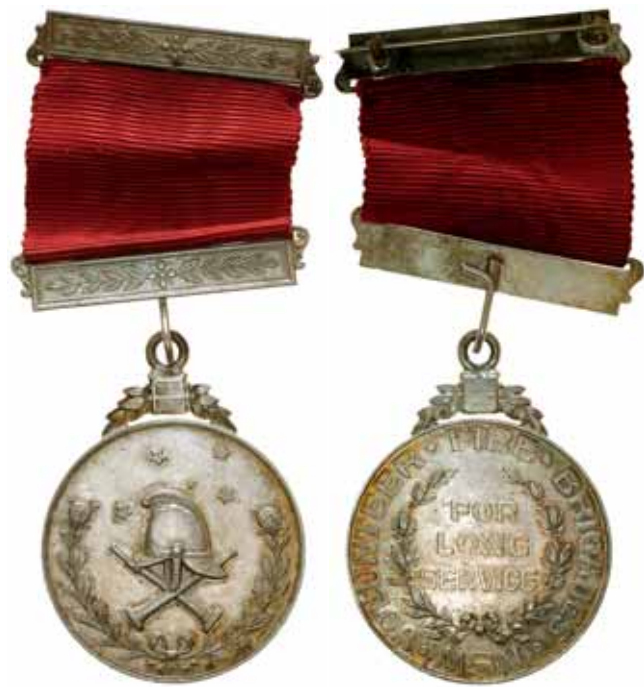
1639* New South Wales Fire Brigades , Long Service Medal (Volunteer) in silver, unnamed. Extremely fine. $250