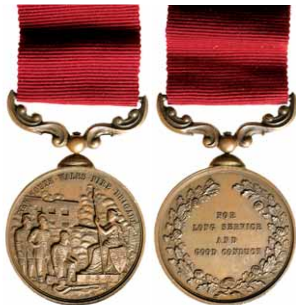
1640* New South Wales Fire Brigades , Long Service and Good Conduct Medal in bronze, unnamed. Extremely fine. $100