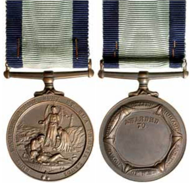
1635* Royal Shipwreck Relief Humane Society of N.S.W. , award medal in bronze (38mm), engraved "Specimen". Extremely fine and rare.