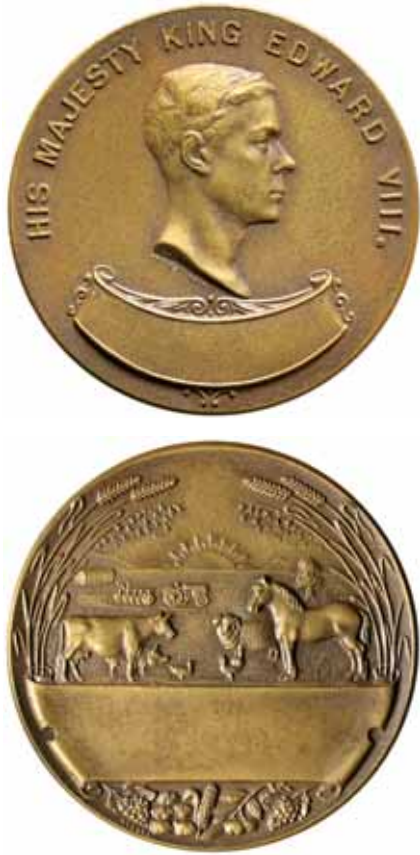
1633* His Majesty King Edward VIII , in bronze (54mm) by Stokes Melb, trial strike of a medal that was never issued. Uncirculated, in a Stokes & Sons fitted card box.