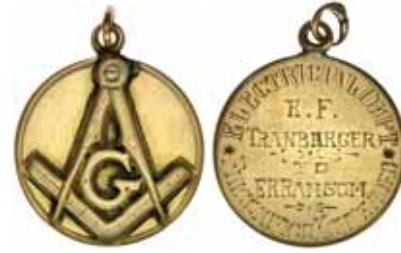
1598* Masonic fob c.1910 , handcrafted in gold (11.8gms, 25mm), ring top suspension, reverse inscribed "Electrical Dept/ Frigorifico Montevideo/H.F. Tranbarger/to/E.R. Ransom". Very fine.