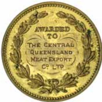
1589* Greater Britain Exhibition 1899 , Earls Court, London, in gilt (45mm) reverse inscribed "The Central/Queensland/Meat Export/Co Ltd". Good very fine.