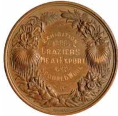
1575* The National Agricultural & Industrial Association of Queensland, in bronze (51mm) by J.S. & A.B. Wyon, reverse inscribed "Graziers Butchering Coy/First Prize/Fellmongered Wool/1884"; another inscribed "Exhibition/1896/Graziers/Meat Export/Coy/Scoured Wool". Nearly extremely fine.