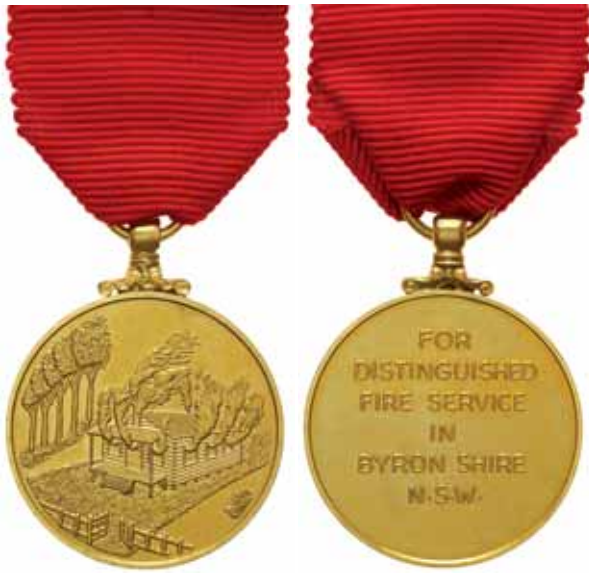
1642* Byron Shire (New South Wales) Distinguished Fire Service Medal , unnamed. Extremely fine .