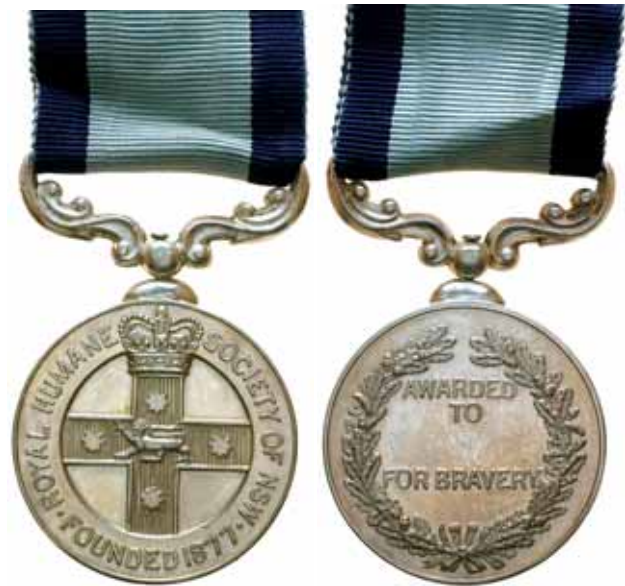
1636* Royal Humane Society of New South Wales , silver medal For Bravery, unnamed. Very fine.