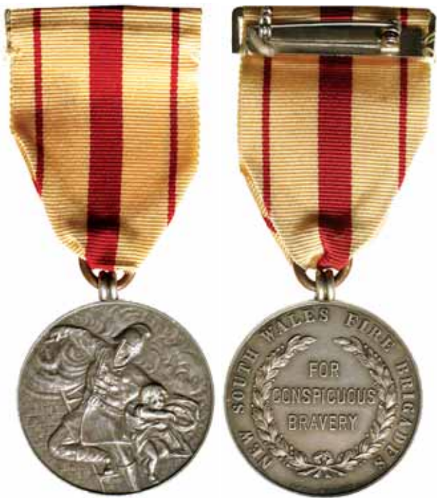
1637* New South Wales Fire Brigades , silver medal For Conspicuous Bravery, by Amor, unnamed. Extremely fine and very rare. $500