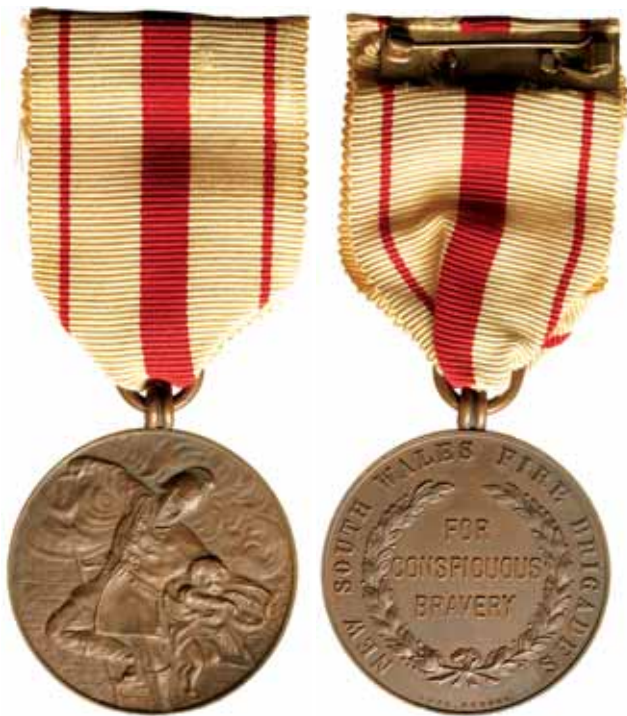
1638* New South Wales Fire Brigades , bronze medal For Conspicuous Bravery, by Amor, unnamed. Extremely fine and rare. $300