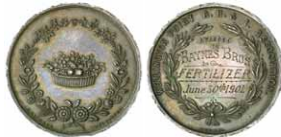
1592* Wellington Point (Queensland) A.H. & I. Association , award medal in silver (35.5mm) by A.H.W. & Co., inscribed on reverse "Baynes Bros/Fertilizer/June 30th 1901". Nearly extremely fine and very rare.