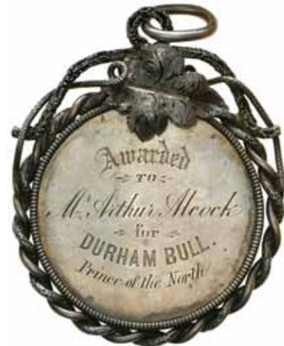
1566* Bombala Exhibition 1876 , silver disc inside an ornately designed frame, 65mm x 50mm, ring top suspension, obverse inscribed "Bombala Exhibition/1876" reverse inscribed "Awarded/to/Mr Arthur Alcock/for/Durham Bull/Prince of the North". Good very fine and rare.