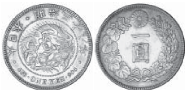
1901* Japan , Meiji, one yen, year 38, (1905), type II, (KM. Y.A25.3). Nearly uncirculated. $220