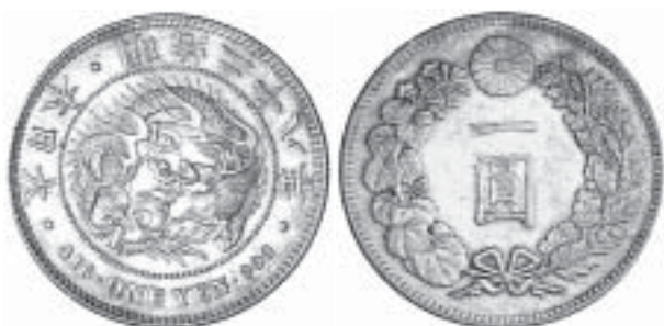
1899* Japan , Meiji, one yen, year 28, (1895), type II, (KM. Y.A25.3). Lightly toned, nearly uncirculated. $100