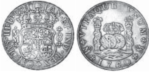
1925* Mexico , Charles III, eight reales pillar dollar, Mexico City mint, 1760 M/M., (KM.105). Very fine and scarce.