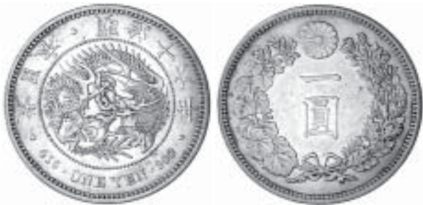
1893* Japan, Meiji, one yen, year 16, (1883), type 1, (KM. Y.A25.2). Good very fine and scarce.