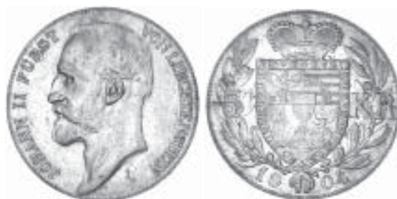
1906* Liechtenstein , Prince John II, five kronen, 1904 (KM.4). Lightly toned, extremely fine or better. $150