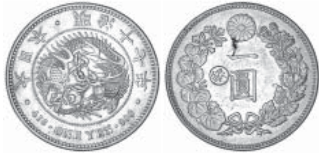
1895* Japan, Meiji, one yen, year 17, (1884), type 1, (KM. Y.A25.2), countermarked on reverse with "Gin" mark, (KM.Y.A28a.1). Good very fine and scarce.