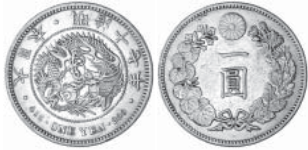
1894* Japan, Meiji, one yen, year 17, (1884), type 1, (KM. Y.A25.2). Good very fine and scarce.