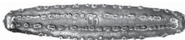
1904* Laos , Kingdom, (1591-1707), silver double tamlung, “Tiger tongue” or Hoi money, issued from Vientiane, (61.0 grams), cast, the tiger tongue raised design on obverse, plain reverse, with one snake symbol stamp in centre area, issued early - mid 17th century, (Le May Pl.IV, 1, M.3005-3006). Good very fine. $150