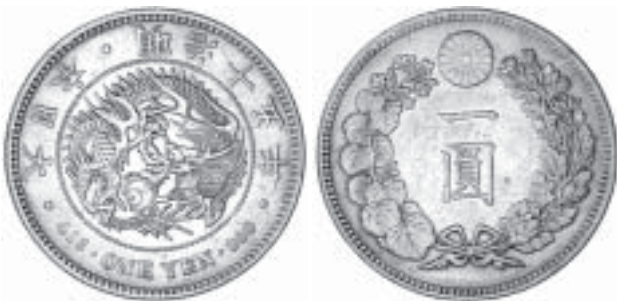
1892* Japan, Meiji, one yen, year 15, (1882), type 1, (KM. Y.A25.2). Good very fine and scarce.