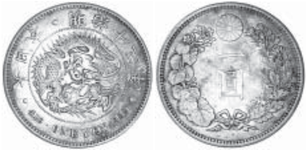
1891* Japan, Meiji, one yen, year 13, (1880), type 1, (KM. Y.A25.2). Good very fine and scarce.