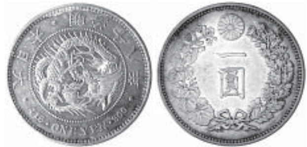
1896* Japan, Meiji, one yen, year 18, (1885), type 1, (KM. Y.A25.2). Good very fine and scarce.