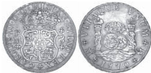
1927* Mexico , Charles III, eight reales pillar dollar, 1770 FM, (KM.105). Toned, nearly very fine.