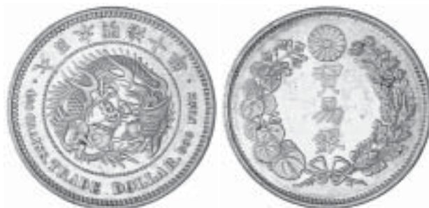
1903* Japan , Meiji, trade dollar, year 10, (1877), (KM. Y.14). Very minor rim nick, otherwisew extremely fine and rare. $1,000