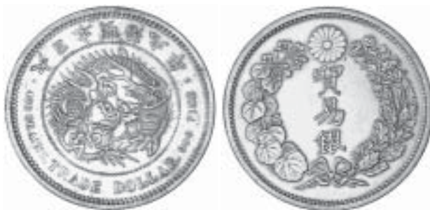
1902* Japan , Meiji, trade dollar, year 9, (1876), (KM. Y.14). Brilliant, extremely fine and rare. $900