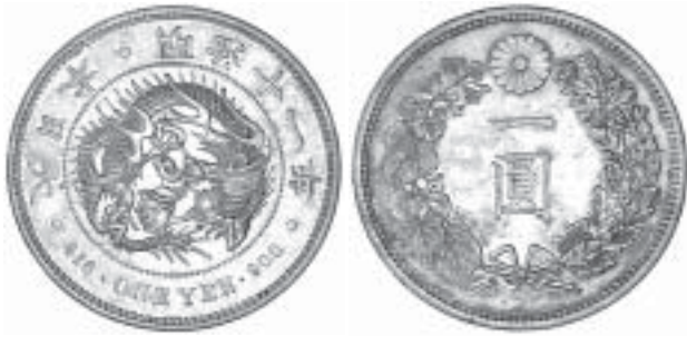
1890* Japan, Meiji, one yen, year 11 (1878) variety B (KM.A25.2). Underlying brilliance, attractively toned nearly uncirculated and rare.