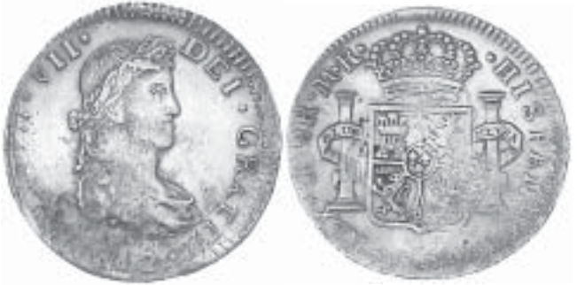
1929* Mexico , Ferdinand VII, eight reales, Guadalajara mint, 1812MR, (KM.111.3). Apparently damaged by fire for part of the coin near the date, 2 of date clear, officials letters MR clear but weak in places, coin of crude style as are the other known examples, head very fine, but generally very good - good fine and extremely rare.