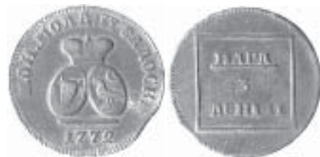
1932* Moldavia & Wallacia , principality, copper two paros 1773 and paros 1772 (KM 2, 3). Good very fine. (2)