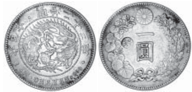
1897* Japan, Meiji, one yen, year 23, (1890), type 2, (KM. Y.A25.3), countermarked on reverse with "Gin" mark, (KM.28a.2). Good very fine and scarce.