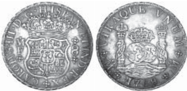
1926* Mexico , Charles III, eight reales pillar dollar, Mexico City mint, 1768 M/F., (KM.105). Good very fine and scarce.