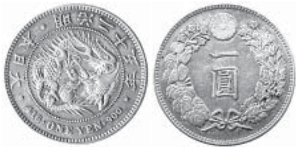
1898* Japan , Meiji, one yen, year 25, (1892), type II, flame overlaps third spine of dragon, (KM. Y.A25.3). Nearly extremely fine. $80