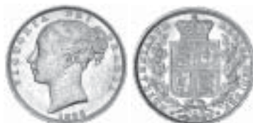
1331* Queen Victoria , 1885 Sydney. Obverse contact marks otherwise nearly uncirculated.