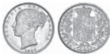
1330* Queen Victoria , 1885 Sydney. Nearly uncirculated.