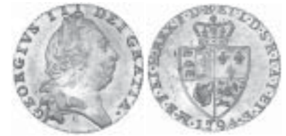
1246* Great Britain , George III, guinea, fifth bust or spade type, 1794 (S.3729). Extremely fine.