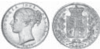
1324* Queen Victoria , 1872 Melbourne. Obverse die cracks, one through 1 of date, good extremely fine.