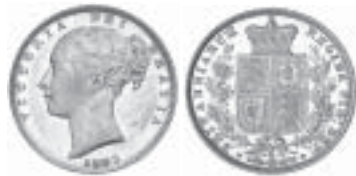
1329* Queen Victoria , 1883 Melbourne. Nearly uncirculated and rare.