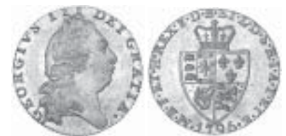
1248* Great Britain , George III, guinea, fifth bust or spade type, 1796 (S.3729). Extremely fine, very scarce.