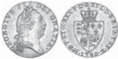
1241* Great Britain , George III, guinea, fifth bust or spade type, 1790 (S.3729). Extremely fine.