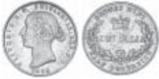
1322* Queen Victoria , second type, 1863. Good fine and rare.