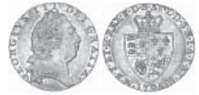
1247* Great Britain , George III, guinea, fifth bust or spade type, 1795 (S.3729). Nearly extremely fine/extremely fine, very scarce.