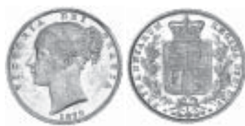
1327* Queen Victoria , 1879 Sydney. Nearly uncirculated.