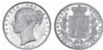
1328* Queen Victoria , 1879 Sydney. Good extremely fine.