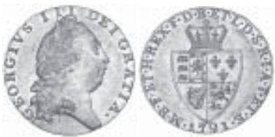
1242* Great Britain , George III, guinea, fifth bust or spade type, 1791 (S.3729). Good very fine/extremely fine.