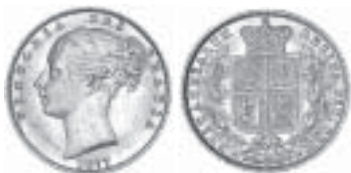
1325* Queen Victoria , 1877 Sydney. Extremely fine.