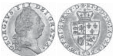
1244* Great Britain , George III, guinea, fifth bust or spade type, 1792 (S.3729). Nearly extremely fine/extremely fine, scarce.