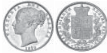
1326* Queen Victoria , 1878 Sydney. Good extremely fine.