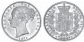
1323* Queen Victoria , 1871 Sydney, ww incuse. Extremely fine.

Ex "Douro" Cargo (lot 1482, illustrated) and Noble Numismatics Sale 56 (lot 1441).