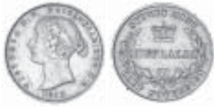
1321* Queen Victoria , second type, 1862. Very fine.