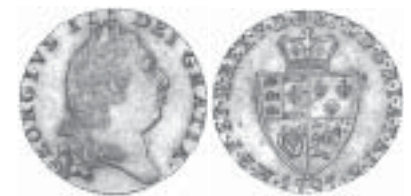
1249* Great Britain , George III, guinea, fifth bust or spade type, 1797 (S.3729). Good extremely fine.