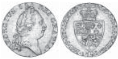
1243* Great Britain , George III, guinea, fifth bust or spade type, 1791 (S.3729). Nearly very fine.