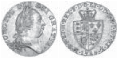
1239* Great Britain , George III, guinea, fifth bust or spade type, 1788 (S.3729). Good extremely fine.