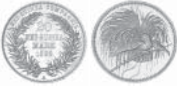
617* German New Guinea , twenty mark 1895A. Proof-like good extremely fine or nearly uncirculated and very rare. $18,000