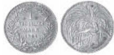
622* German New Guinea , one mark 1894 A. Toned, good very fine. $200