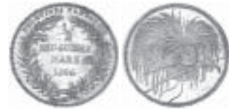
624* German New Guinea , half mark, 1894 A. Nearly extremely fine. $250