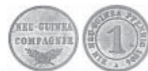
627* German New Guinea , one pfening, 1894A. Red and brown, uncirculated. $250