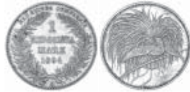
621* German New Guinea , one mark, 1894A. Good very fine. $250