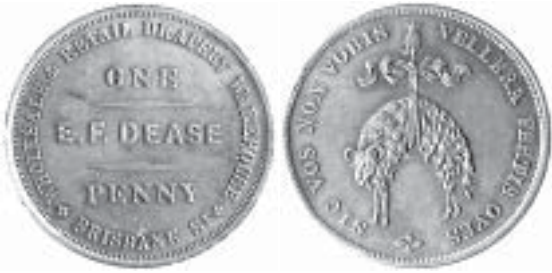
451* Dease, E.F. , Launceston penny, undated (A.99). Struck like a proof, light red brown uncirculated and rare thus.