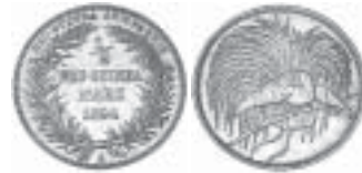
623* German New Guinea , half mark, 1894A. Good extremely fine. $400