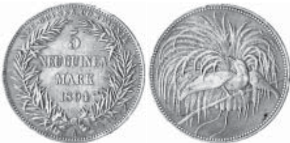
619* German New Guinea , five mark 1894A. Rim nicks otherwise good very fine. $1,400