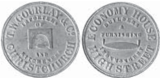
454* Gourlay, T.W. & Co. , Christchurch penny, undated (A.150). Even brown patina good very fine and very scarce thus.