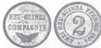
626* German New Guinea , two pfening, 1894 A. Red uncirculated and scarce thus. $400