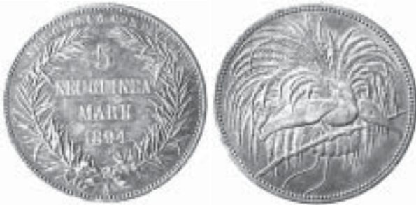
618* German New Guinea , five mark, 1894A. Toned, very fine. $1,500