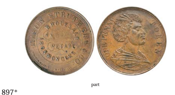
Mason Struthers & Co , Christchurch pennies, undated (A.354, 355 [illustrated]). Good very fine; obverse die cud at 8 o'clock, nearly extremely fine. (2)

Private purchase from Downies, Sydney, 2000.