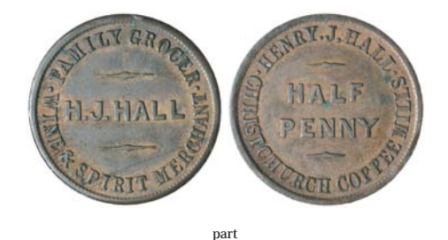
817* Hall , Henry J., Christchurch penny and halfpenny, undated (A.159, 161 [illustrated]). Fine; good very fine. (2)