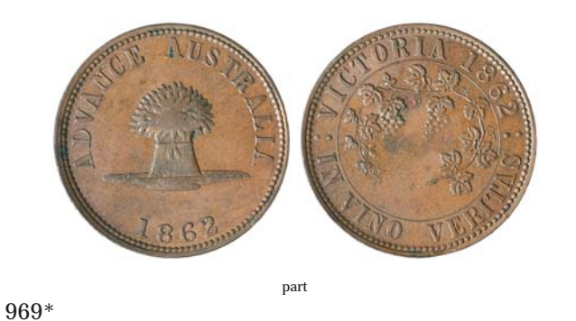
Stokes, T., Melbourne pennies, 1862 (A.549, 552, 553, 554, 555 [illustrated]). The first, third, fourth and fifth with die axis upset 180 degrees, good fine - nearly extremely fine. (5)

The last ex Noble Numismatics Sale 75 (lot 746).