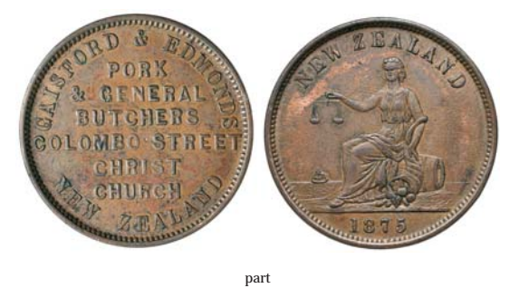
Gaisford & Edmonds , Christchurch penny, 1875 (A.142) [illustrated]; Gilmour, John, New Plymouth penny, undated (A.143). Good very fine; nearly extremely fine. (2)