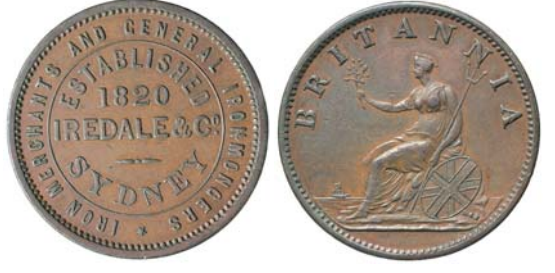
Iredale & Co., Sydney penny, undated (A.291). Good very fine and rare.