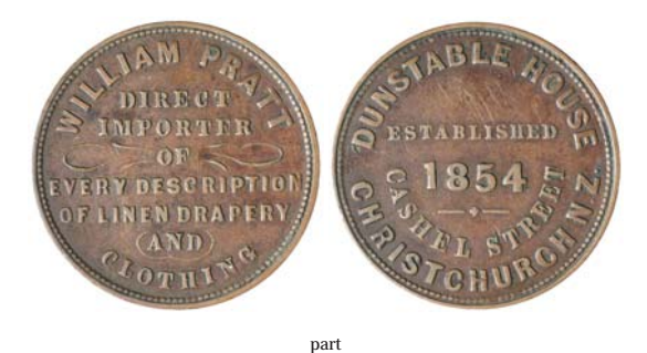
Pratt , William, Christchurch pennies, undated (A.443, 444 [illustrated], 445). Pitted, fine; good very fine; pitted on obverse, otherwise very fine. (3)