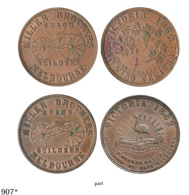
Miller Brothers , Melbourne pennies, 1862 (A.371, 372 [illustrated], 373, 374 [illustrated]). Except for A.373 all with die axis upset 180 degrees, very fine - nearly extremely fine. (4)

The second private purchase from Coin Trends, the third from I.S.Wright.