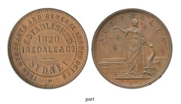
Iredale & Co., Sydney penny, undated (A.292). Brown and red, nearly uncirculated and rare. $200