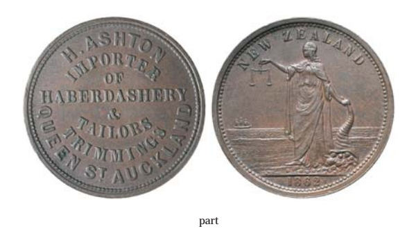
732* Ashton, H., Auckland pennies, 1862 [illustrated] and 1863 (2) (A.21, 22, 23). Extremely fine; good very fine; very fine. (3)

Private purchase from Coin Trends, March 2007.