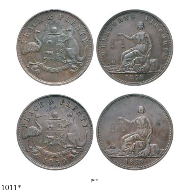
Peace & Plenty , Melbourne pennies, 1858 and 1859 (A.650 (upset 180 degrees), 651, 651 (upset), 652 [illustrated], 654 (upset), 655 [illustrated], 656). Very fine - extremely fine. (7)