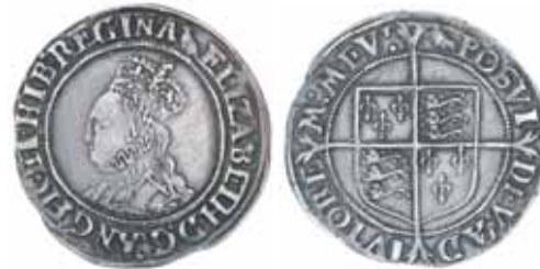
3133* Elizabeth I , (1558-1603), second issue, 1560-1, silver shilling, mm martlett, bust 3C (S.2555). Toned, nearly very fine. $600