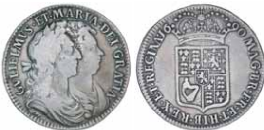
3172* William and Mary , silver halfcrown, first busts, 1690 secundo (S.3435). Evenly worn very good/ nearly fine. $150