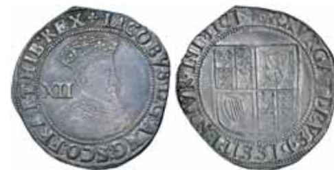
3139* James I , (1603-1625), first coinage, silver shilling, second bust, mm lis, 1603-4, (S.2646, N.2073). Lightly toned, good very fine, scarce.