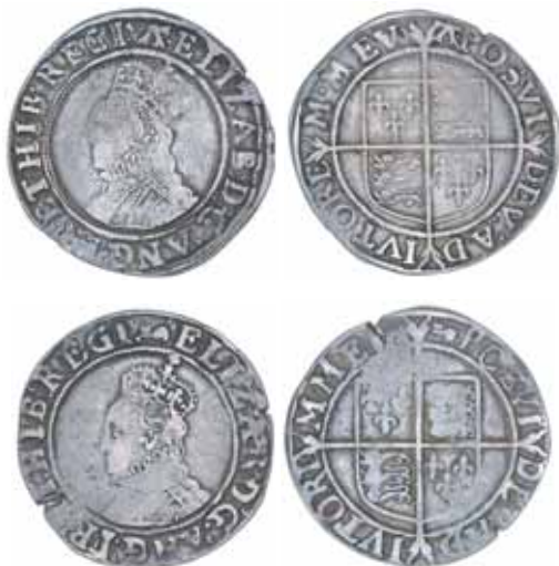
3136* Elizabeth I , (1558-1603), sixth issue, 1582-1600, silver shillings, mint mark A, another mint mark Key (S.2577). Toned, fine. (2)