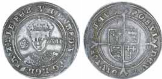
3129* Edward VI , (1547-1553), fine silver coinage, 1551-3, silver shilling, mint mark Y (S.2482). Flattened on portrait, otherwise good fine. $300