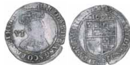
3140* James I , (1603-1625), first coinage, 1603-4, silver sixpence, 1604, second bust, mint mark thistle (S.2648). Toned, good fine.