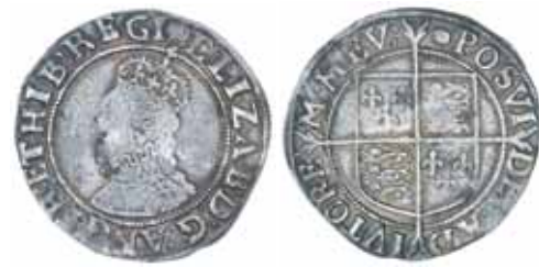
3137* Elizabeth I , (1558-1603), sixth issue, 1582-1600, silver shilling, mm tun (1592-5) (S.2577). Toned, portrait flattened, otherwise fine.