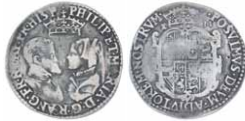
3130* Philip and Mary , (1554-1558), silver shilling, undated (S.2498). Clear portraits, fine/very good and rare. $600