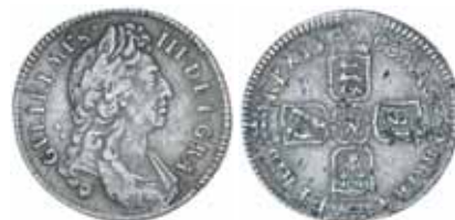
3177 William III , silver shilling, 1696, first bust (S.3497). Nearly very fine. $100

Ex I.S.Wright, Melbourne, October 1985 and the Cornwall Collection.