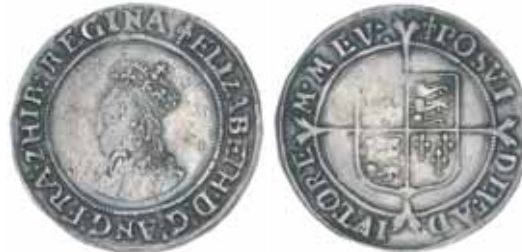
3132* Elizabeth I , (1558-1603), first issue, 1559-60, silver shilling, mint mark lis, bust 2B (S.2549). Toned, dent and weak areas, otherwise very fine. $500