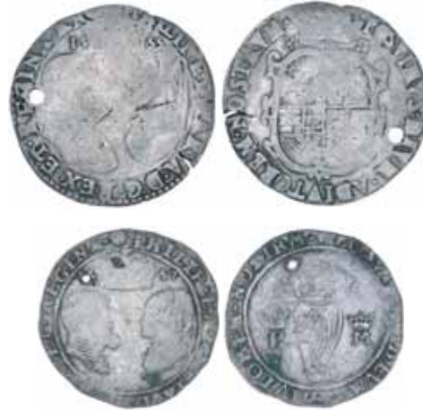
3131* Philip and Mary , (1554-1558), silver shilling, 1555, English titles only (S.2501); Ireland, groat, 1557, mint mark rose (S.6501B). Both pierced, otherwise fair and fine. (2) $200