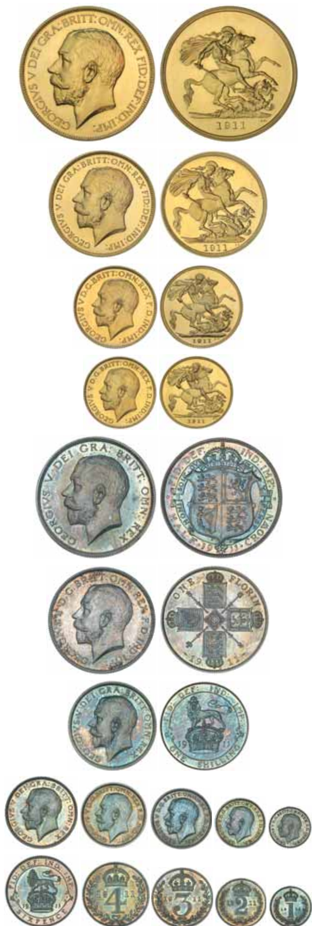
3080* George V , proof set, five pounds to maundy penny, 1911 (S.PS11). In Royal Mint case of issue, FDC. (12 coins) $7,000