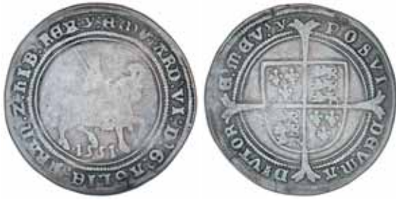
3126* Edward VI , (1547-1553), fine silver coinage, 1551-3, silver halfcrown, 1551, mint mark Y (S.2479). Very good. $300