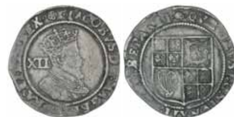
3141* James I , (1603-1625), second coinage, 1604-19, silver shilling, fourth bust, mint mark rose, 1605-6 (S.2655). Even tone, fine.