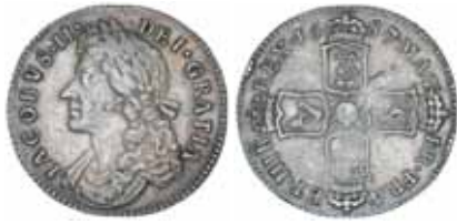
3168* James II , silver shilling, 1687/6 (S.3410). Nearly very fine. $700