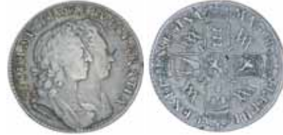
3174* William and Mary , silver shilling, 1693 (S.3437). Very good, evenly worn, light tone. $300