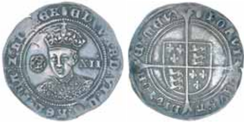
3127* Edward VI , (1547-1553), fine silver coinage, 1551-3, silver shilling, mint mark tun (S.2482). Attractive dark tone, some weaknesses but good portrait, good very fine. $600