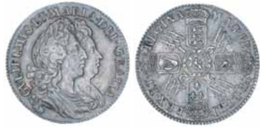
3173* William and Mary , silver halfcrown, second busts, 1692 Quarto (S.3436). Toned very fine/good very fine. $750