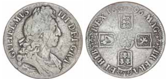
3176* William III , silver crown, 1696, first bust, edge dated Octavo, type A, first harp, 7 strings in harp, no stops on reverse, normal edge, (S.3470, var. ESC 89C, var. English Milled Coinage 366). Very good and apparently an unpublished variety. $250

Ex I.S.Wright, Melbourne, October 1985 and the Cornwall Collection.