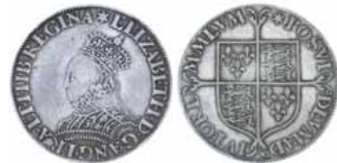
3138* Elizabeth I , (1558-1603), milled coinage, silver shilling, mm star, intermediate size (S.2591). Has been tooled and edges raised (from being in a mount), otherwise good fine.