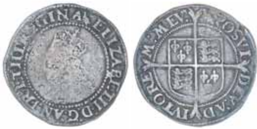
3134* Elizabeth I , (1558-1603), second issue, 1560-1, silver shilling, mint mark martlett (S.2555). Toned, flat portrait, otherwise good fine.