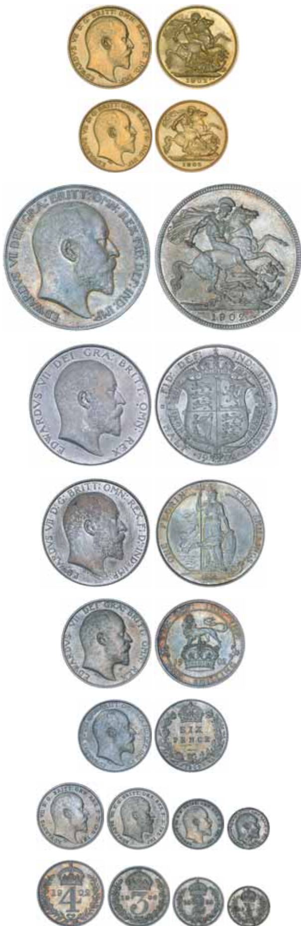
3079* Edward VII , matt proof set, sovereign to maundy penny, 1902 (S.PS10). In case of issue, toned, nearly FDC. (11) $1,250