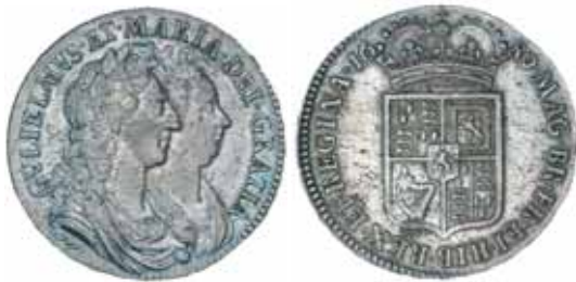
3171* William and Mary , silver halfcrown, 1689, second reverse (S.3435) no frosting and no pearls. Glossy grey blue toned extremely fine and rare thus. $750