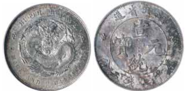
2394* China , Empire, Hupeh Province, Hsuan T'ung, silver dollar, undated (issued 1909-1911), obv. facing dragon (KM.Y.131). Some surface marks, toned, extremely fine.

Slabbed by PCGS as genuine not gradable.