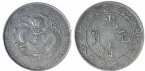
2396* China , Empire, Kiangnan Province, silver dollar, dated 1904, rev. with initials HAH & CH, and dots, obv. facing dragon (KM.Y.145a.13). Graffiti initial and edge nick on reverse, toned, nearly extremely fine.