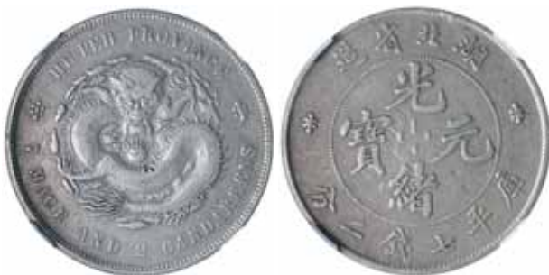
2393* China , Empire, Hupeh Province, silver dollar, undated (issued 1895-1907)(KM.Y.127.1). Chopmarks, otherwise very fine.

Slabbed by PCGS as genuine not gradable.