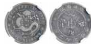
2397* China , Empire, Szechuan Province, silver ten cents, undated (1898-1908) (KM.Y.235, L&M 350). Lightly toned, good fine with minor scratches.

Slabbed by NGC as VF details chopmarked.