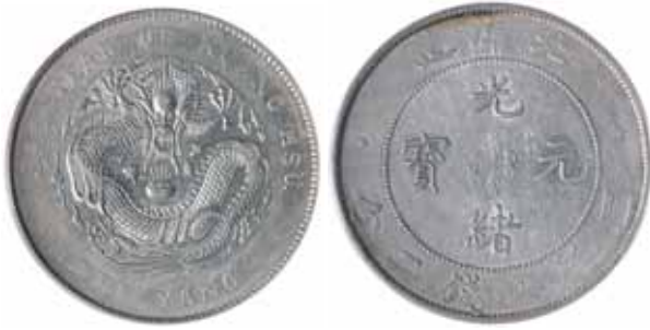
2390* China , Empire, Chihli Province, under Empire, silver dollar, Pei Yang type, cloud connected, year 34 (1908) (KM.Y.73.2). Good very fine.