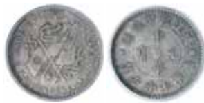
2391* China , Empire, Fukien Province, silver ten cents, 1912, (KM.Y.380). Lightly toned, fine.

Slabbed by PCGS as genuine not gradable.