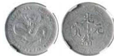
2395* China , Empire, Kiangnan Province, silver twenty cents, dated 1898, (KM.Y.143A.1, L&M 220). Cleaned, hairlines, very fine.