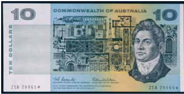
3134* Ten dollars , Coombs/Wilson (1966) ZSA 29965* (R.301S) first prefix star note. Flat, good very fine.