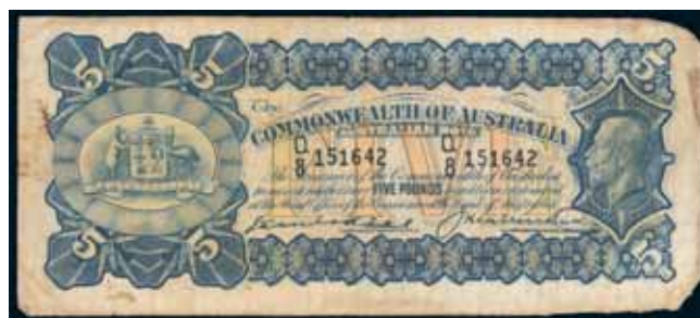
3035* Five pounds , Kell/Heathershaw (1927) Q/8 151642 (R.40). Right corners off, otherwise nearly fine. $1,000