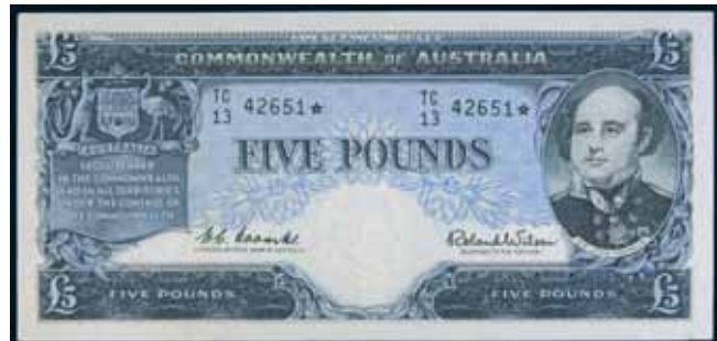
3115* Five pounds , Coombs/Wilson (1960) TC/13 42651* (R.50s). Flattened, otherwise very fine. $2,000