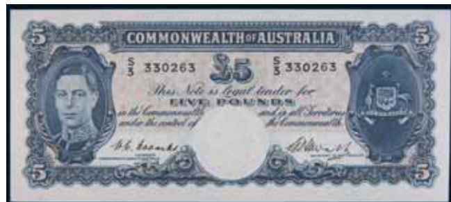
3048* Five pounds , Coombs/Watt (1949) S/3 330263 (R.47). Flattened, nearly uncirculated. $400