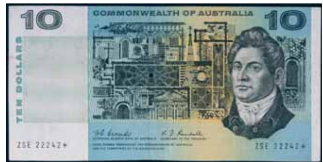
3141* Ten dollars , Coombs/Randall (1967) ZSE 22242* (R.302s). Original, good fine.