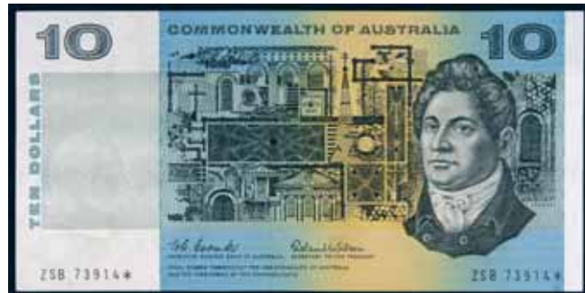
3133* Ten dollars , Coombs/Wilson (1966) ZSB 73914* (R.301s). Extremely fine or better. $1,200