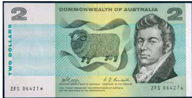
3131* Two dollars , Phillips/Randall (1968) ZFS 06427* (R.83s) last serial prefix star note. Slight creasing, natural paper, body good, very fine. $1,500