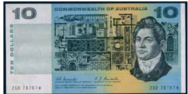
3140* Ten dollars , Coombs/Randall (1967) ZSD 78707* (R.302s). Flattened, very fine or better and rare.