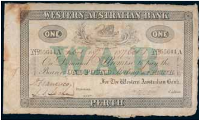
2897* Western Australian Bank , one pound, No 55644A, 1 Oct 1877, Perth, imprint Charles Skipper & East, London (MVR type 3 b). Nearly very fine and very rare.