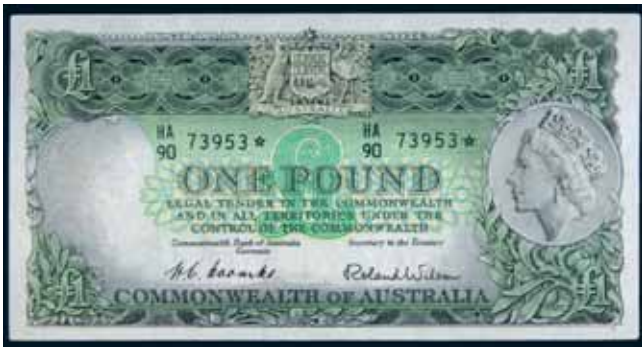
3110* One pound , Coombs/Wilson (1953) HA/90 73953* (R.33s). Very fine. $1,500