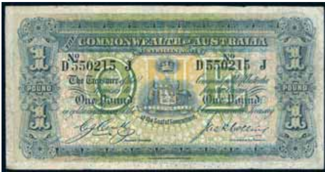
2967* One pound , Cerutti/Collins (1918) D 550215 J (R.21). Heavy vertical folds, otherwise good fine.