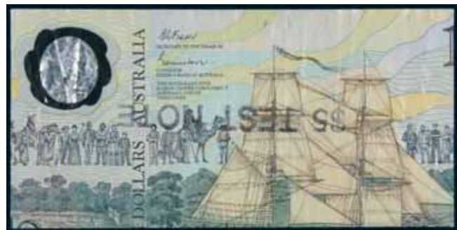
3193* Five dollars test note , on a Johnston/Fraser ten dollars 1988 commemorative, partial number 7 611673, cut to the size of a polymer five dollars, and overprinted '$5 TEST NOTE' on both sides, possibly an unofficial issue produced c1991 for testing vending machines. Pin holes, fine.