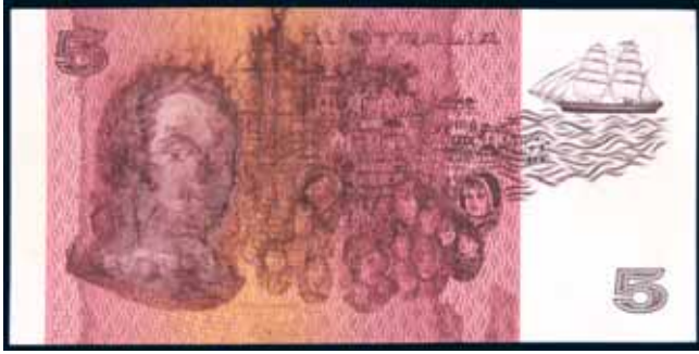
3181* Five dollars , Johnston/Fraser (1985) PQH 875287, a major purple ink spillage on the back (R.209a). Nearly uncirculated.