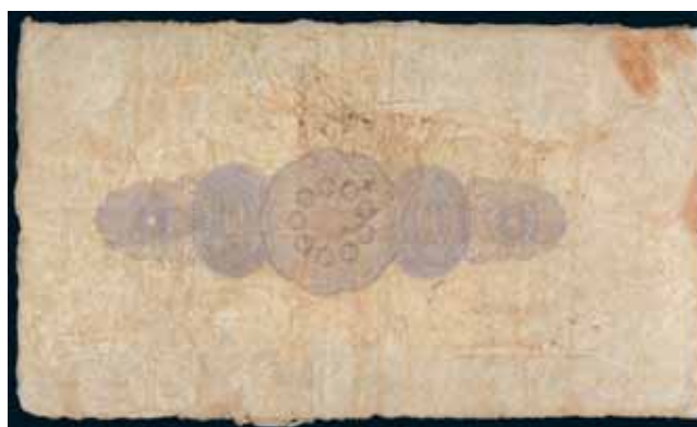
lot 2897 (back)