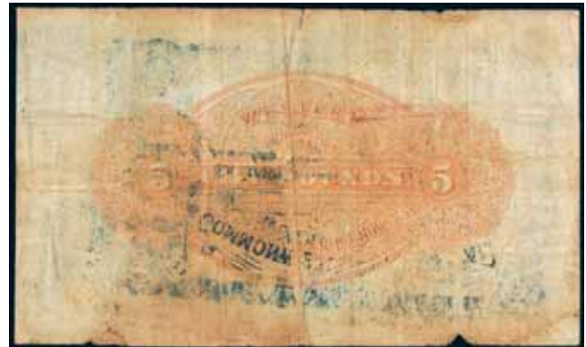
2899* Western Australian Bank , five pounds, no A/122080 1st June 1905, Perth, imprint Bradbury, Wilkinson & Co., Engravers & C London (MVR type 3c). Remains of Commonwealth Bank stamp on back, some water staining, edge breaks, otherwise full, very good and very rare.