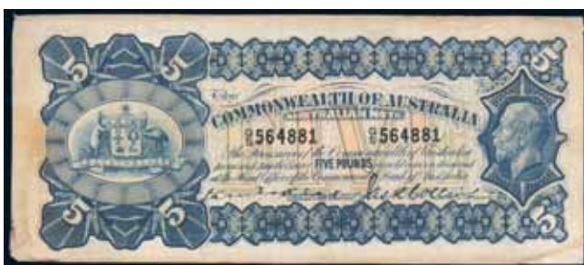
3032* Five pounds , Kell/Collins (1924) Q/5 564881 (R.38b) blue signatures. Lower left corner moisture damaged, otherwise good fine. $1,000