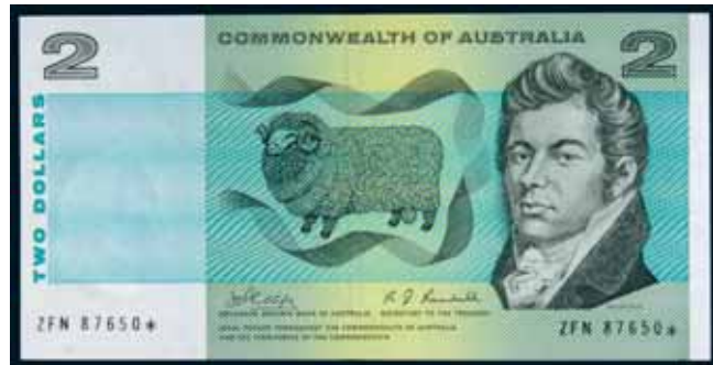
3130* Two dollars , Phillips/Randall (1968) ZFN 87650* (R.83s). Crisp, extremely fine. $1,200