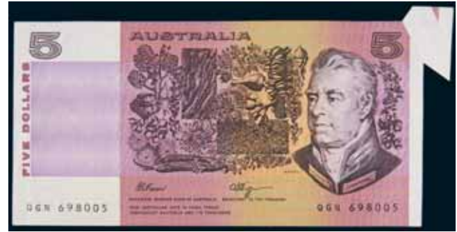
3185* Five dollars , Fraser/Higgins (1990) QGN 698005, top right 'dog ear' corner paper flap (R.212). Very fine.