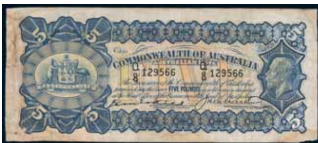
3033* Five pounds , Kell/Heathershaw (1927) Q/8 129566 (R.39). Left edge frayed with tears, otherwise fine. $800