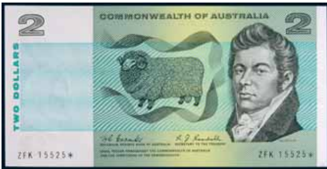
3128* Two dollars , Coombs/Randall (1967) ZFK 15525* (R.82s) last serial prefix star note. Flat, virtually uncirculated and rare. $5,000