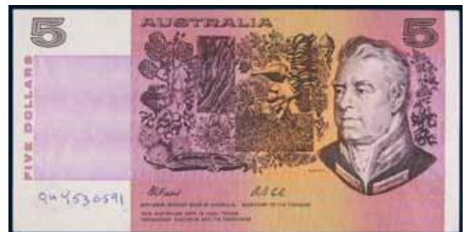
3187* Five dollars , Fraser/Cole (1991) missing both printed prefixes and serial numbers, hand written number QHY 536591 at bottom left (R.213). Many creases, otherwise very fine and rare.

A same numbered note from the same sheet, with prefix QGF was sold in Noble Numismatics Sale 52 (lot 3181).