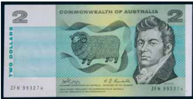
3129* Two dollars , Phillips/Randall (1968) ZFN 99327* (R.83s). Good extremely fine and scarce. $1,200