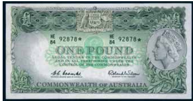
3113* One pound , Coombs/Wilson (1961) HE/84 92878* (R.34bs). Flattened of centre fold, tiny creases, otherwise good extremely fine/extremely fine and rare in this condition. $4,500 Ex David Hope Collection.