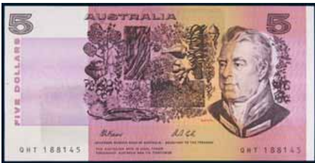
3189* Five dollars , Fraser/Cole (1991) QHT 188145, a 5mm registration shift of the intaglio print to the right on the front (R.213). Slight staining from label removal, otherwise uncirculated.