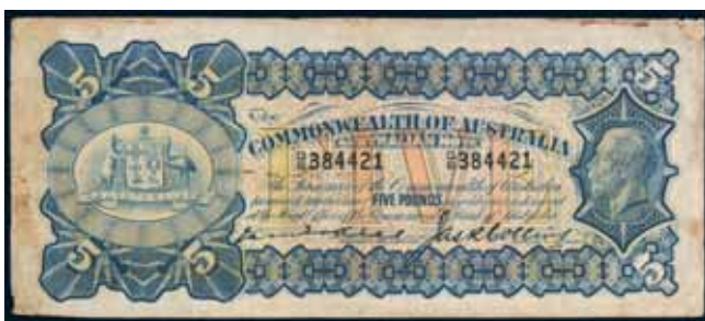
3030* Five pounds , Kell/Collins (1924) Q/6 384421 (R.38b). Water stained edges, otherwise good fine. $1,100