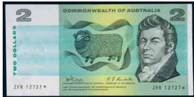
3132* Two dollars , Phillips/Randall (1968) ZFR 12727* (R.83s). Flattened, otherwise good very fine. $500