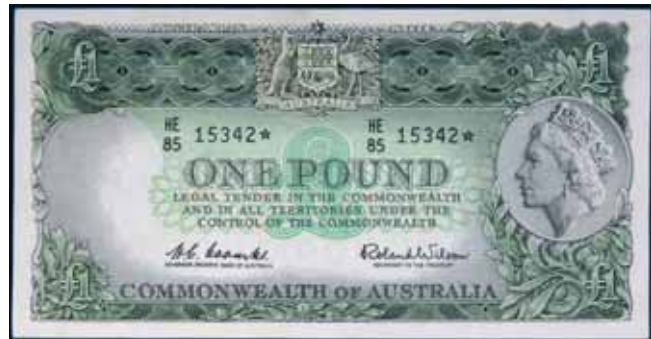
3114* One pound , Coombs/Wilson (1961) HE/85 15342* (R.34bs). Good very fine. $2,200