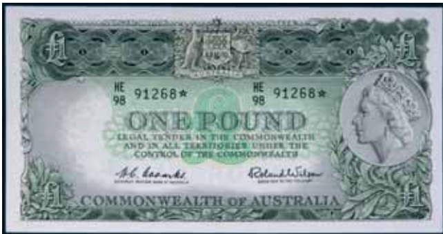
3112* One pound , Coombs/Wilson (1961) HE/98 91268* (R.34as). Extremely fine and rare in this condition. $3,500