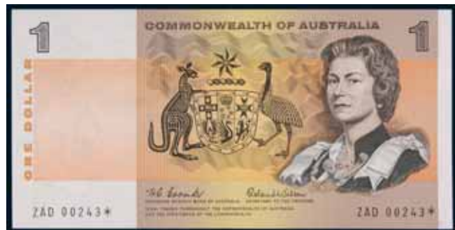
3116* One dollar , Coombs/Wilson (1966) ZAD 00243* (R.71s) low serial number. Nearly uncirculated. $3,000