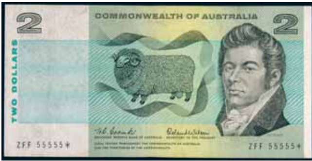
3127* Two dollars , Coombs/Wilson (1966) ZFF 55555* (R.81s) solid number star note. Nearly fine and rare as such. $500