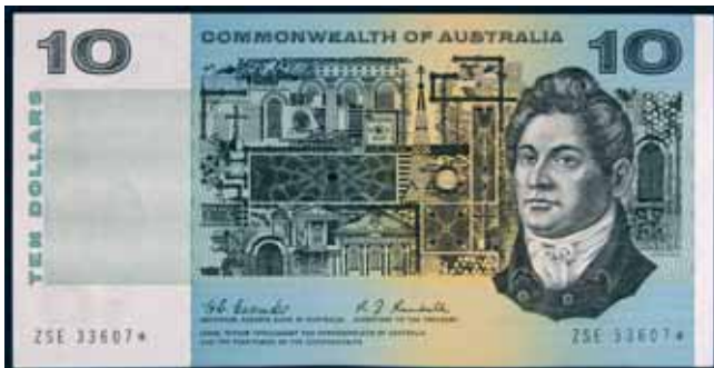
3137* Ten dollars , Coombs/Randall (1967) ZSE 33607* (R.302s) last serial prefix star note. Flat, virtually uncirculated and very rare in this condition.