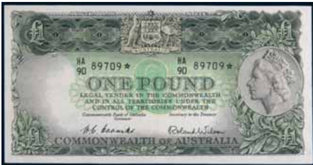
3111* One pound , Coombs/Wilson (1953) HA/90 89709* (R.33s). Limp, cleaned otherwise fine. $750