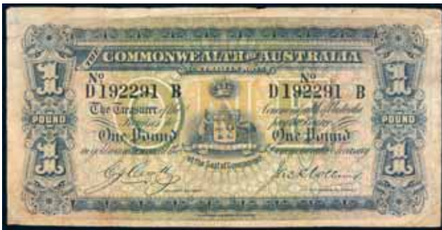
2968* One pound , Cerutti/Collins (1918) D 192291 B (R.21) very rare early radar number. A full note, folds and creases, nearly fine and rare as such.