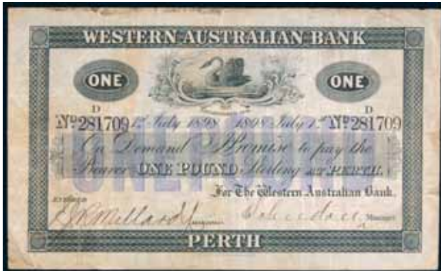
2898* Western Australian Bank , one pound, No D/281709 1st July 1898, Perth, imprint Bradbury Wilkinson & Co., engravers & C London (MVR type 3c). Heavier paper; somewhat dirty on back, otherwise very fine and rare.