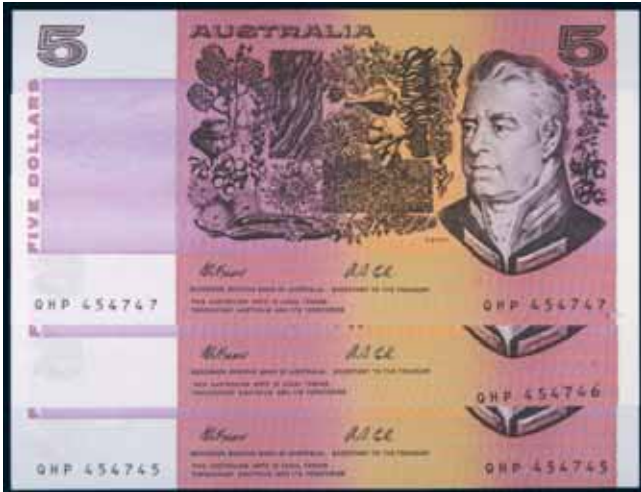
3188* Five dollars , Fraser/Cole (1991) QHP 454745/7 consecutive trio, the middle note missing the left hand serial number (R.213). Uncirculated. (3)