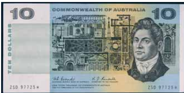
3138* Ten dollars , Coombs/Randall (1967) ZSD 97725* (R.302s). Flattened, otherwise very fine and rare.