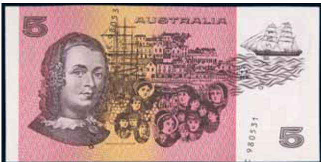
3184* Five dollars , Fraser/Higgins (1990) QFK/L/C/3 980531, missing prefix and serial numbers on front, various combinations of prefixes stamped vertically on back in four places (R.212). Uncirculated and rare.