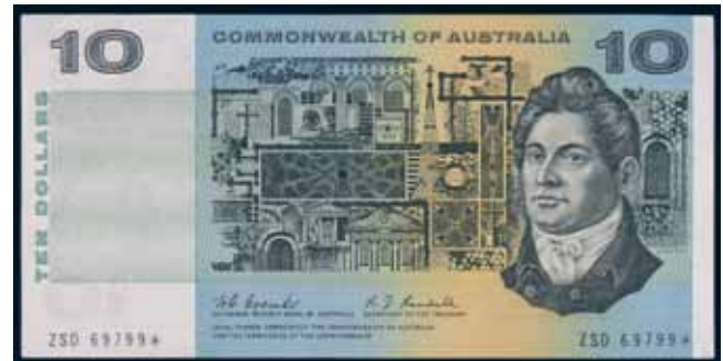
3139* Ten dollars , Coombs/Randall (1967) ZSD 69799* (R.302s). Good very fine.