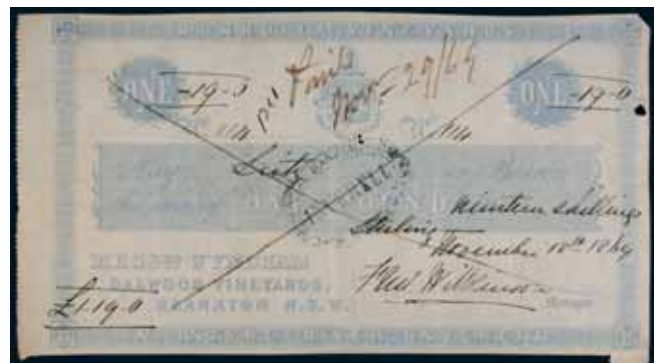
2900* Bukkulla Vineyards , McIntyre River, Inverell, one pound, No 114 November 18th 1869, converted by hand to one pound nineteen shillings Commercial Banking Company of Sydney, Inverell hand stamp in middle, crossed to cancel once paid Nov 29/69 (MVR type 1a). A full note, two holes, otherwise good very fine.