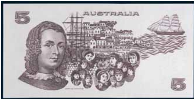
3186* Five dollars , Fraser/Higgins (1990) QDJ 028534, fade out of intaglio print on the back (R.212). Good extremely fine.