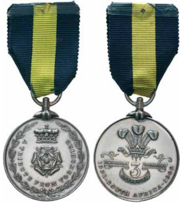
5490* Tribute Medal 1901-02 South Africa . 3 Yorkshire Imperial Yeomanry. 26180 Pte W.Mitchell. Renamed, impressed. Very fine. $100