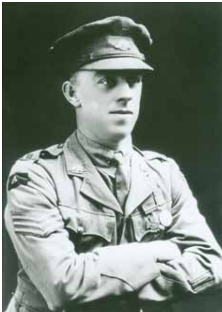
lot 5561 part

His action was witnessed not only by the whole of his Battalion but also by the Battalion occupying O.G.2. Apart from its great value tactically, his example had a great effect in inspiring other men and undoubtedly was greatly responsible for the enemy's being driven back immediately, though it was some time before they were driven out of the whole position.