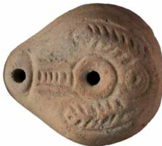
Lot 6820 next page