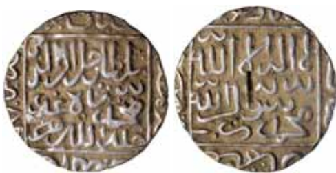
Lot 5781 part