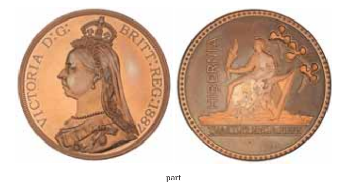
4846* Ireland, Queen Victoria, 1887-dated Patina series retro pattern/proof crown of 5 Shillings. Obverse: JE Boehm's Jubilee portrait of Queen left. Reverse: Hibernia seated with shamrocks. Edge plain. 30 pieces struck in Golden alloy, 30 pieces struck in copper, 30 pieces struck in polished cupronickel. Uncirculated. (90 pcs)

From total mintages 250 pieces of each metal.