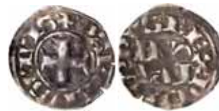
2636* France , Philip VI, (1328-1350), silver denier Tournois, issued from 1329, obv. legend around, + PHILIPPVS REX, in centre FRA/ODN. rev. cross, around PARISIVS CIVIS, (C.246, L.276, Dup.273A, Roberts 2572). Very fine.