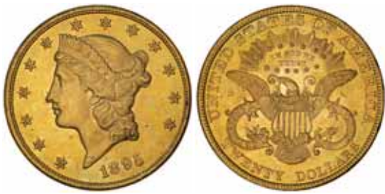
2450* U.S.A. , twenty dollars or double eagle, 1895 Liberty head. Considerable mint bloom, red nearly uncirculated. $1,000