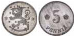
2632* Finland , five pennia, 1918, (KMTS6). Trial strike in iron, full mint bloom, uncirculated and extremely rare.