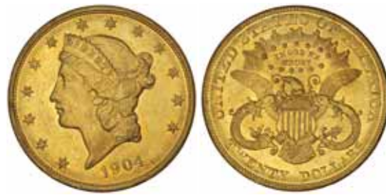
2455* U.S.A. , twenty dollars or double eagle, 1904, Liberty head. Nearly uncirculated. $1,000