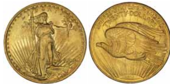
2460* U.S.A. , twenty dollars or double eagle, 1908, St. Gaudens, no motto. Uncirculated. $1,000