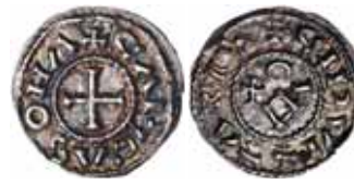
2634* France , Carolingian Issue of Odo (Eudes), (887-898), silver denier, Carcassonne mint, with Odo name in centre, obv. cross legend around, + CARCASOMA, rev. ODOX in centre, around CIPVI+TATIS, (Roberts 1683). Extremely fine.

Only 250 struck in copper, normal issue was in iron. From an old collection of Finnish coins as is the trial strike 1918 5 pennia in iron in the previous lot.