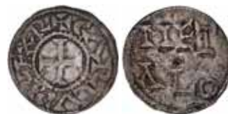
2637* France , Early Feudal, Melle, silver denier, 11-13th century, obv.+CARLVS REX R around central cross, rev. in two lines MET/ALO, (Roberts 3862, Poey D'Avant 2457, [Pl.54, 1]). Fine and scarce.