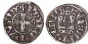
2635* France , Philip IV, (1285-1314), silver denier Tournois, issued from 1307-1310, obv. cross legend around, + PHILIPPVS REX, rev. Chatel Tournois, around TVRONVS CIVIS, star stops, (C.248, L.-, Dup.223A, Roberts 2417). Fine - very fine.