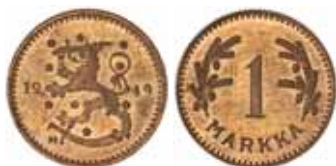
2633* Finland , markka, 1949 H (KM30a). Attractive full mint red, choice uncirculated and extremely rare.