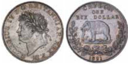
2548* Ceylon , George IV, silver rix dollar, 1821, edge plain (Pr.82; KM.84). Attractive deep grey tone, good very fine.