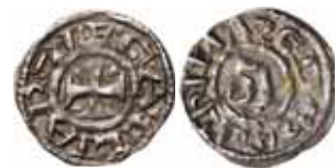
2638* France , Lyon, Archbishopric of Lyon, silver denier, issued 11th century A.D., obv. cross, around, GALLIA R-V; rev. Ld monogram in centre around PRIMAS EDWS, (Roberts 3984, Poey d'Avant Pl.113, 10). Very fine, scarce.