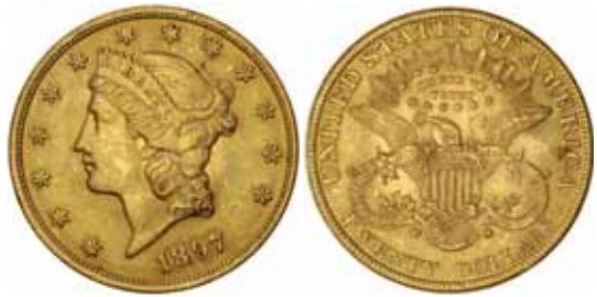
2453* U.S.A. , twenty dollars or double eagle, 1897, Liberty head. Subdued mint bloom, nearly uncirculated. $1,000