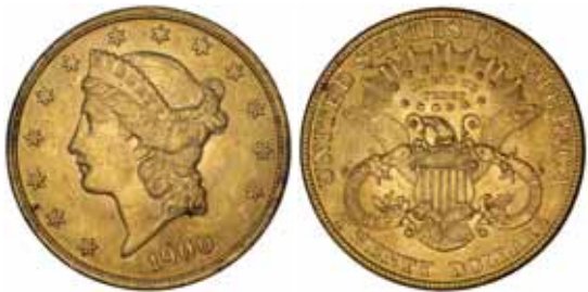
2454* U.S.A. , twenty dollars or double eagle 1900, Liberty head. Good extremely fine. $1,000