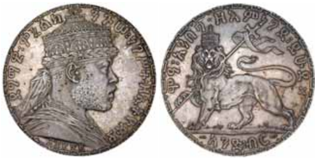
2631* Ethiopia , Menelik II, silver birr, EE 1892 (1899), (KM.19). Toned, extremely fine.