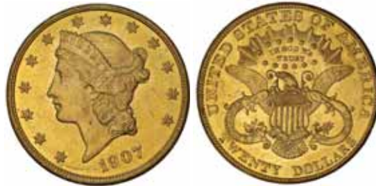
2459* U.S.A. , twenty dollars or double eagle, 1907, Liberty head. Surface marks on obverse otherwise considerable brilliance, nearly uncirculated/uncirculated. $1,000