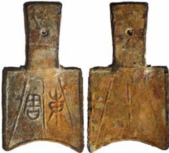
2549* China , Zhou (Chou) Dynasty, Middle to late period, "Wu" military series, small hollow handle spade, or sloping shoulder spade (c.400-300 B.C.), two characters "Tung Chow" money, length 67mm, (28.49 grams), (Hartill 2.164, TFP 8). Dirt encrustation, otherwise very fine and scarce.