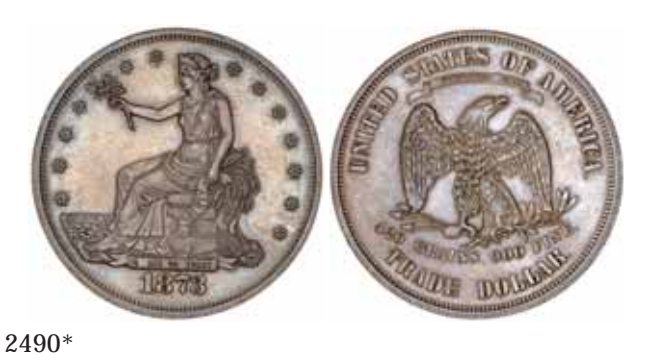
U.S.A., Trade dollar, 1873 (KM.108). Blue-grey toned, uncirculated.

U.S.A. , seated Liberty silver dollar, 1863 (KM.71). Blue and gold toning, hairline scratch on reverse, fine and scarce. $400