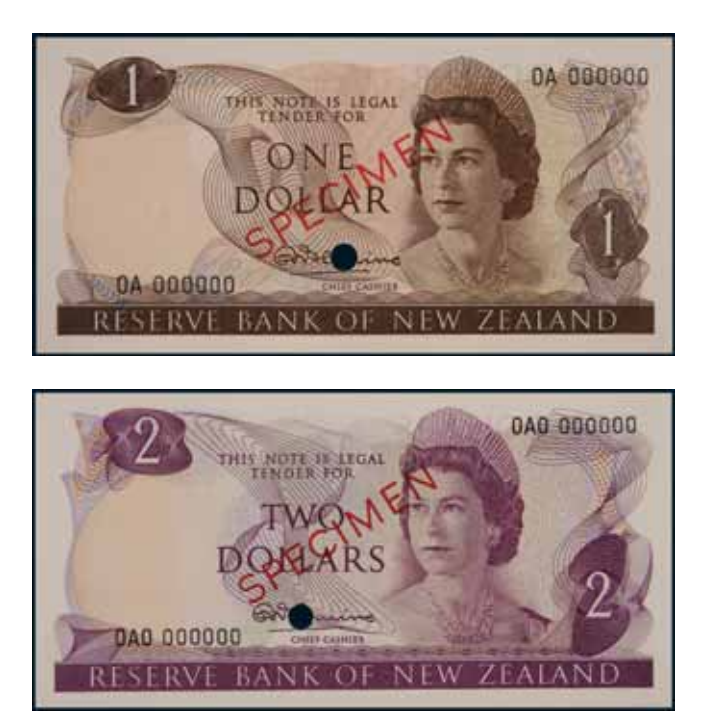
lot 2631 part

Scott de Young states that he has previously only recorded 10 notes of this circulating serial type. The Reserve Bank of New Zealand sold out the remainders of the Fleming fifty pounds from the late sixties through to the seventies and these were all numbered R199001 and above.