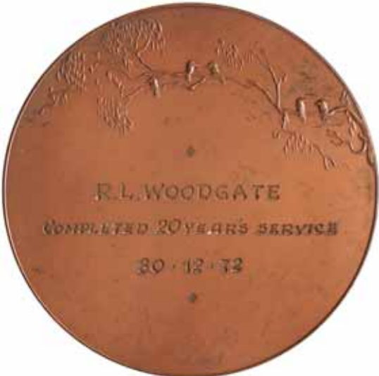
lot 748 part