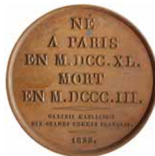
635* Francois de la Harpe , 1822, in bronze (41mm) by Petit. Extremely fine.