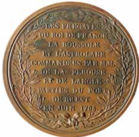
623* France , La Perouse's Exploring Expedition, 1785, in bronze (60mm) by R.Duvivier (MH 170). Nearly extremely fine and very rare.