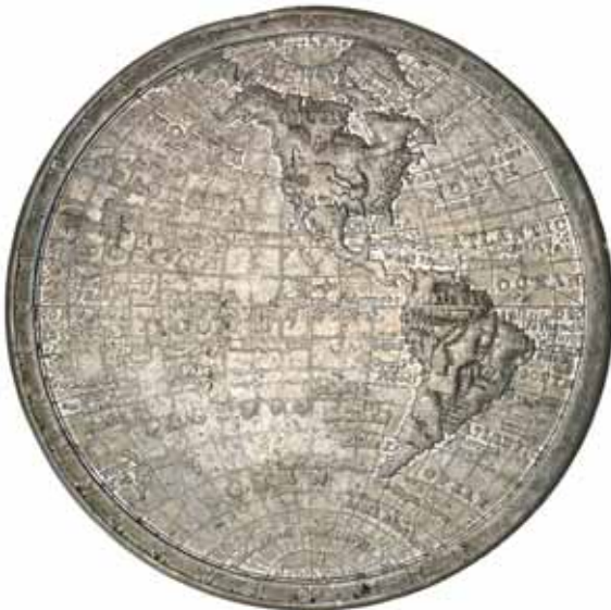
632* World Globe Medal , c.1815, in white metal (74mm), unsigned, attributed to Birmingham England, possibly by Sir Edward Thomason (Rulau.9; Eimer.1135). Edge bump, otherwise good fine and rare.