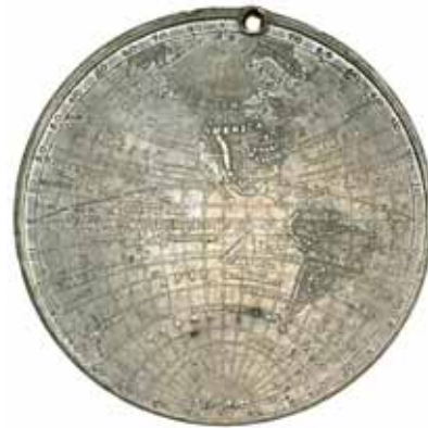
633* Map of the World , c1820, in white metal (51mm), obverse, detailed map of the Eastern Hemisphere, Continents of Africa, Asia, Europe and New Holland together with countries and islands, reverse, detailed map of Western Hemisphere, continents of North America and South America identified together with countries and islands (Eimer 1139). Pierced at top (3mm) otherwise very fine.