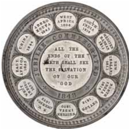
654* Great Britain, Church Missionary Society, Golden Jubilee 1848 , in white metal (58mm) by B. Wyon (Eimer.1422; BHM.2310). Extremely fine.