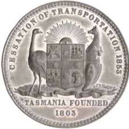
659* Cessation of Transportation , 1853, in white metal (58mm) by the Royal Mint (C.1853/2). Nearly extremely fine/extremely fine.