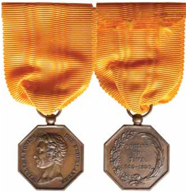
642* Netherlands East Indies, Java War (1825-30) , in bronze (octagonal, 29mm), with ring top suspension and ribbon. Extremely fine.