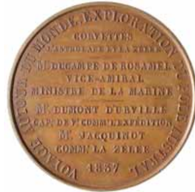
644* D'Urville, Dumont, cruise of Astrolabe and La Zelee 1837 , in bronze (50mm) by Barre (M.H.-). Attractive medium brown patina, uncirculated.