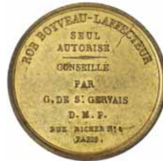
645* France, Boyveau-Laffeteur, 1841 , bronze (gilt, 41mm), by Montagny. Extremely fine.