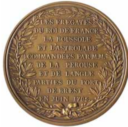
624* France , La Perouse's Exploring Expedition, 1785, bronze reverse restrike (60mm x 3mm, 54gms) by R.Duvivier (MH 170), obv. two reverse "S"s with continuing border of 8 raised dots. Nearly extremely fine and very rare.