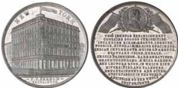
665* U.S.A. , P.T. Barnum's American Museum, New York 1862, in white metal (38mm). Nearly uncirculated.