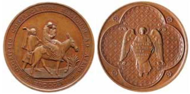
662* Africa , Congregational Meeting 1856, in bronze (40mm), obverse: Joseph, Mary and the baby Jesus on a donkey and "Adscriptio Congregationai Missionvm Ad Afros - MDCCCLVI", reverse: angel holding a shield and "Mittam Ex In Eis Africam". Extremely fine.

Ex L.R. Smith Collection, Noble Numismatics Sale 80 (lot 610, part).