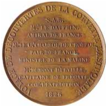
643* D'Urville, Dumont, Voyages of the Astrolable, 1826 , in bronze (50mm) by Depaulis (M.H.190). Attractive red brown patina, nearly uncirculated.