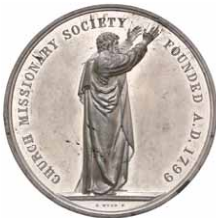
655* Great Britain, Church Missionary Society, Golden Jubilee 1848 , in bronze (58mm) by B. Wyon (Eimer.1422; BHM.2310). Extremely fine.