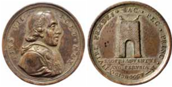
631* Pope Pius VII , at Perouse 1805, in bronze (38mm). Has been silvered at some time, very fine and rare.