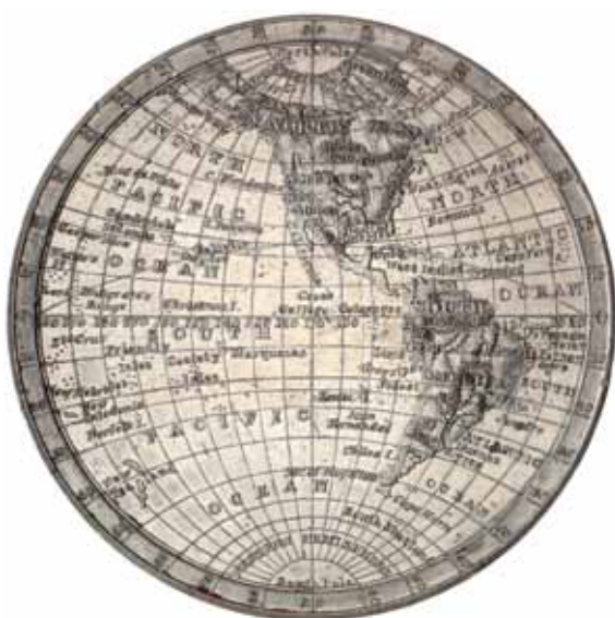
634* Map of the World , c1820, in white metal (74mm), obverse, detailed map of the Eastern Hemisphere, continents of Africa, Asia, Europe and New Holland together with countries and islands, reverse, detailed map of Western Hemisphere, continents of North America and South America identified, together with countries and islands (Eimer 1139). Good extremely fine.