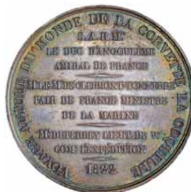
636* Voyage of the Coquille around the world , under command of Lieutenant Commander Duperney, 1822, in silver (50mm) by Andrieu (MH 189). Toned, nearly extremely fine.