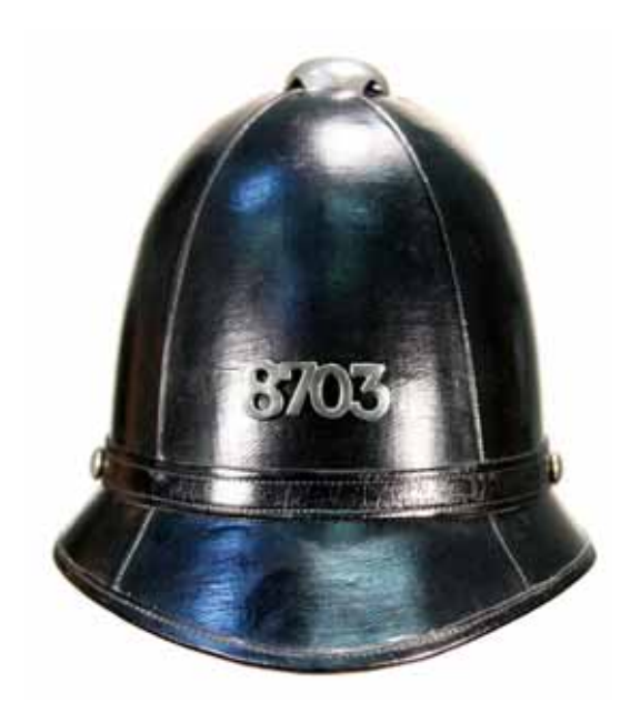
4541* Victoria Police , leather helmet, c1930, with No.8703. Chin strap damaged, otherwise very fine.