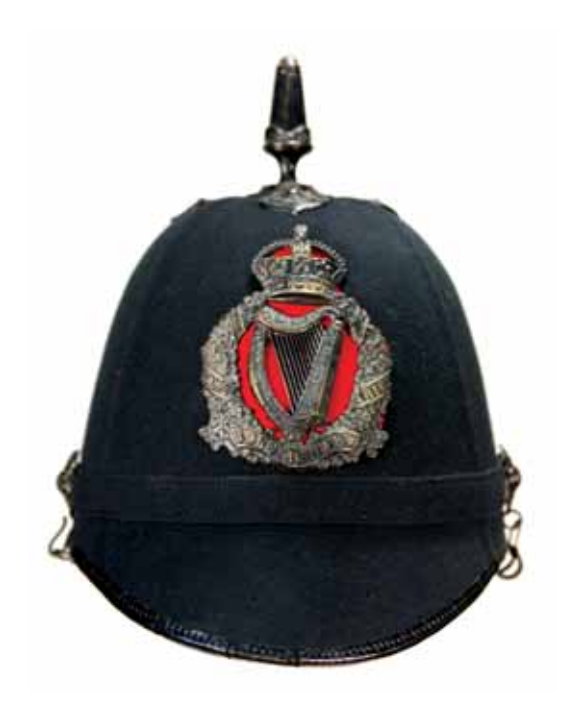
4547* Royal Irish Constabulary, c1905, Police Officer's helmet with helmet plate, together with metal case. Good very fine. $2,250