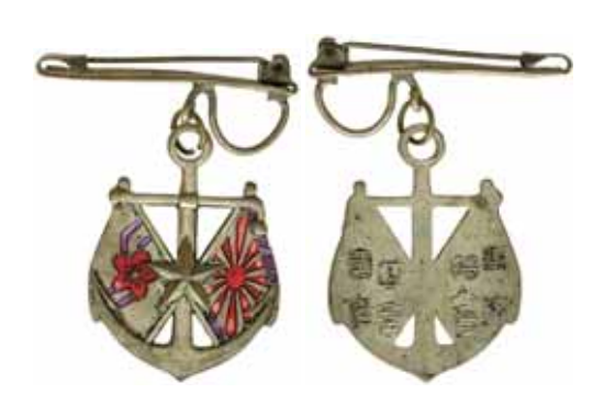
4462^{\ast} Japan , Imperial Navy Ladies Society, WWII, member's badge in silver and enamel. In case of issue, good very fine and rare.