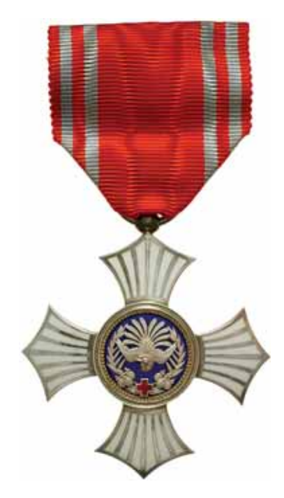
4458* Japan , Red Cross Society Silver Order of Merit Decoration, with lapel rosette in form of a cross. In case of issue, uncirculated.