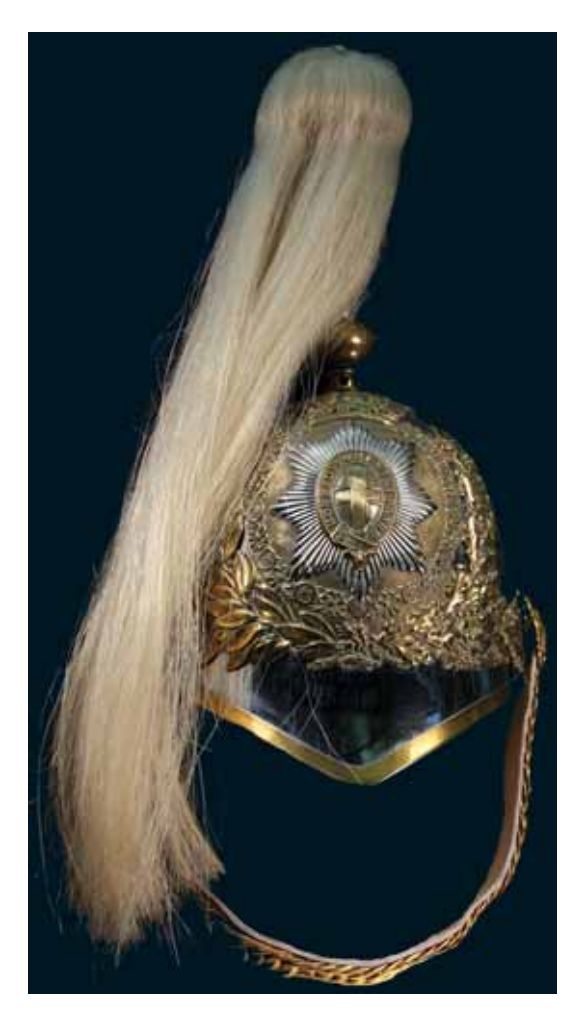
4543* Great Britain , Lifeguards, K.G. crown, parade helmet with chinstrap. Extremely fine . $1,750