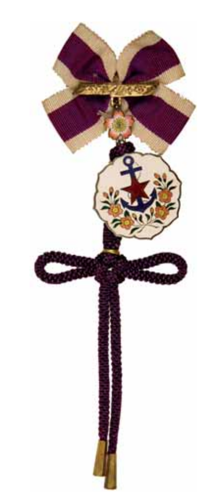
4460* Japan, Patriotic Women's Association, Decoration for Exceptional Zeal. In case of issue, uncirculated and rare. $250