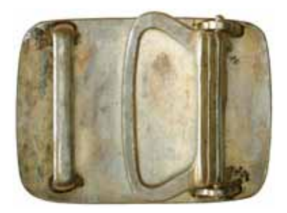
4531* Japan, silver belt buckle, dragon design, 1939. In timber case of issue, extremely fine. $120