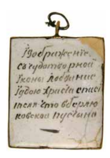
Lot 4635 part