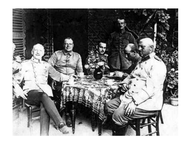
With German officers