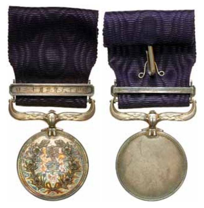
4459^{\ast} Japan, Violet Ribbon Merit Medal. In case of issue, extremely fine.