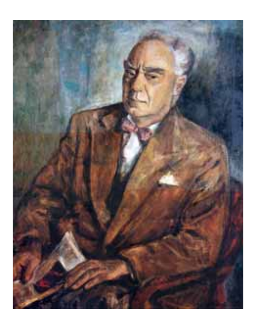
Archibald Prize entry Lot 4437 part