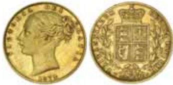
407* Queen Victoria , 1872/1 Melbourne. Toned, good very fine and rare thus. $750