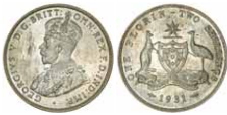
567* George V, 1931. Lightly toned full original mint bloom, choice uncirculated.