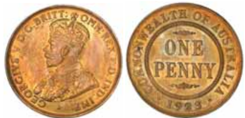
614* George V, 1923 London die. Peripheral hairline die breaks at top of reverse, full original mint red, toned in places, choice uncirculated and rare as such.