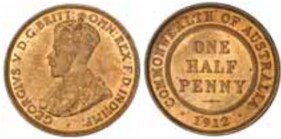
630* George V, 1912H. Full original mint red, light toning on obverse, choice uncirculated.