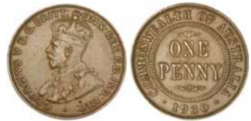
618* George V, 1930 Indian die. Dark brown original patina, very fine/good very fine and free of rim damage, very rare in this condition.