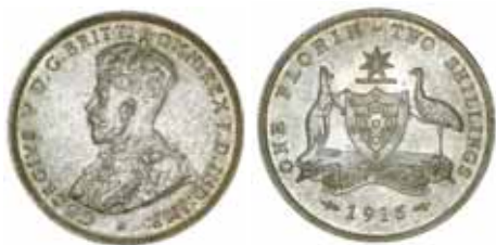
487* George V, 1915. Full original golden brown mint bloom, mottled toning on the obverse, minor contact marks otherwise choice uncirculated and very rare in this condition, one of the finest known.