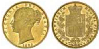
410* Queen Victoria , 1883 Melbourne. Good very fine. $750