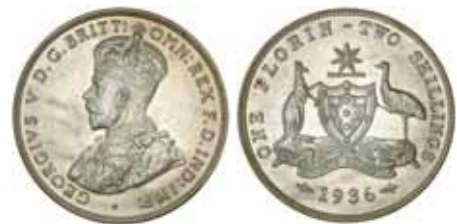
575* George V, 1936. Full original mint bloom, uncirculated/choice uncirculated.