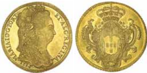
358* Brazil , Maria, six thousand four hundred reis or half Johanna, 1794 B (Bahia) (KM.226.2). Considerable original mint bloom, nearly uncirculated. $1,250