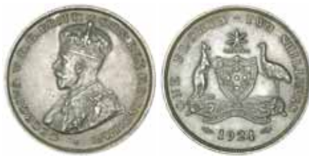
562* George V, 1924. Light dull matte finish, nearly uncirculated and unmarked. $2,500