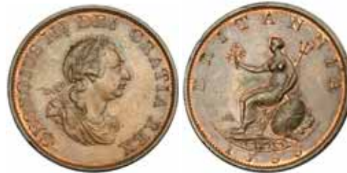
362* Great Britain , George III, copper penny, 1806 (S.3780). Nearly extremely fine. $100