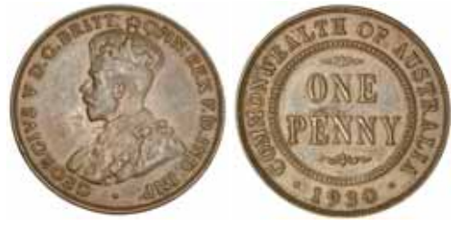
616* George V, 1930 Indian die. Two old scratches, otherwise glossy brown very fine and rare, especially in this condition.