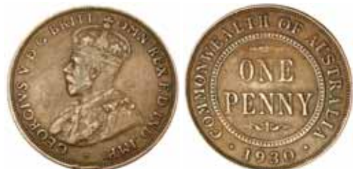
619* George V, 1930 Indian die. Two nicks on obverse rim at 6 o'clock otherwise dark toned fine/good fine and rare.

Ex Noble Numismatics Sale 68 (lot 1684).