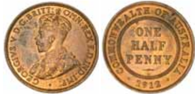
631* George V, 1912H. Red and brown, uncirculated.