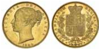
411* Queen Victoria , 1884 Melbourne. Obverse scuff marks, otherwise nearly uncirculated. $400