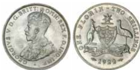
494* George V, 1922. Well struck, uncirculated and rare.