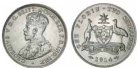
485* George V, 1914. Rubbed to clean, otherwise nearly uncirculated.