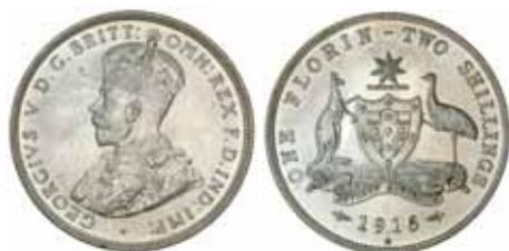
489* George V, 1916M. Full original mint bloom, choice uncirculated.