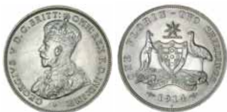
486* George V, 1914H. Full mint bloom, lightly wiped otherwise uncirculated and very rare in this condition.