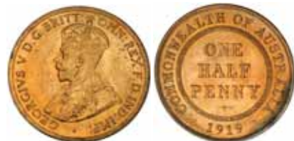
640* George V, 1919. Full original mint red, uncirculated. (2)