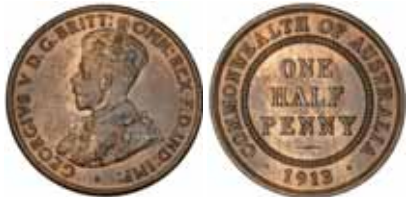
632* George V, 1913. Uneven brown and red, nearly uncirculated.