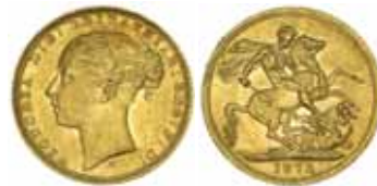
412* Queen Victoria , 1872 Melbourne. Extremely fine and rare. $1,500

Ex Douro Cargo 1996 with Monetarium certificate.