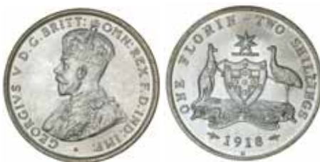
491* George V, 1918M. Full original mint bloom, gem uncirculated, one of the finest known.