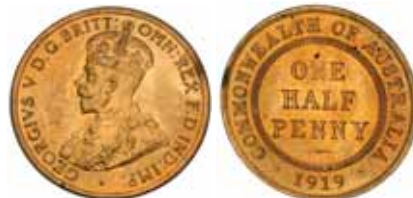
639* George V, 1919. Full original mint red, uncirculated.