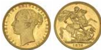
415* Queen Victoria , 1876 Melbourne. Choice uncirculated. $1,000

Ex Douro Cargo 1996 with Monetarium certificate.