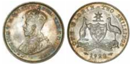
559* George V, 1922. Well struck for this date, attractive iridescent tone, nearly full original mint bloom, choice uncirculated and rare in this condition. $6,000