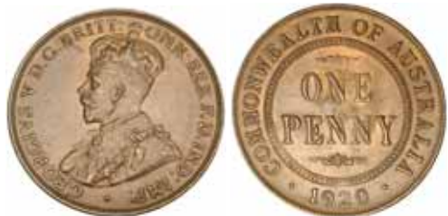
613* George V, 1920 dot below scroll, Indian die. Brown and red, nearly uncirculated and rare in this condition.