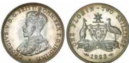
561* George V, 1923. Peripheral die breaks on the reverse, full brilliant mint bloom choice uncirculated, proof-like surface, nearly gem and rare in this condition. $7,000

Private purchase from Spink Australia in 1984.