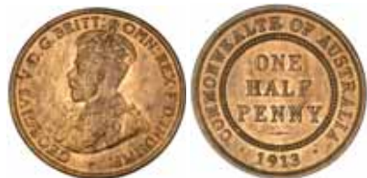
633* George V, 1913. Brown and red nearly uncirculated.