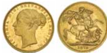
414* Queen Victoria , 1875 Melbourne. Nearly full mint bloom, frosty bloom on reverse, uncirculated and rare in this condition. $2,500