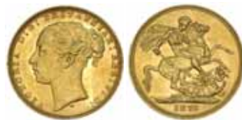
416* Queen Victoria , 1876 Melbourne. Die flash mark on obverse, uncirculated/choice uncirculated. $750

Ex Douro Cargo 1996 with Monetarium certificate.