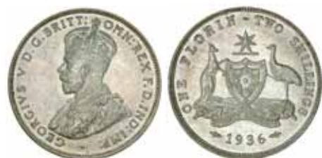
576* George V, 1936. Attractive lightly toned subdued mint bloom, choice uncirculated.