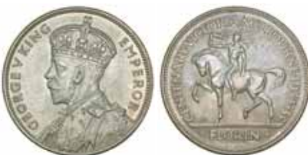
571* George V, 1934-35 Melbourne Centenary. Lightly toned, uncirculated.