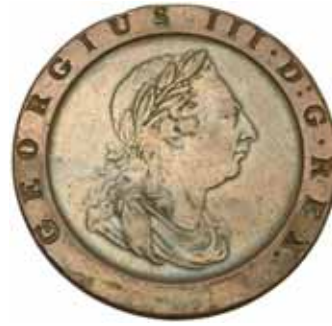
360* Great Britain , George III, cartwheel copper twopence, 1797 (S.3776). Relatively mark-free surfaces, good very fine. $300