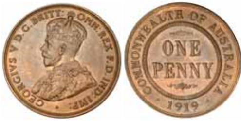
611* George V, 1919 dot below. Uncirculated.