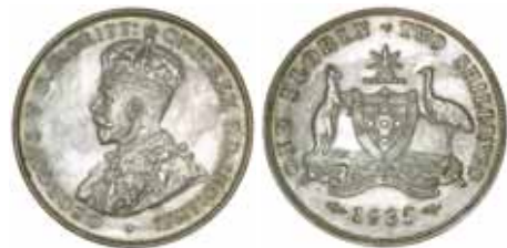
574* George V, 1935. Subdued original mint bloom light toning, two minute contact marks on the obverse otherwise uncirculated.