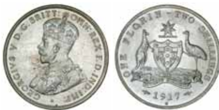
490* George V, 1917M. Full original mint bloom, uncirculated/choice uncirculated.