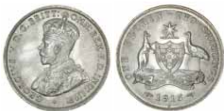
488* George V, 1915H. Full original satin-like mint bloom, choice uncirculated and rare in this condition, one of the finest known.