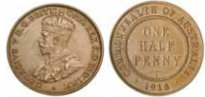
638* George V, 1918I. Even brown, nearly extremely fine and rare in this condition.