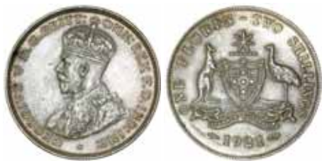
558* George V, 1921. Subdued original mint bloom, light grey toned, nearly uncirculated and rare in this condition. $1,500