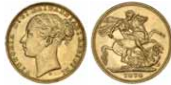
413* Queen Victoria , 1874 Sydney. Cleaned and lightly rubbed otherwise good extremely fine. $600

Ex Douro Cargo 1996 with Monetarium certificate.