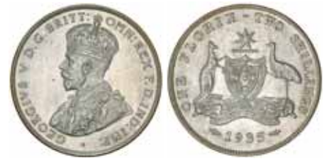
573* George V, 1935. Subdued full mint bloom, lightly toned on reverse, uncirculated.

Private purchase from Spink Australia in 1984.