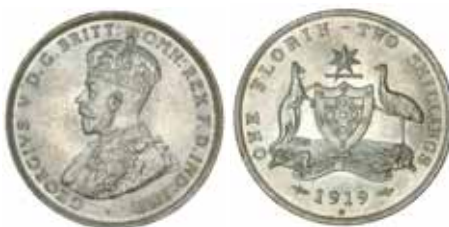
492* George V, 1919M. Lightly toned full original mint bloom, choice uncirculated and rare in this condition.