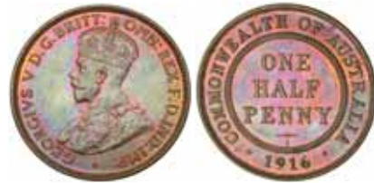
636* George V, 1916I. Attractive crimson red iridescence, choice uncirculated.