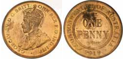
612* George V, 1919 dot below scroll, London die. Black carbon area on reverse otherwise full original mint red, uncirculated.