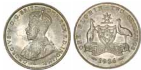
563* George V, 1926. Small graze on portrait otherwise full original mint bloom, uncirculated and rare in this condition. $2,500