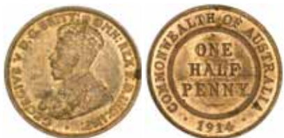
635* George V, 1914. Obverse toned, reverse nearly full original mint red, nearly uncirculated / uncirculated.