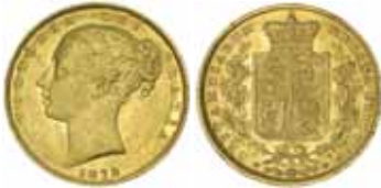
408* Queen Victoria , 1872 Melbourne. Peripheral obverse die breaks and die break rim through O to nose, nearly uncirculated and rare in this state. $600