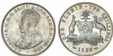
560* George V, 1922. Considerable mint bloom, obverse with orange peel effect from rusty or deteriorated die, virtually uncirculated and rare in this condition. $4,500