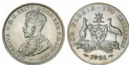
493* George V, 1921. Rubbed to clean otherwise uncirculated and rare.