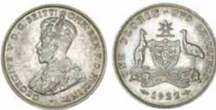
569* George V, 1932. Nearly extremely fine/extremely fine and rare in this condition.