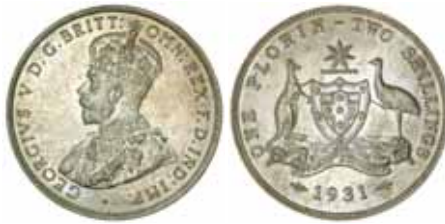
568* George V, 1931. Full original mint bloom choice uncirculated.