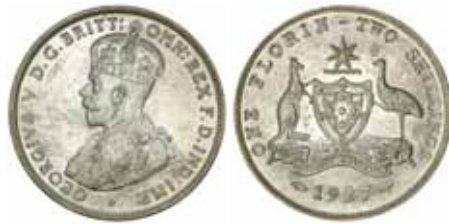
564* George V, 1927. Considerable original mint bloom, uncirculated. $800

Private purchase from Spink Australia in 1984.