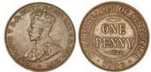
617* George V, 1930 Indian die. Minute rim bruises, toned nearly very fine and rare.