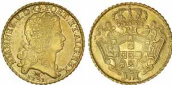
357* Brazil , John V, twelve thousand eight hundred reis or Johanna, 1731M, (KM.139). Very fine or better. $8,500