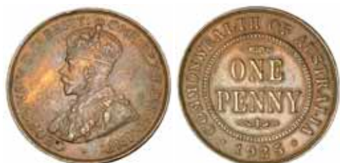
615* George V, 1925. Lightly cleaned otherwise good very fine.