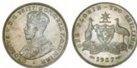
565* George V, 1927. Lightly toned with subdued original mint bloom, uncirculated. $750