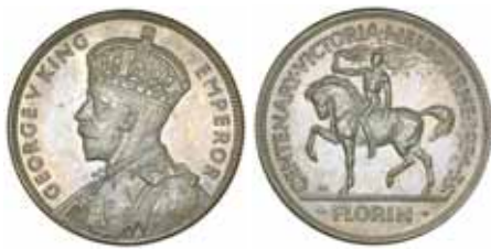
570* George V, 1934-35 Melbourne Centenary. Light grey toned, choice uncirculated.