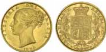
409* Queen Victoria , 1880 Sydney. Lightly toned, relatively unmarked fields, uncirculated. $600