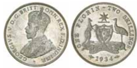
572 George V, 1934. Full original but dusty mint bloom, uncirculated/choice uncirculated.

Private purchase from Spink Australia in 1984.