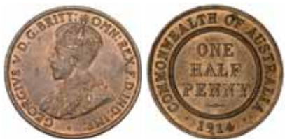
634* George V, 1914. Considerable original mint red, uncirculated and rare in this condition.