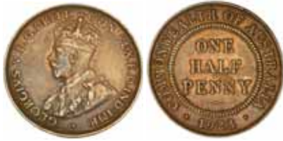
2108* George V, 1923. Cleaned otherwise nearly very fine. $1,500