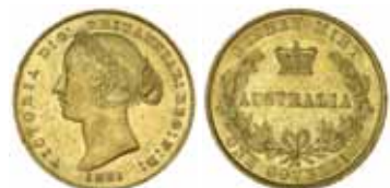
2144* Queen Victoria , second type, 1861. Small digs and scratches otherwise smooth fields and extremely fine. $750