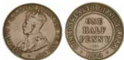
2113* George V, 1923. Evenly worn, fine. $1,000