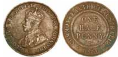
2117* George V, 1923. Verdigris, light brown rim nicks otherwise fine. $800