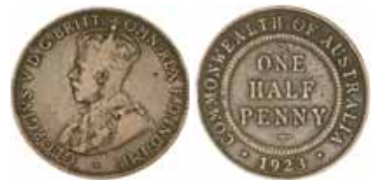
2119* George V, 1923. Toned and somewhat pitted, otherwise nearly fine. $700