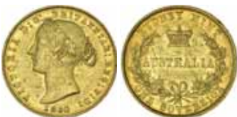
2139* Queen Victoria , second type, 1860. Surface marked otherwise nearly extremely fine and rare. $1,500