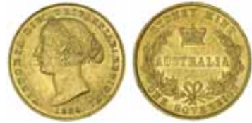
2140* Queen Victoria , second type, 1860. Scratches on portrait otherwise good very fine and rare. $400