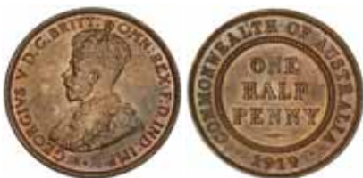
Lot 2103 part

2102 George V , 1919. Some toning, otherwise choice uncirculated. (2) $500