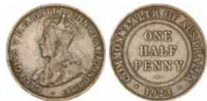
2118* George V, 1923. Obverse scratched, otherwise very good/nearly fine. $750