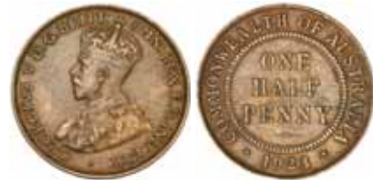
2116* George V, 1923. Cleaned otherwise good fine. $800