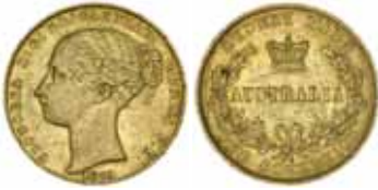
2134* Queen Victoria , first type, 1855. Good fine and rare. $2,000