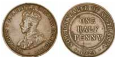
2112* George V, 1923. Damage on jaw otherwise good fine. $1,000