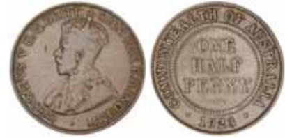
2115* George V, 1923. Good fine. $1,000