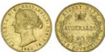
2138* Queen Victoria , second type, 1859. Very fine. $400