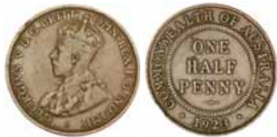
2111* George V, 1923. Reverse rim filed at 8 o'clock otherwise fine. $1,200