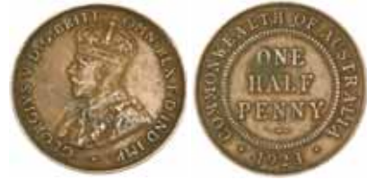
2114* George V, 1923. Surface damage otherwise medium brown patina, nearly very fine. $1,000