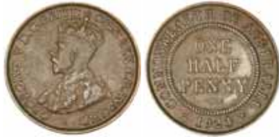
2109* George V, 1923. Diagnostic peripheral die breaks on both obverse and reverse, fine. $1,500