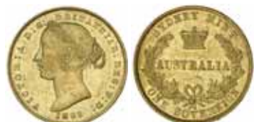
2145* Queen Victoria , second type, 1861. Good very fine. $750