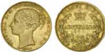
2136* Queen Victoria , first type, 1856. Nearly fine/ very good. $1,500