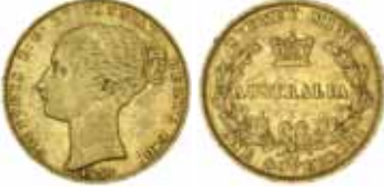
2135* Queen Victoria , first type, 1856. Good fine and rare. $2,000