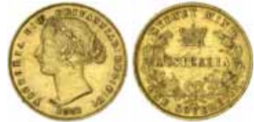
2143 Queen Victoria , second type, 1860. Nearly fine. (2) $550