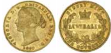
2141* Queen Victoria , second type, 1860. Obverse rim nick at 2 o'clock otherwise good fine and very scarce. $500