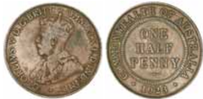
2110* George V, 1923. Slight green verdigris behind head otherwise good fine. $1,250