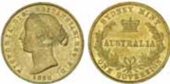
2137* Queen Victoria , second type, 1858. Surface marking otherwise good very fine and rare. $1,000