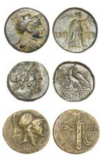
Lot 3271 part