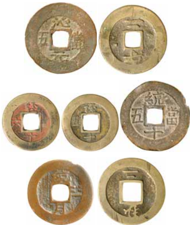
lot 2330, part (reverses)