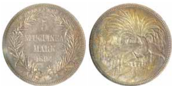
752* German New Guinea , five mark, 1894A. Dull iridescent toning, lightest friction otherwise nearly uncirculated and rare in this condition. $6,000

Purchased from Spink Australia in 1978 (ex U.S.A sale lot 466)