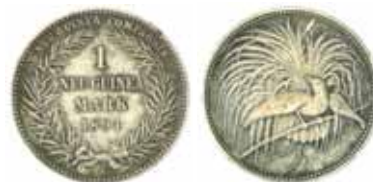
757* German New Guinea , one mark, 1894 A. Dark toned surface, part cleaned otherwise good very fine. $300