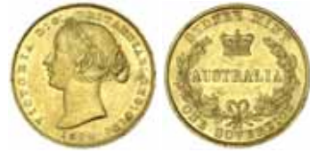
632* Queen Victoria , second type, 1864. Evidence of die clashing, minor contact marks otherwise extremely fine. $600