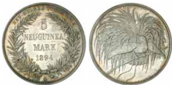
751* German New Guinea , proof five mark, 1894 A. Attractive light iridescent tone, brilliant, virtually FDC and rare. $5,000

Purchased from Spink Australia in 1978 (ex U.S.A sale lot 466)