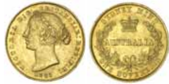
634* Queen Victoria , second type, 1865. Graffito X scratched under bust beside date otherwise nearly extremely fine. $1,000