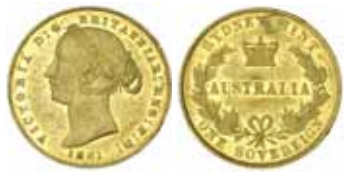
631* Queen Victoria , second type, 1861. Surface marks, flaw otherwise with mint bloom, nearly extremely fine. $300