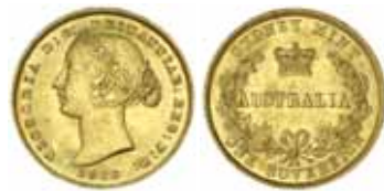
637* Queen Victoria , second type, 1866. Die break on reverse at 8 o'clock, well struck good extremely fine. $600