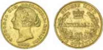
627* Queen Victoria , second type, 1860. Rim bruise on obverse at 11 o'clock, minor contact marks otherwise nearly very fine/very fine and rare. $750