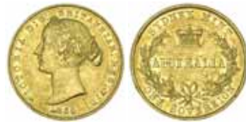
635* Queen Victoria , second type, 1865. Good very fine. $500