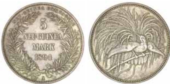
754* German New Guinea , five mark, 1894A. Some toning, otherwise very fine. $1,200