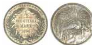
760* German New Guinea , half mark, 1894A. Patchy grey tone on reverse, obverse with brilliant blue grey fields, nearly uncirculated. $700