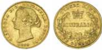
625* Queen Victoria , second type, 1859. Nearly very fine. $450