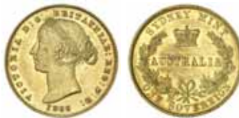
636* Queen Victoria , second type, 1866. Contact mark on chin otherwise good extremely fine. $900