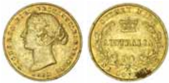
628* Queen Victoria , second type, 1860. Good fine and rare. $400