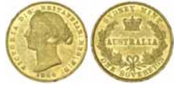
633* Queen Victoria , second type, 1864. Nearly extremely fine. $400