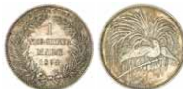
758* German New Guinea , one mark, 1894A. Very fine. $300