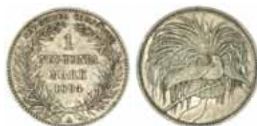
759* German New Guinea , one mark, 1894A. Light tone with carbon spot, very fine. $300