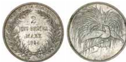
756* German New Guinea , two mark, 1894A. Cleaned otherwise very fine. $600