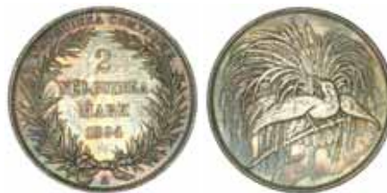
755* German New Guinea , two mark, 1894A. Peripheral tones, minor rubbing otherwise nearly uncirculated and rare in this condition. $1,500