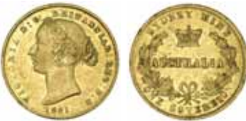
629* Queen Victoria , second type, 1861. Surface marks otherwise very fine. $350