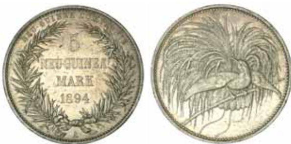
753* German New Guinea , five mark, 1894A. Good very fine. $2,000