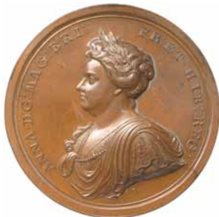
Lot 2221 obverse