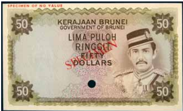
Lot 2414 part