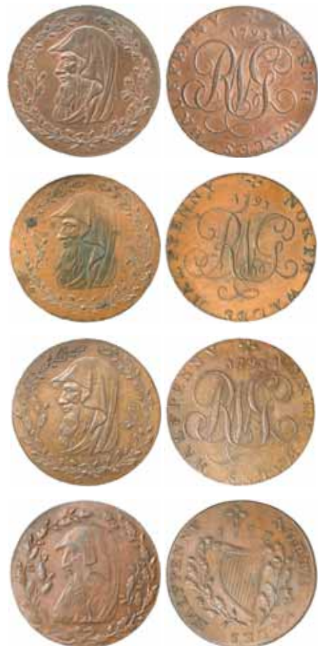
Lot 2197 part