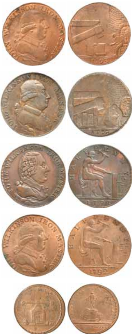
Lot 2195 part