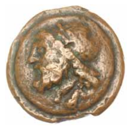
Lot 3333 obverse